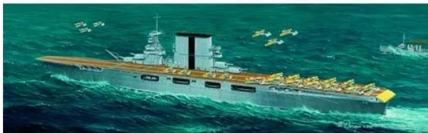
Image: An artistic rendering depicting the USS Saratoga CV-3 aircraft carrier sailing on the open sea, with several aircraft in flight around it. This image represents the ship in its operational environment.

Once assembled, your USS Saratoga model can be displayed on its included stand (if applicable) or in a custom diorama. Choose a stable, level surface away from direct sunlight, extreme temperatures, and high humidity to preserve the model's finish and structural integrity.