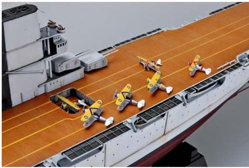
Image: A detailed view of the flight deck of the Trumpeter USS Saratoga model, featuring several biplane aircraft positioned on the deck, highlighting the scale and detail of the included air wing.

Image: A close-up view of the island superstructure and a section of the flight deck of the Trumpeter USS Saratoga model. Details such as lifeboats, deck equipment, and small aircraft are visible.