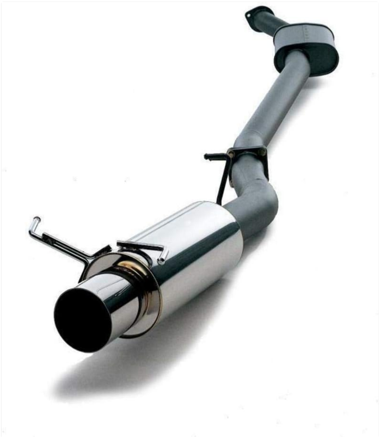
Image: The HKS 32003-BT001 Hi-Power Exhaust system, showcasing its stainless steel muffler and piping.