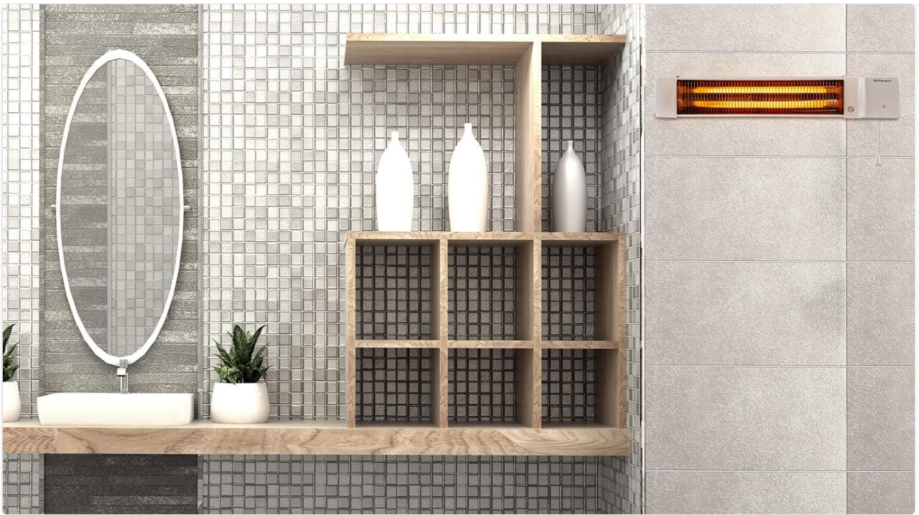
Figure 4.2: Example of the Orbegozo BB 5002 heater installed on a wall in a bathroom setting.