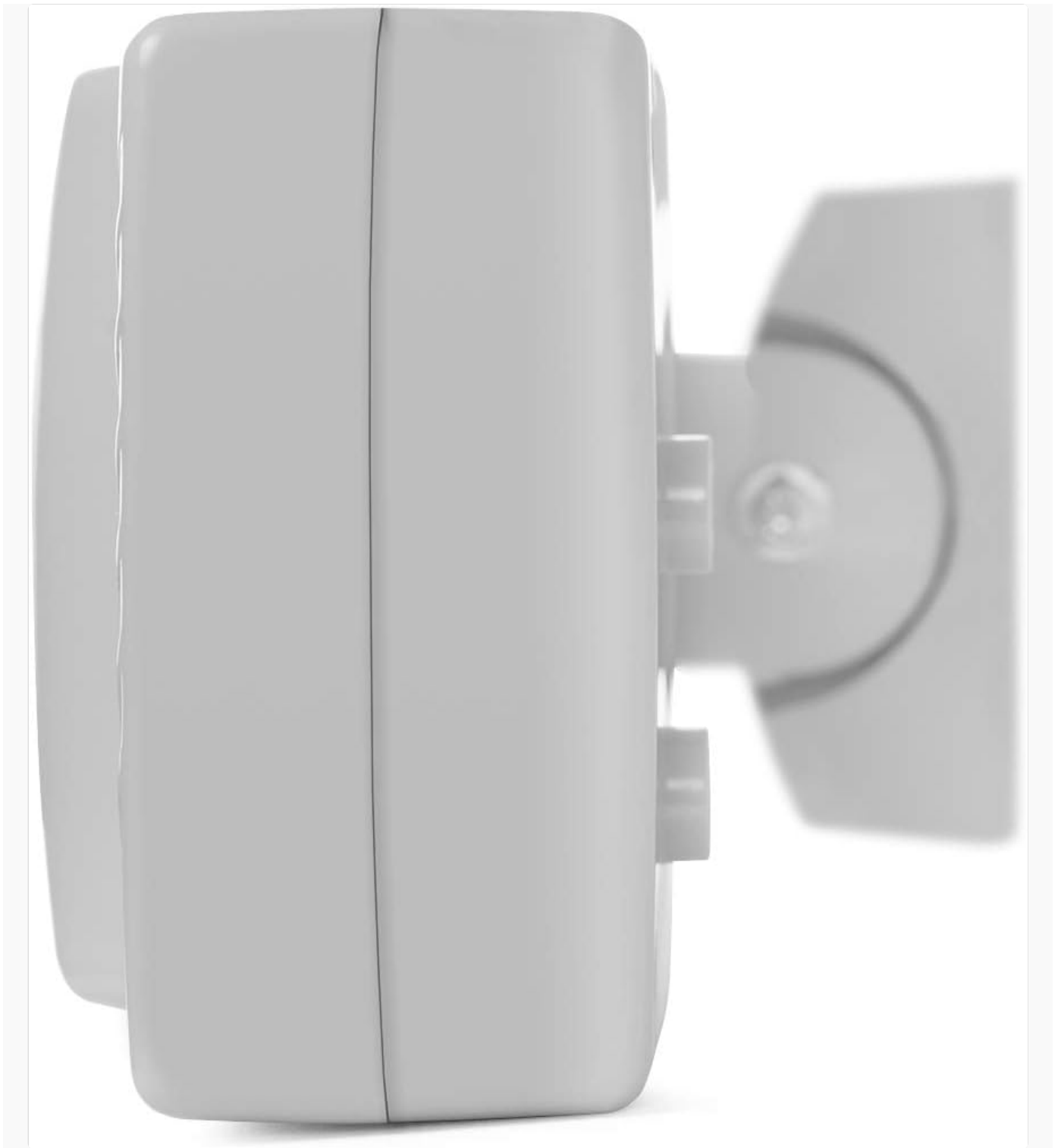
Figure 4.1: Side view illustrating the mounting bracket and the heater's profile for wall installation.