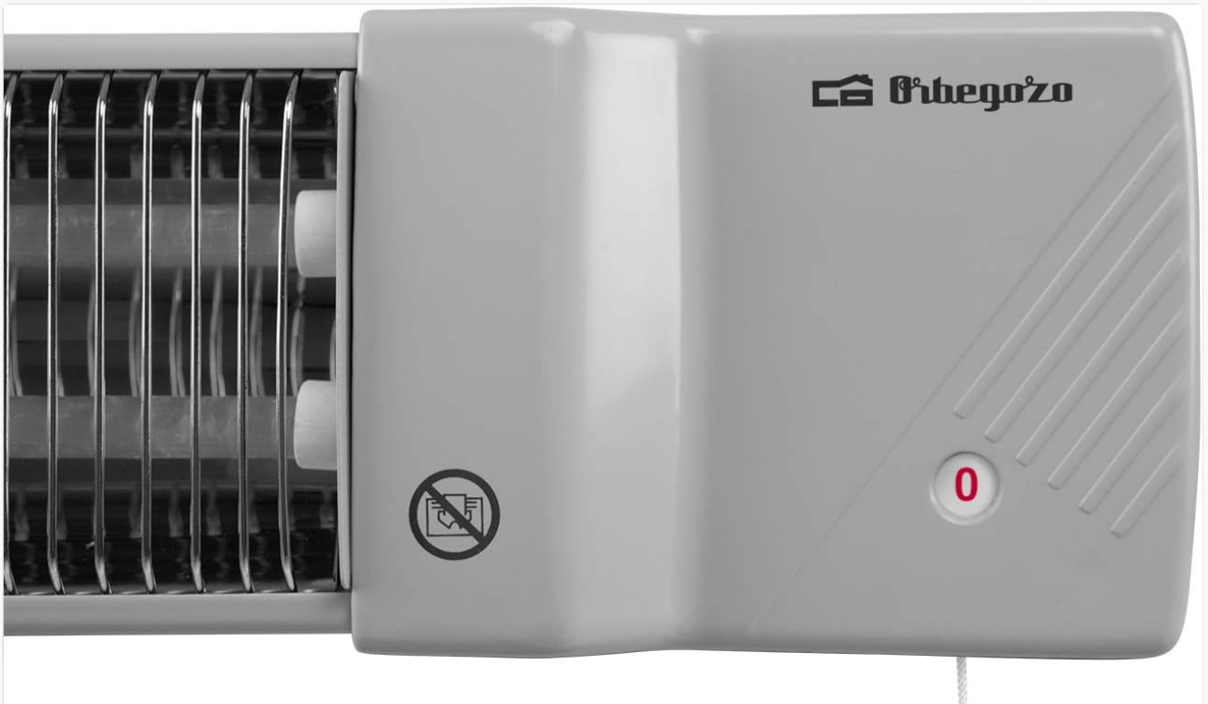
Figure 5.1: Close-up view of the control panel, highlighting the pull string for operation.

The Orbegozo BB 5002 heater is operated using a simple pull string mechanism.