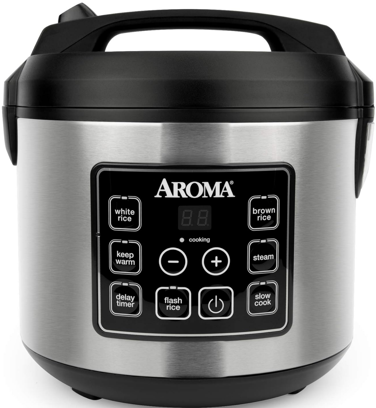
Image: Front view of the Aroma Housewares Digital Rice Cooker, showing the stainless steel exterior and the digital control panel with various function buttons.

The Aroma ARC-150SB is equipped with easy-to-use, programmable digital controls. Key features include: