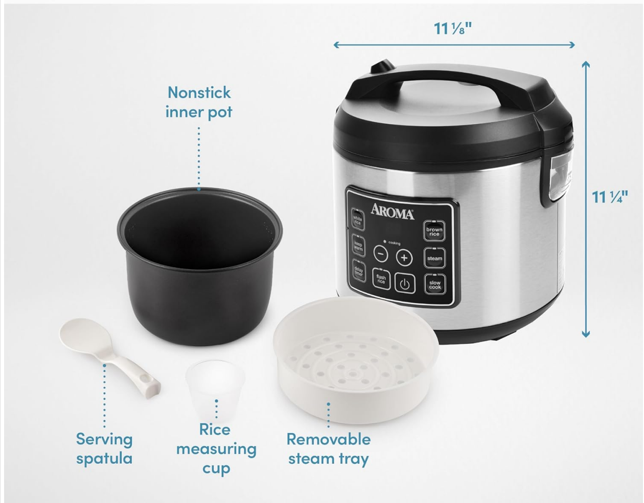
Image: Exploded view of the Aroma Rice Cooker showing its main components: the nonstick inner pot, serving spatula, rice measuring cup, and removable steam tray.

Cook up to 20 cooked rice cups of white or brown rice.