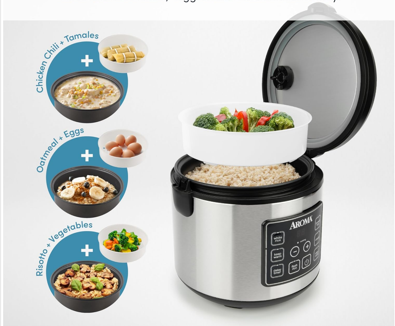
Image: The Aroma Rice Cooker with the steam tray in place, illustrating how to prepare one-pot meals by steaming ingredients above rice or other dishes cooking in the main pot.

Steam and cook meat, veggies and more simultaneously.