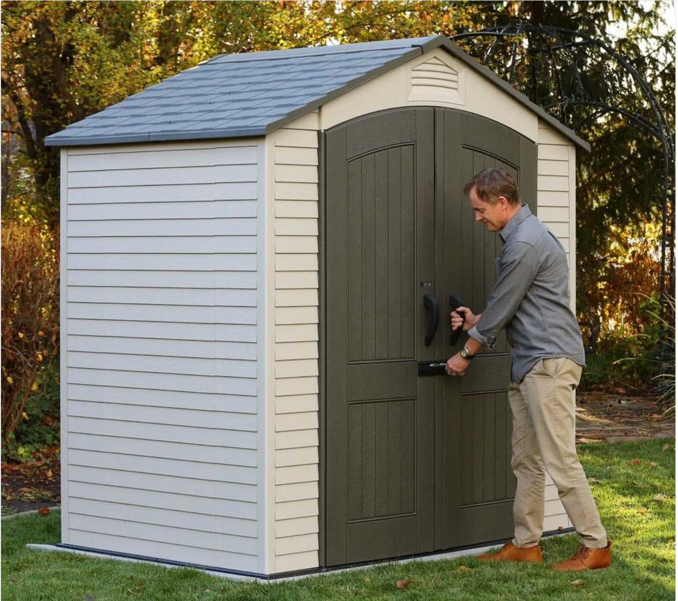
Image: The Lifetime 60057 Outdoor Storage Shed with its double doors closed, showcasing its exterior appearance in a garden setting.

The shed features double-hinged doors that open wide for easy access to the interior. The doors are equipped with handles and a latch for security, which can be secured with a padlock (not included). The interior includes a full-length skylight for natural light and screened vents for air circulation.