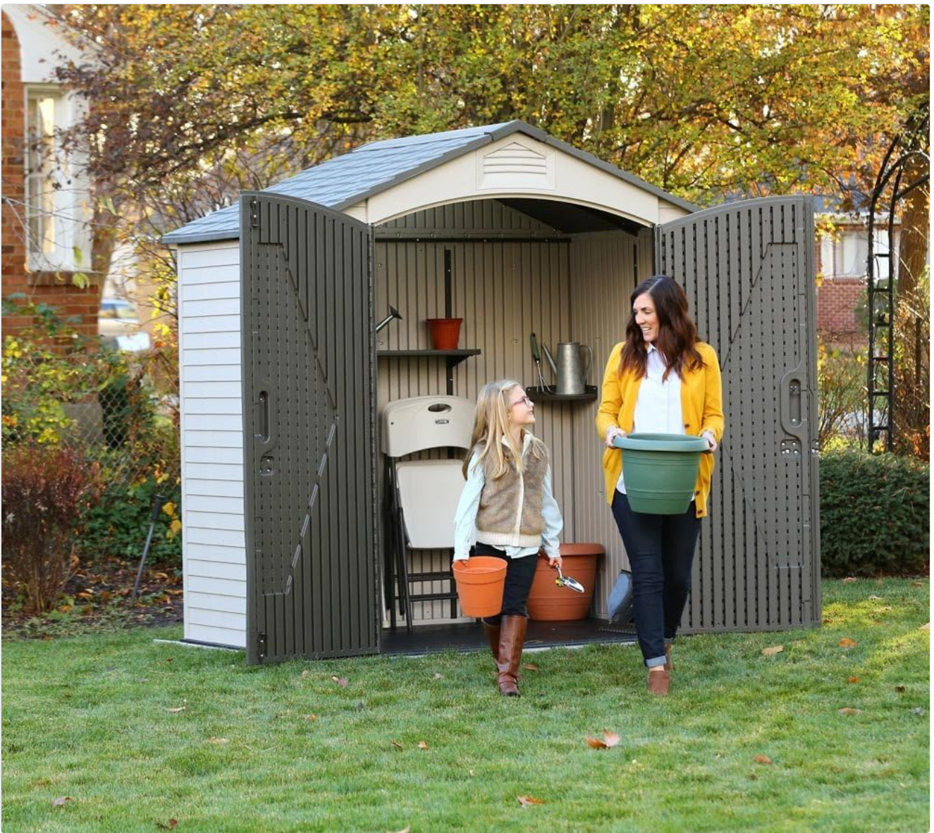
Image: The Lifetime 60057 Outdoor Storage Shed with its double doors open, revealing the interior storage area. A woman and child are walking out of the shed, carrying gardening items.