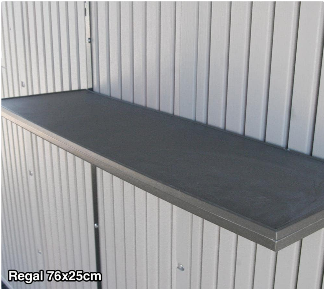
Image: A close-up view of one of the interior shelves, demonstrating its size and how it can be used for storage.