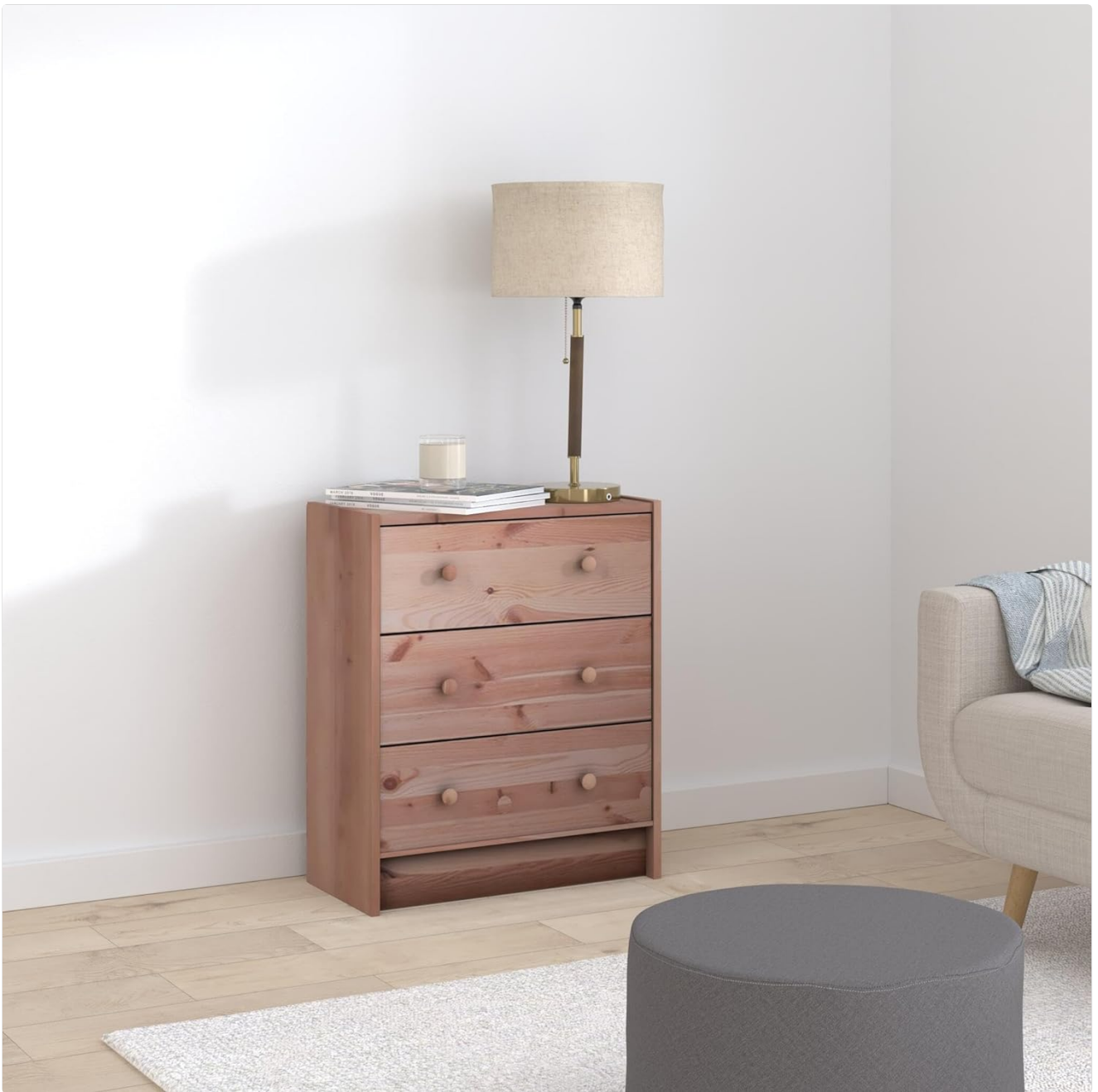
Figure 2: The RAST dresser integrated into a bedroom setting, demonstrating its compact size and utility as a nightstand or small storage unit.