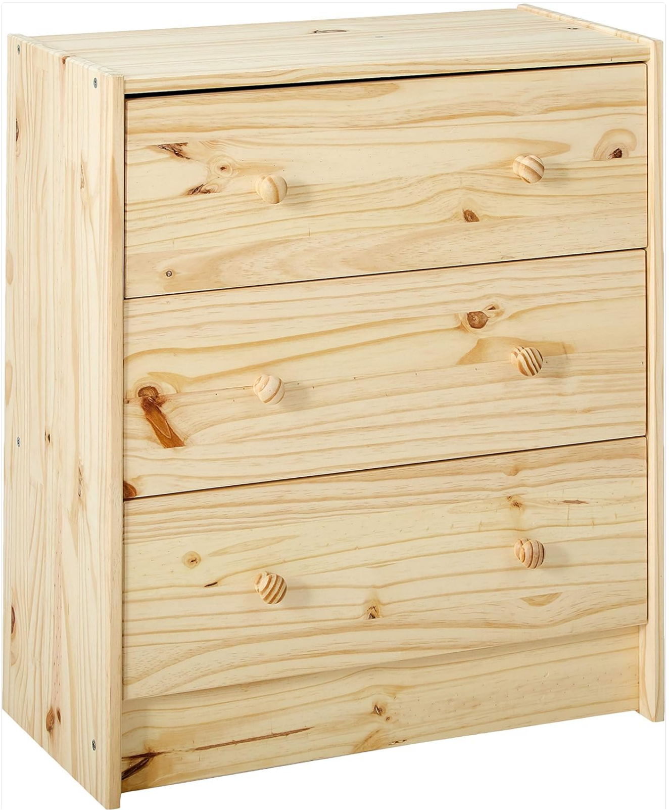
Figure 1: Front view of the IKEA RAST dresser, showcasing its natural wood finish and three drawers.