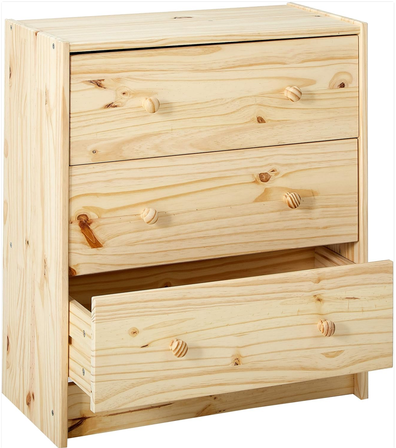
Figure 3: A drawer of the RAST dresser pulled open, illustrating the internal storage capacity.