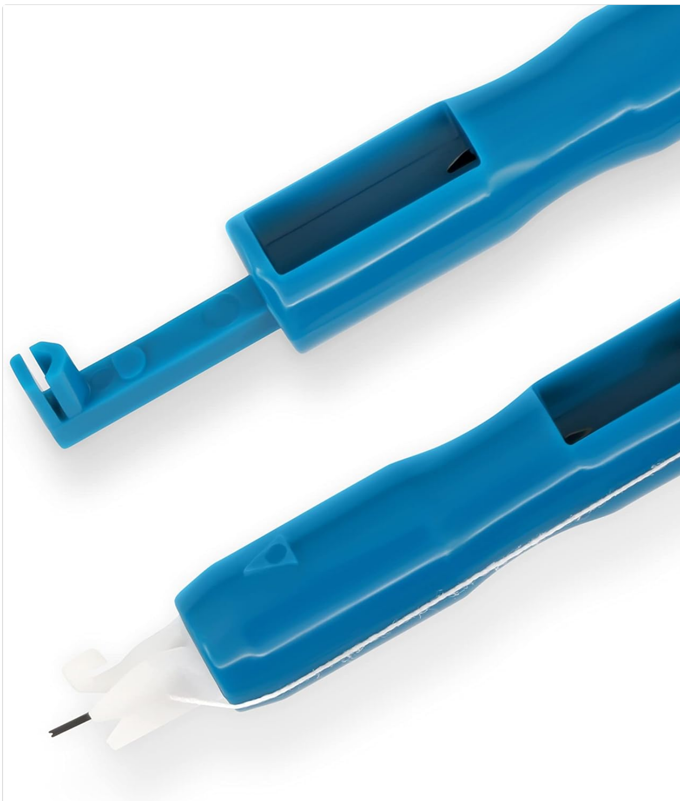
Image: Demonstrates threading a needle on a sewing machine using the Dritz tool.