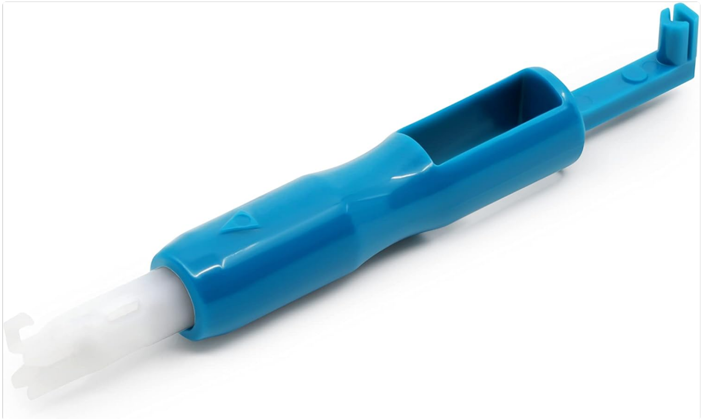
Image: Demonstrates inserting a needle into a sewing machine using the Dritz tool.