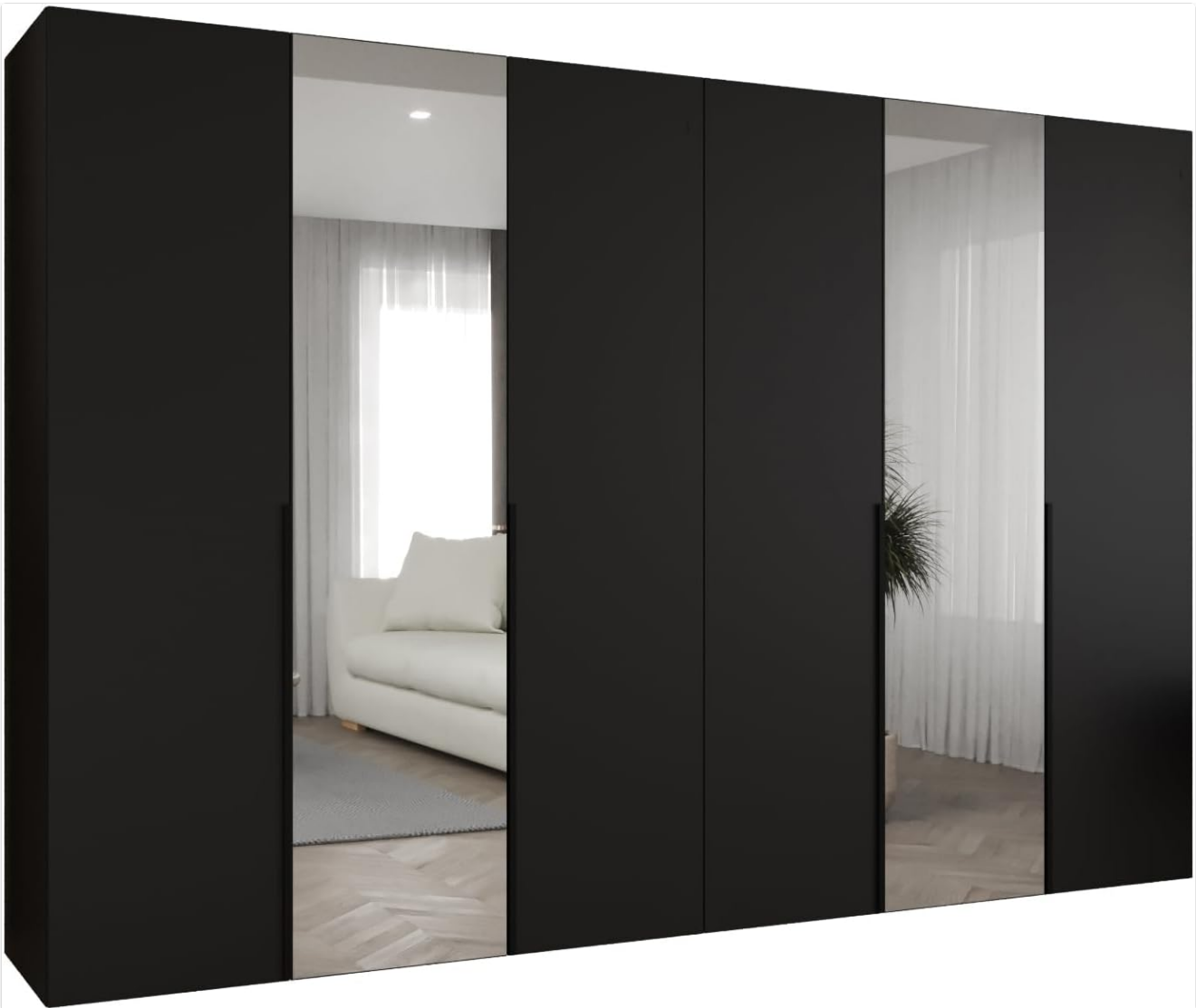
Front view of the assembled ABIKSMEBLE Alicante 2 wardrobe, showcasing its six black doors, with two central doors featuring integrated mirrors.