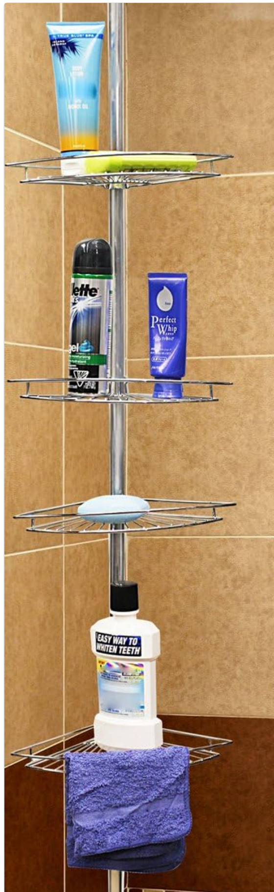
Image: The Home Basics 4 Tier Corner Shower Shelf installed in a shower corner, demonstrating its practical use and how it fits against tiled walls.