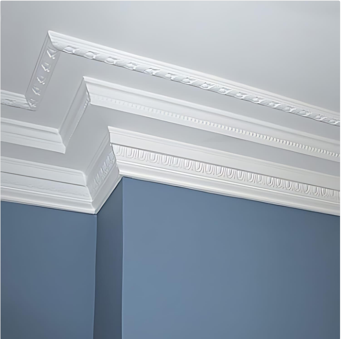
Image: Visual representation of key product features including knock resistance, moisture resistance, primed surface, ease of installation, and paintability.