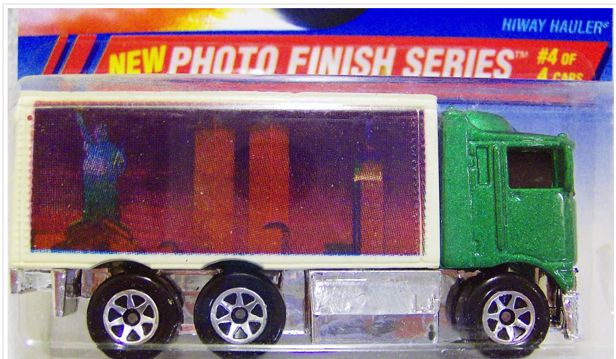
Image 2: A close-up view of the Hot Wheels Hiway Hauler's trailer, clearly showing the detailed New York scene featuring the World Trade Center towers. The truck cab is green, and the trailer is white with the graphic.