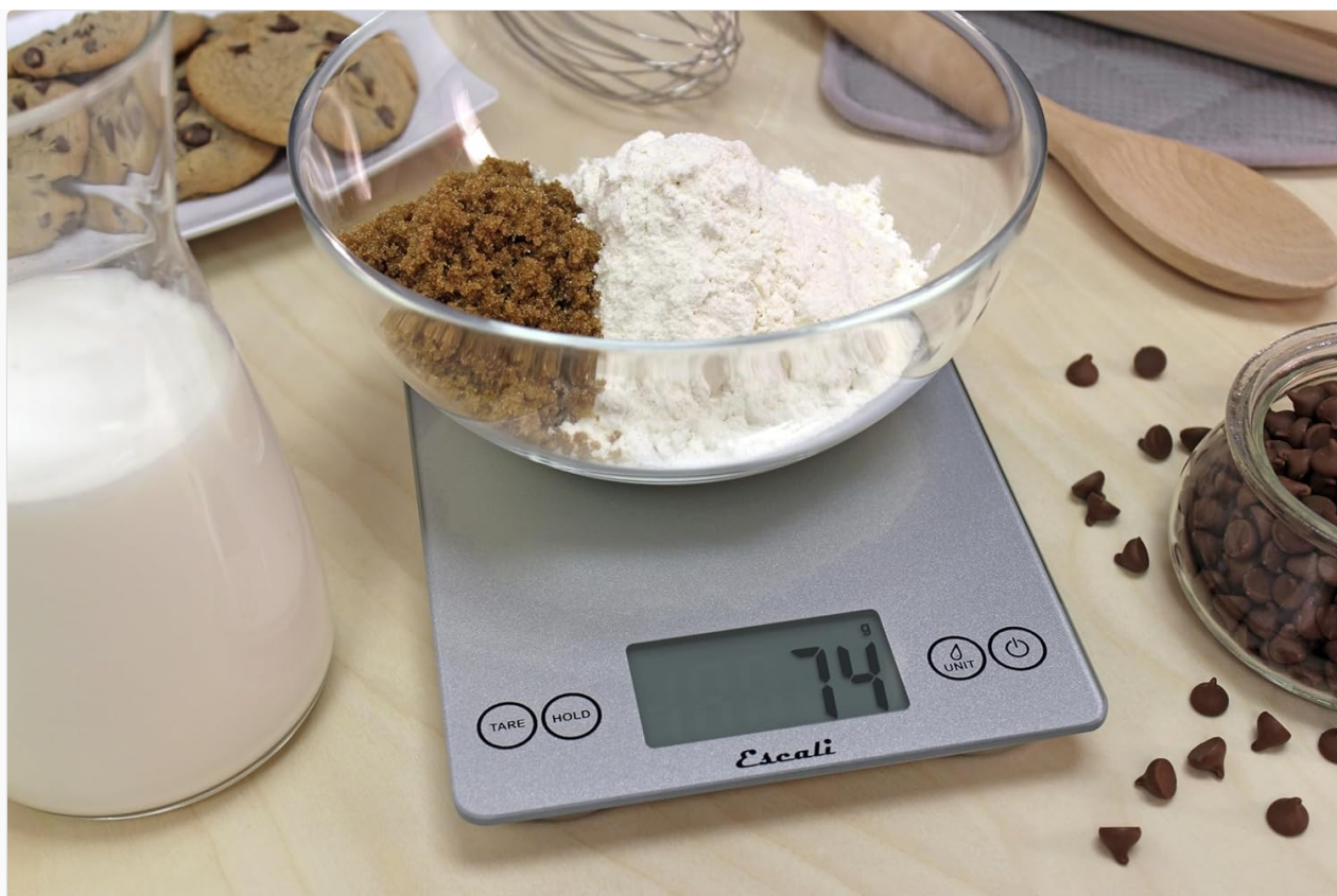
Figure 5: Accurate weighing of dry ingredients.