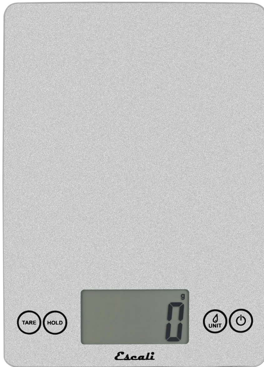
Figure 1: Escali Arti Glass Food Scale, Shiny Silver