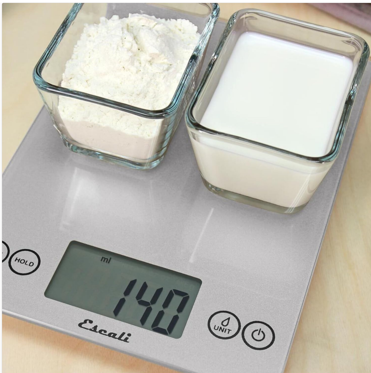
Figure 6: Measuring both liquid and dry ingredients.