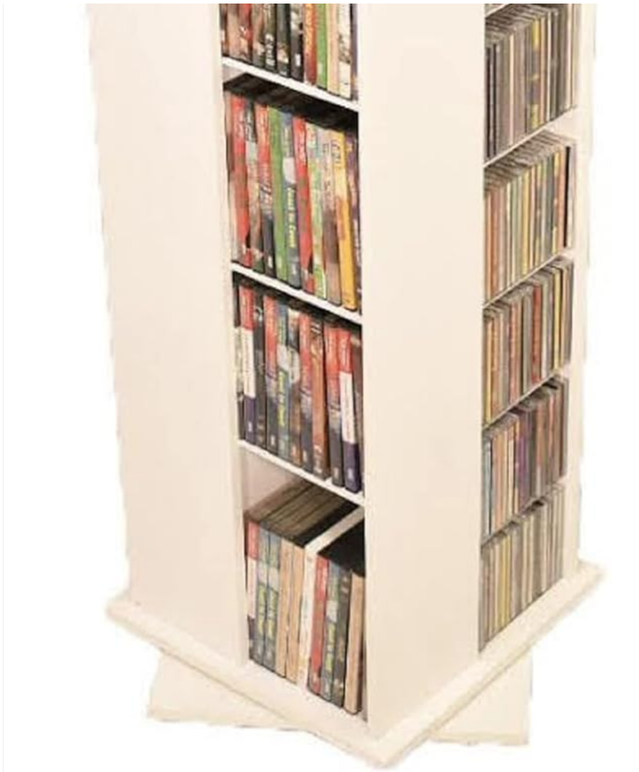
Image 1.1: The Venture Horizon Revolving Media Tower 600 in White, showcasing its capacity when filled with various media.