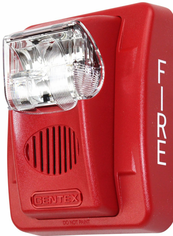
Figure 1: Front view of the Gentex GEC3-24WR unit, showing the red faceplate, horn grille, and clear strobe lens. A small window on the left displays the candela setting.