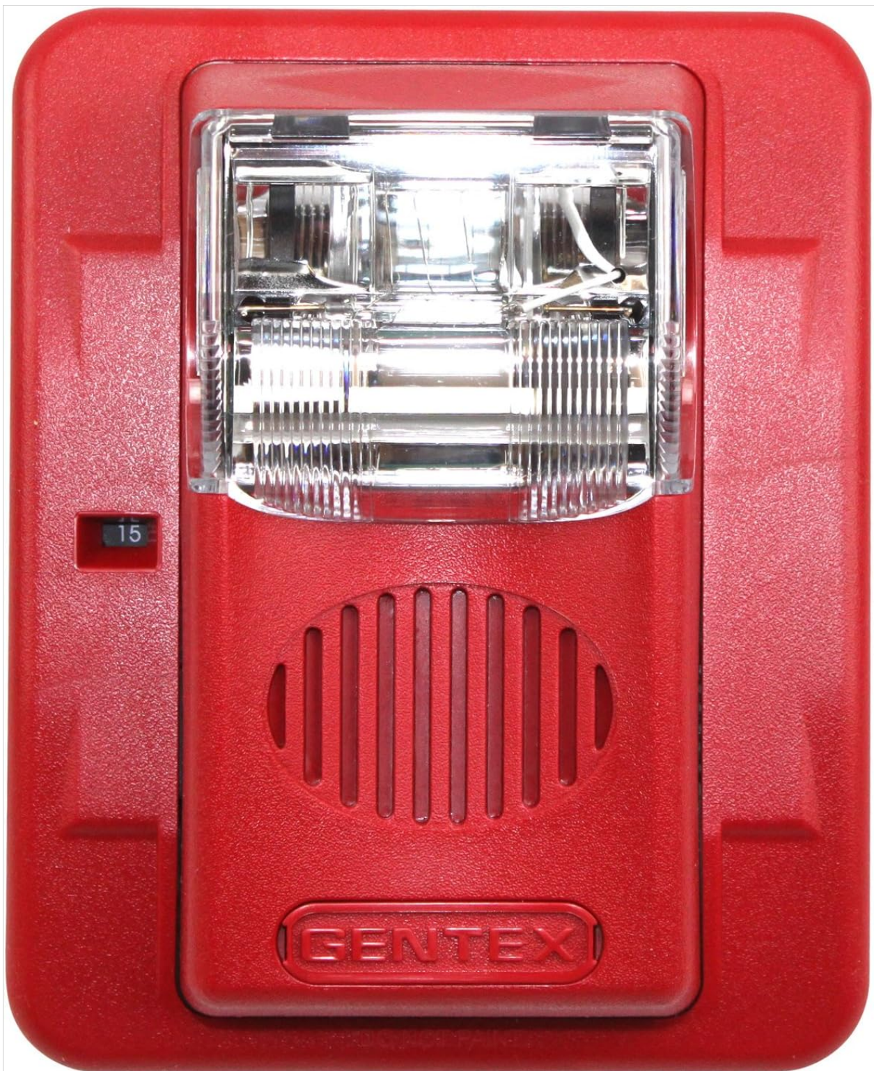
Figure 2: Close-up of the Gentex GEC3-24WR, highlighting the selectable candela setting, currently set to 15.