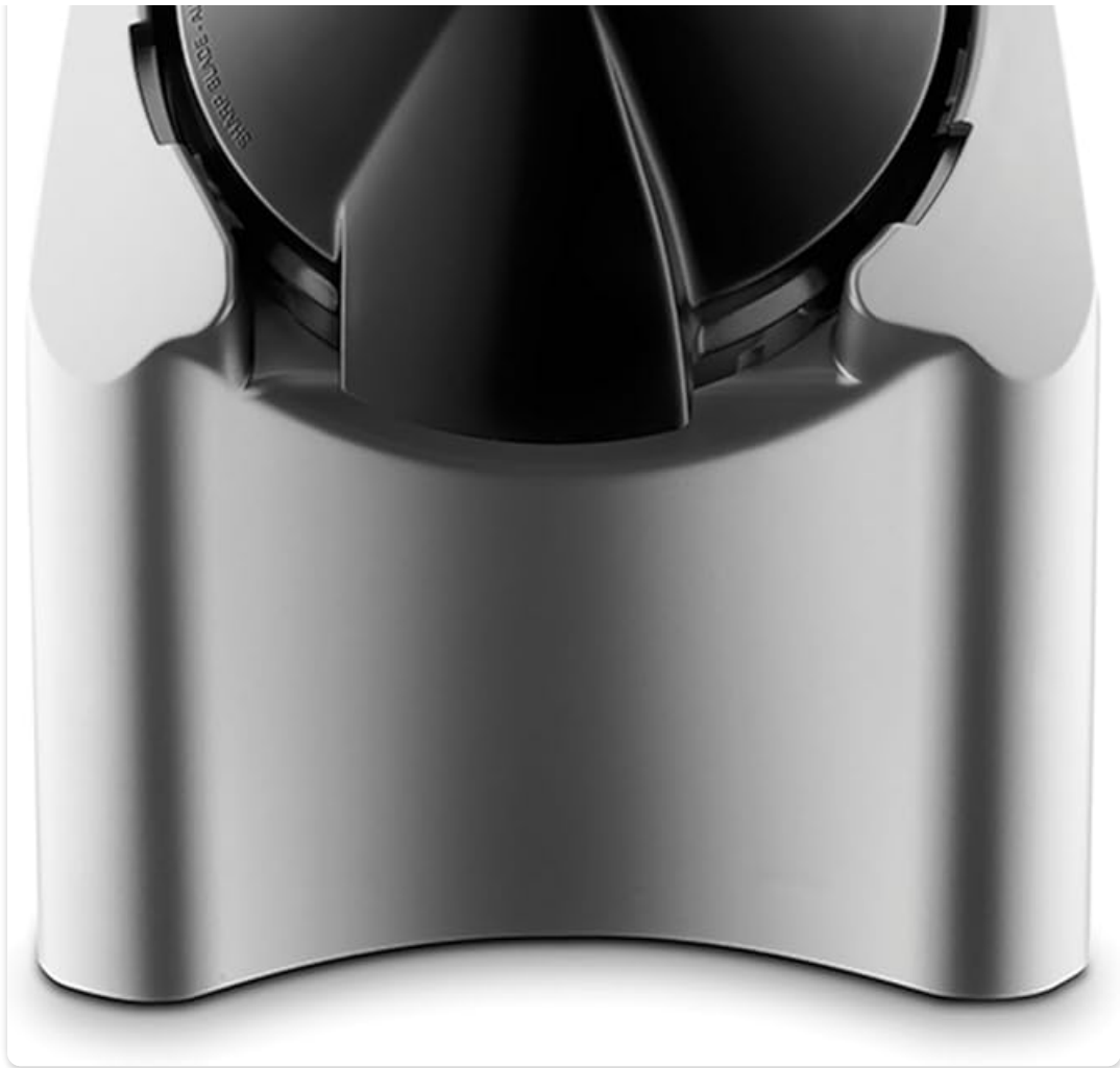
Front view of the Yonanas machine, showing its main parts.