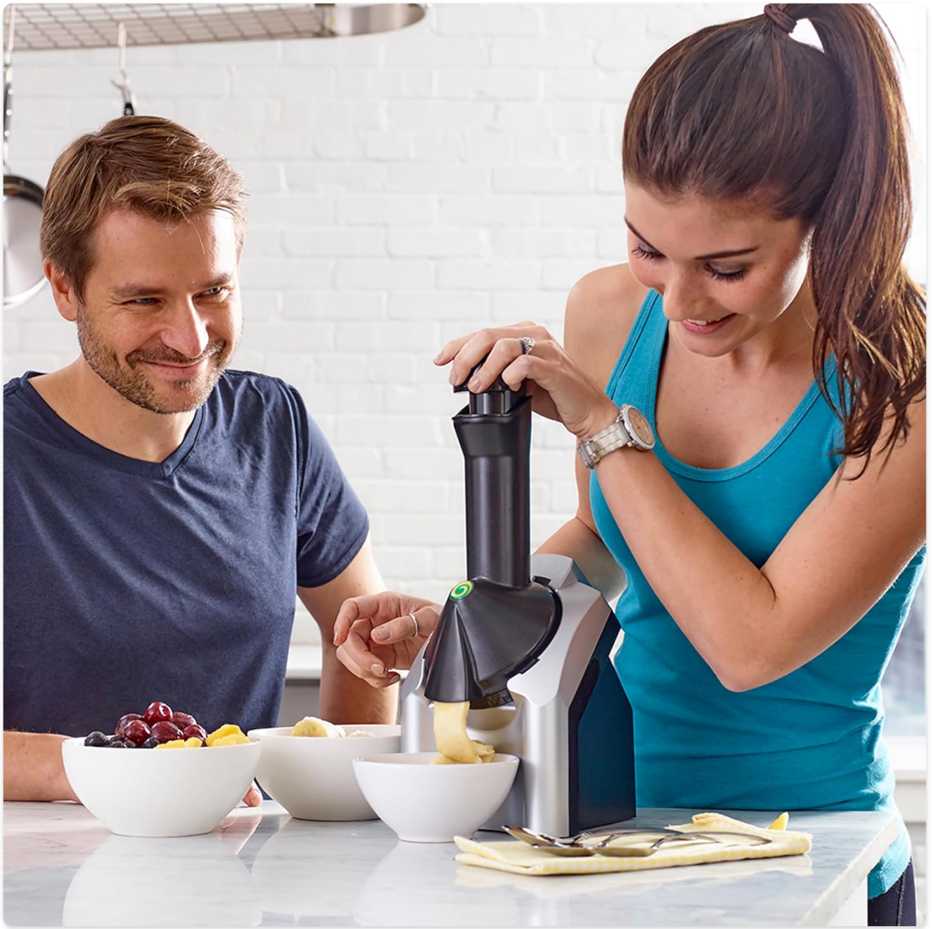
The Yonanas machine is simple and fun for all ages to use.