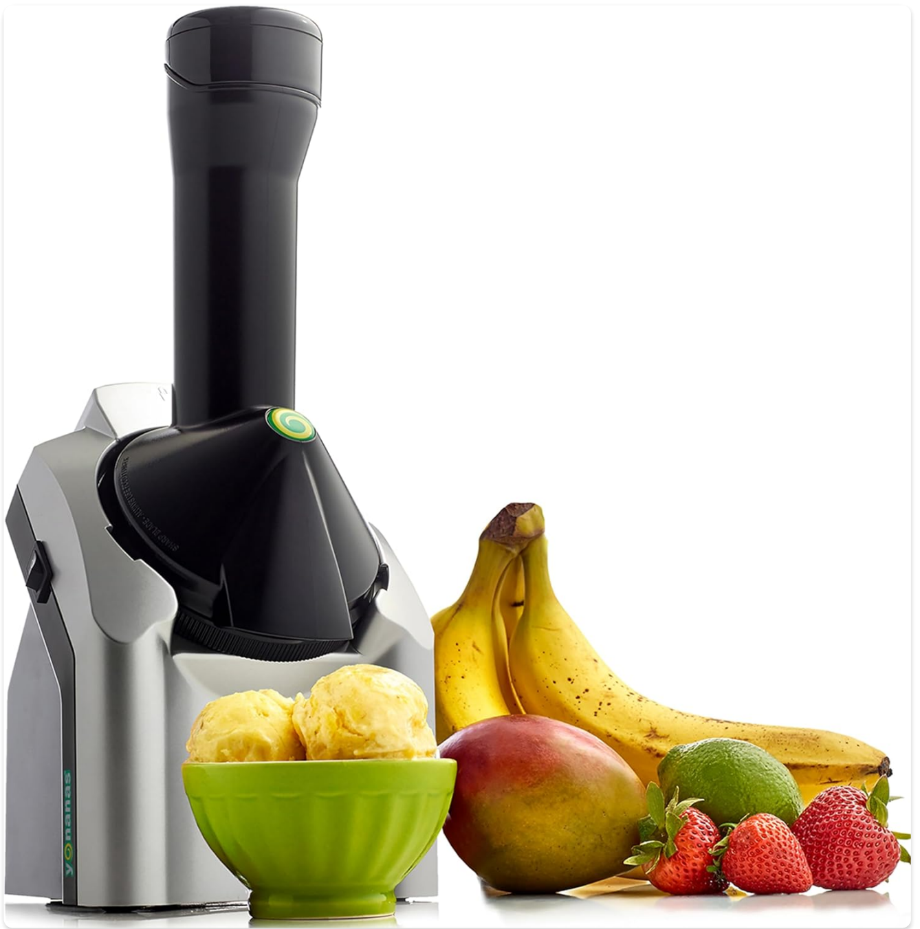
The Yonanas Classic Frozen Fruit Soft Serve Maker, ready to create healthy desserts.