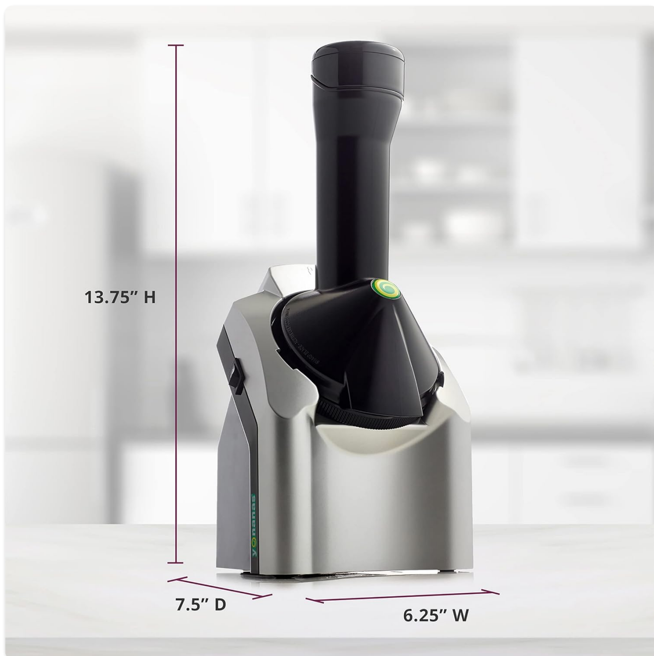
Dimensions of the Yonanas Classic Frozen Fruit Soft Serve Maker.