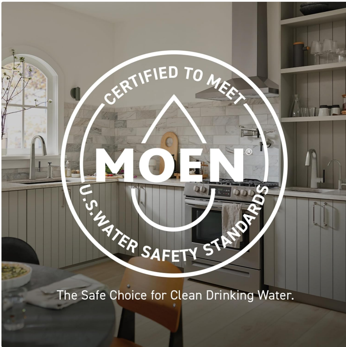
Image: Moen Certification. This image displays the Moen logo within a circle stating 'Certified to Meet U.S. Water Safety Standards', emphasizing the product's compliance with safety regulations for drinking water.