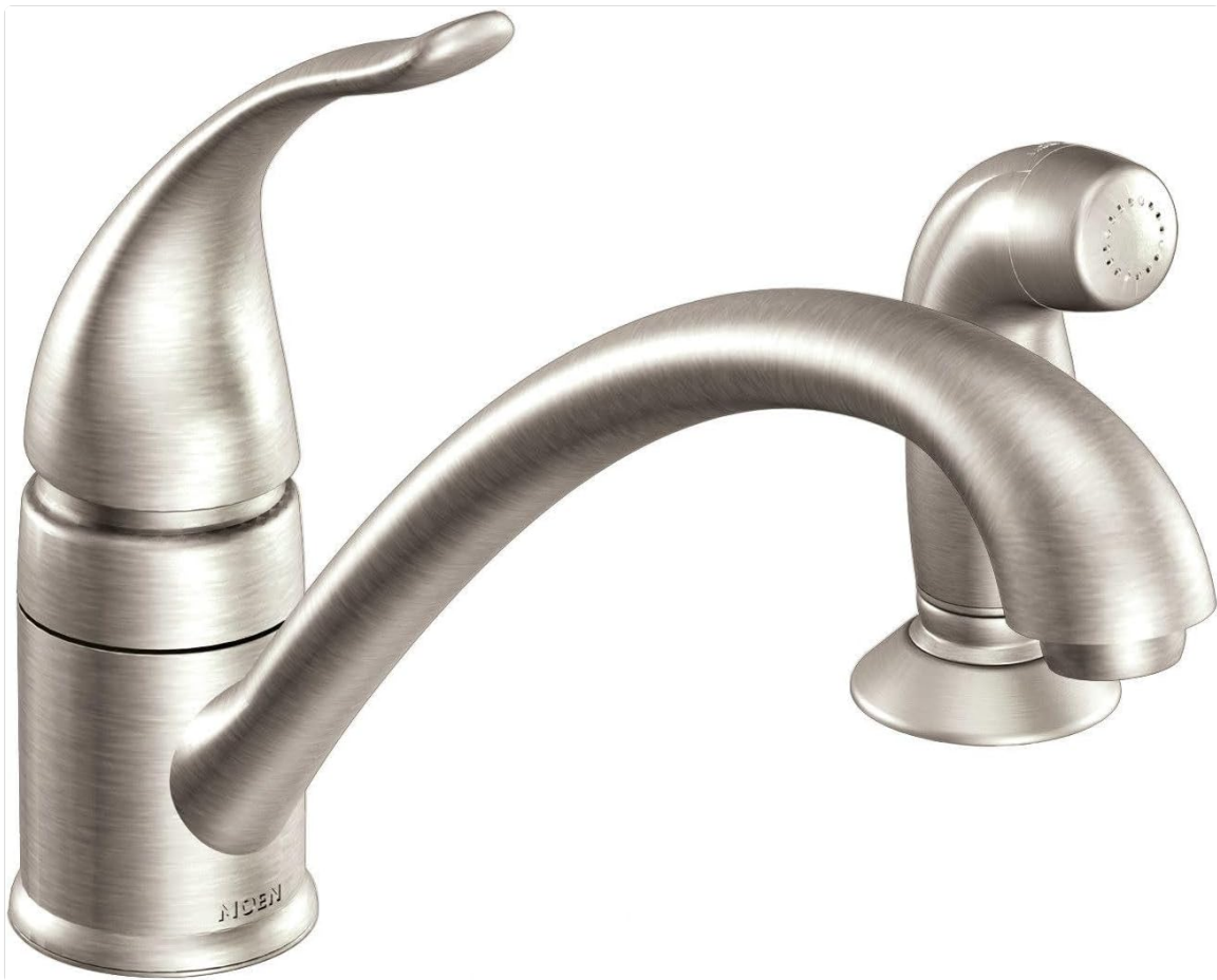
Image: Moen CA87480SRS Torrance Kitchen Faucet with Side Spray. This image shows the complete faucet unit with its single handle and separate side spray, all in a brushed stainless steel finish.