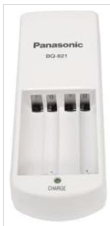
Figure 4.1: Front view of the Panasonic BQ-821 charger. It features four charging slots for AA or AAA batteries and a single green LED indicator at the bottom, labeled "CHARGE".