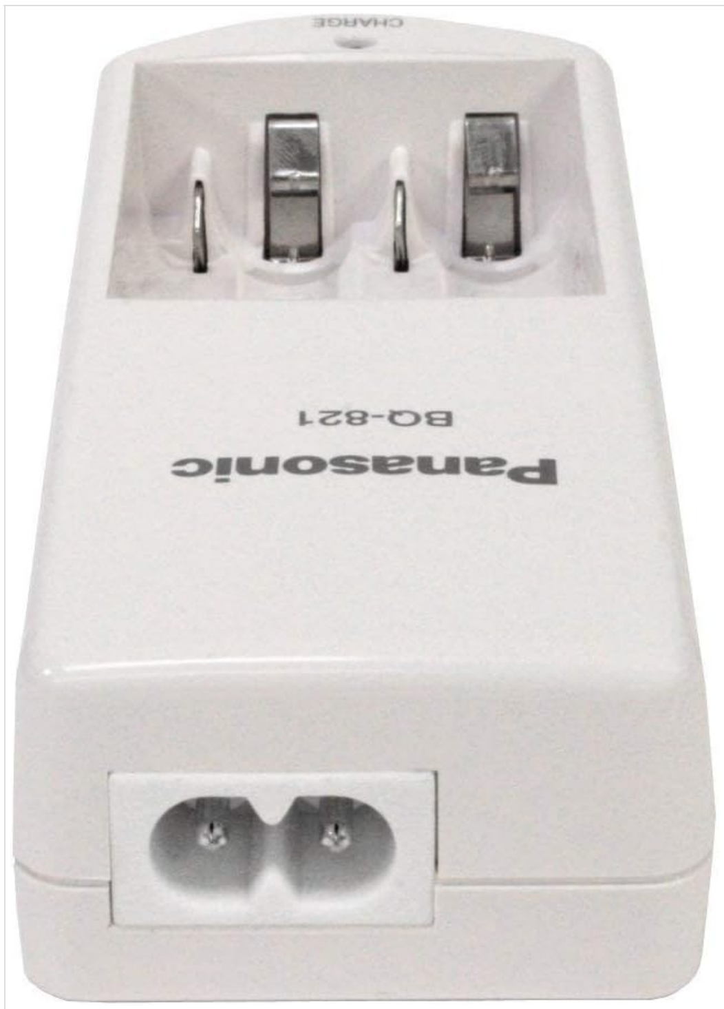
Figure 5.1: Rear view of the Panasonic BQ-821 charger. The power input port is clearly visible at the bottom, designed for a two-prong AC power cord.