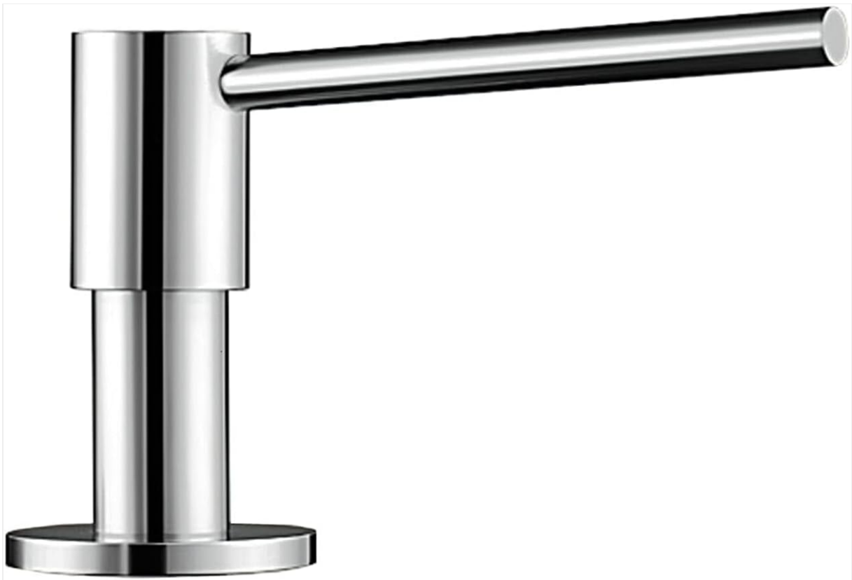
Figure 1: Front view of the Blanco Piona 517667 Chrome Dishwashing Liquid Dispenser. This image shows the sleek chrome finish and the design of the spout and pump mechanism.