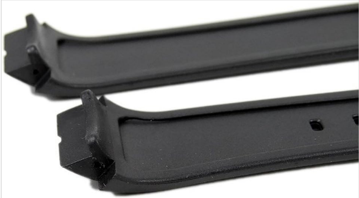
Figure 1: Close-up of the strap ends, illustrating the design for spring bar attachment.

Figure 1 shows a detailed view of the strap ends where the spring bars are inserted. Observe the precise cutouts designed to fit the watch lugs.