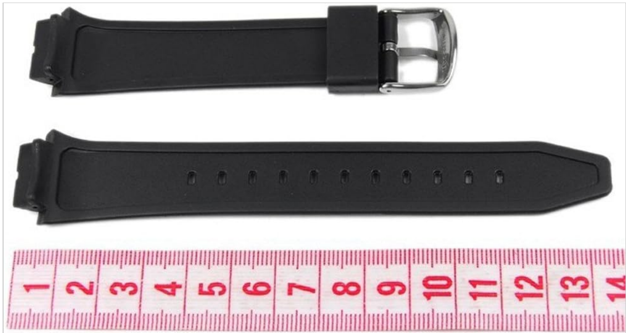
Figure 2: Full view of the watch strap with a ruler for scale, indicating overall dimensions.

Figure 2 provides a visual reference for the strap's length and general proportions, with a measuring tape for scale.