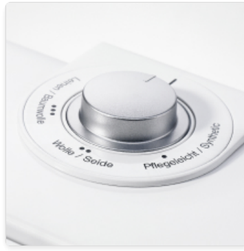
Figure 3: Temperature control dial with fabric settings.