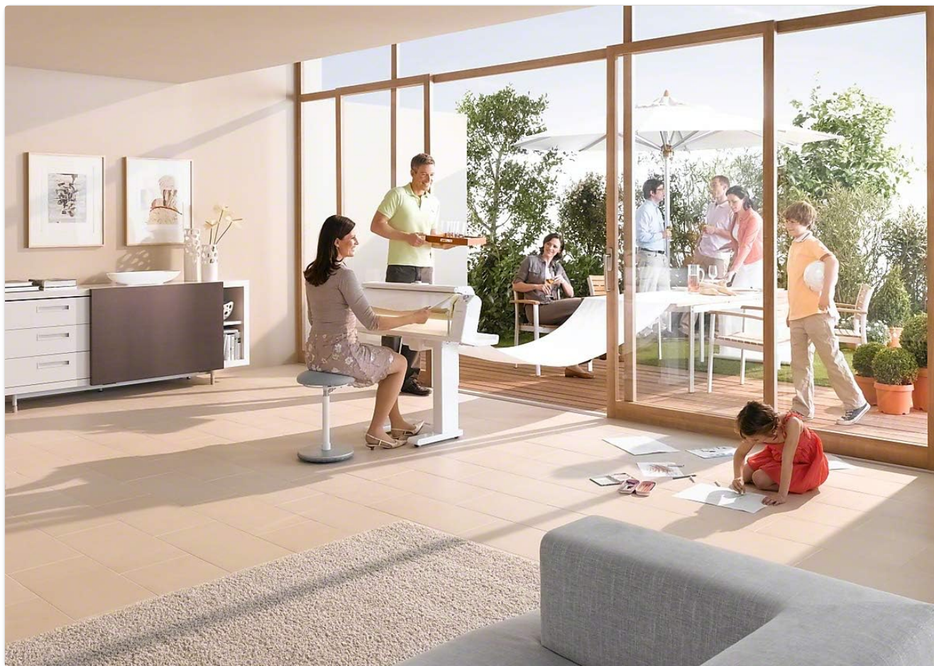
Figure 2: The rotary iron set up in a typical home setting.