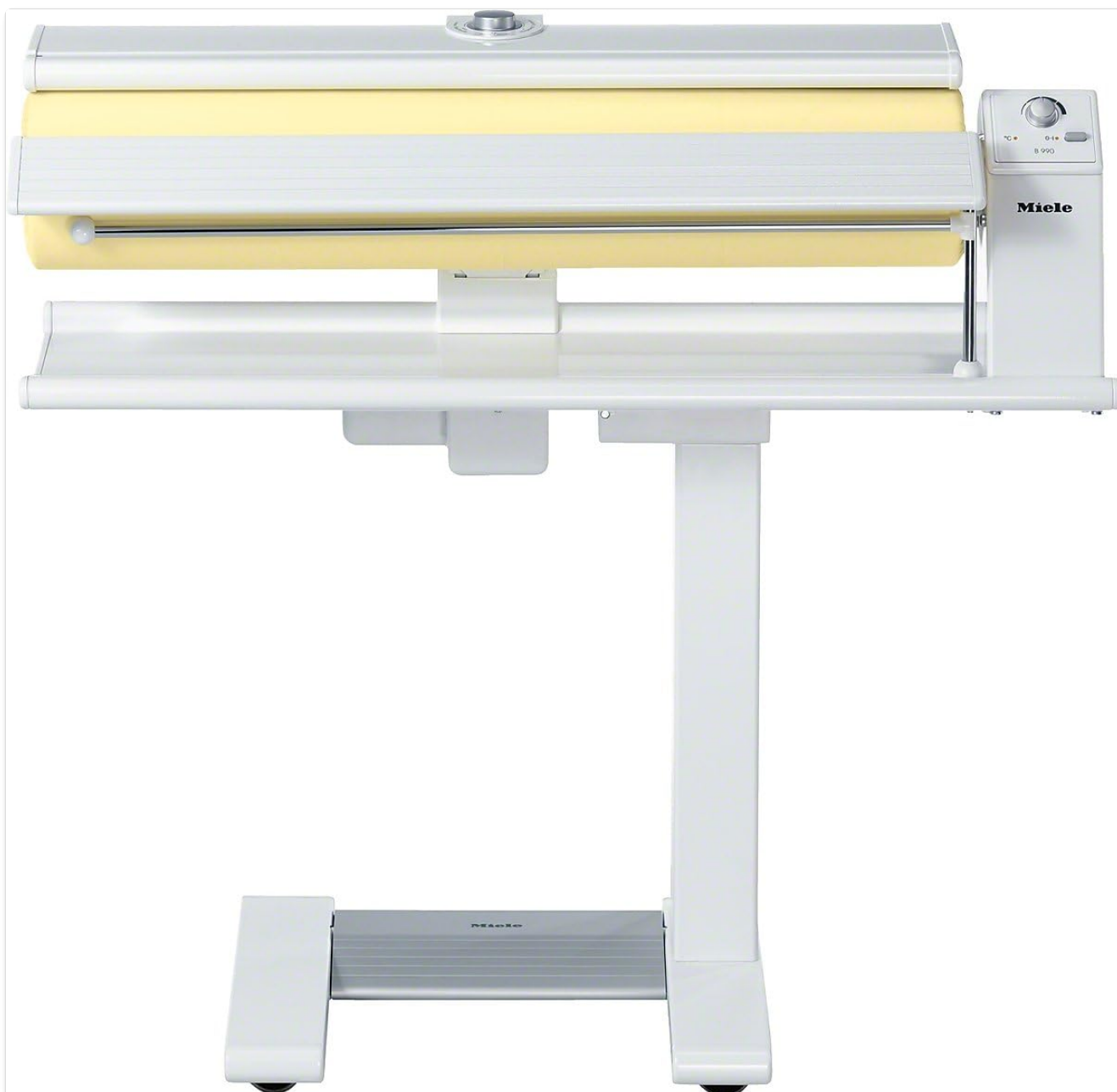
Figure 1: The Miele B990E Rotary Iron in its operational configuration.