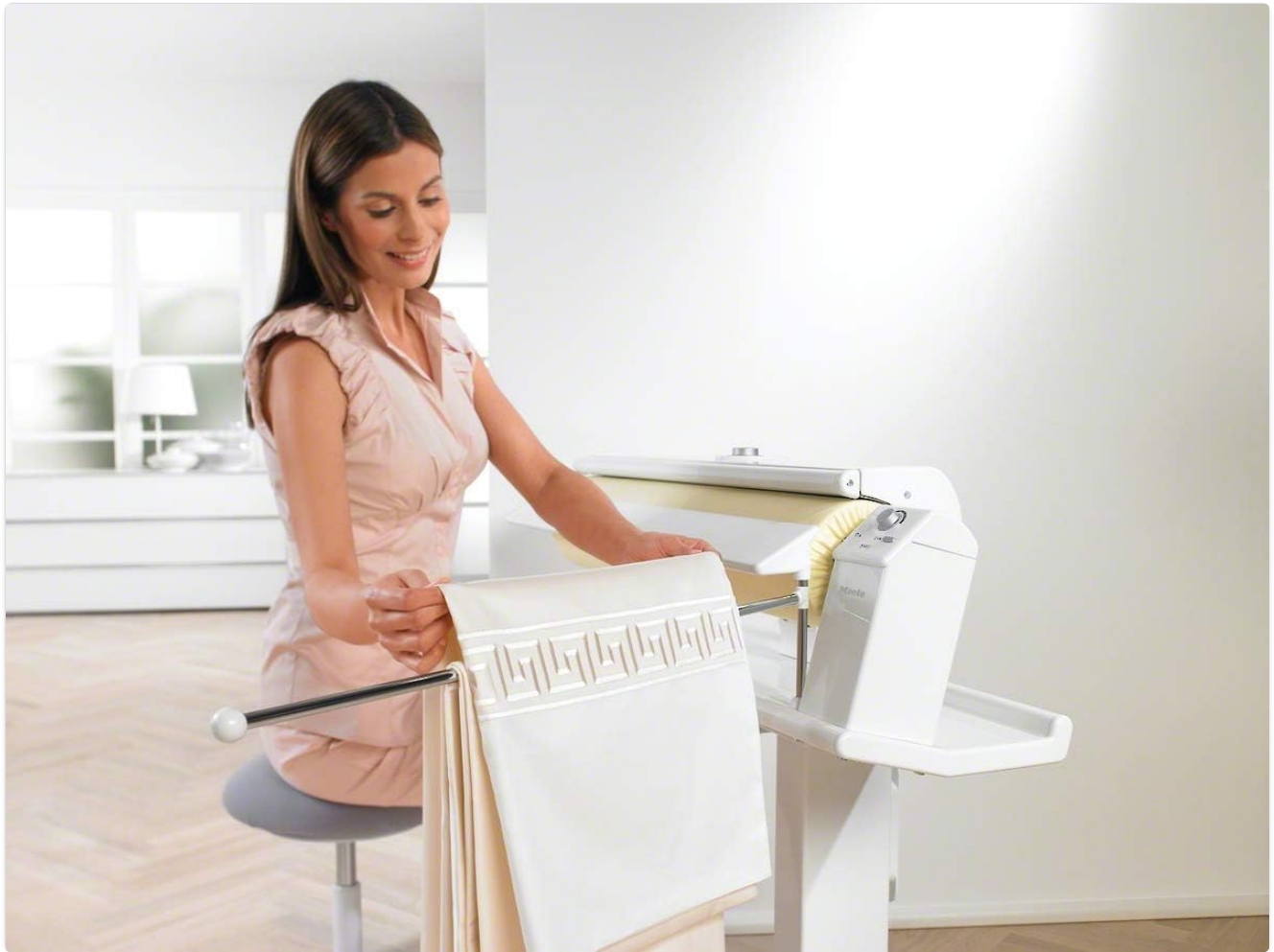
Figure 4: User demonstrating the feeding of fabric into the rotary iron.