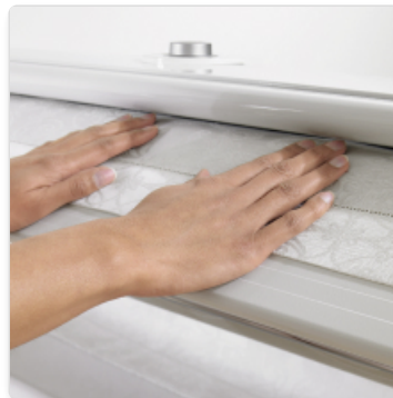
Figure 5: Detail of hands guiding fabric for optimal ironing.