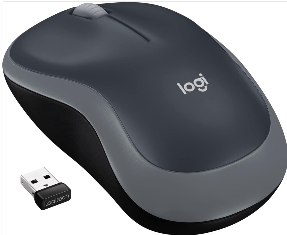
Image: The Logitech M185 Wireless Mouse in Swift Gray, shown alongside its compact USB mini receiver.

The Logitech M185 Wireless Mouse is a simple, reliable, and compact peripheral designed for comfortable and efficient navigation. Featuring plug-and-play wireless connectivity, a long-lasting battery, and precise optical tracking, it is an ideal choice for everyday computing tasks. This manual provides comprehensive instructions for setting up, operating, maintaining, and troubleshooting your M185 mouse.