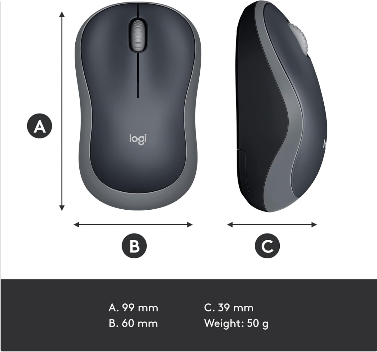
Image: Technical drawing illustrating the dimensions (length, width, height) and weight of the Logitech M185 Wireless Mouse.