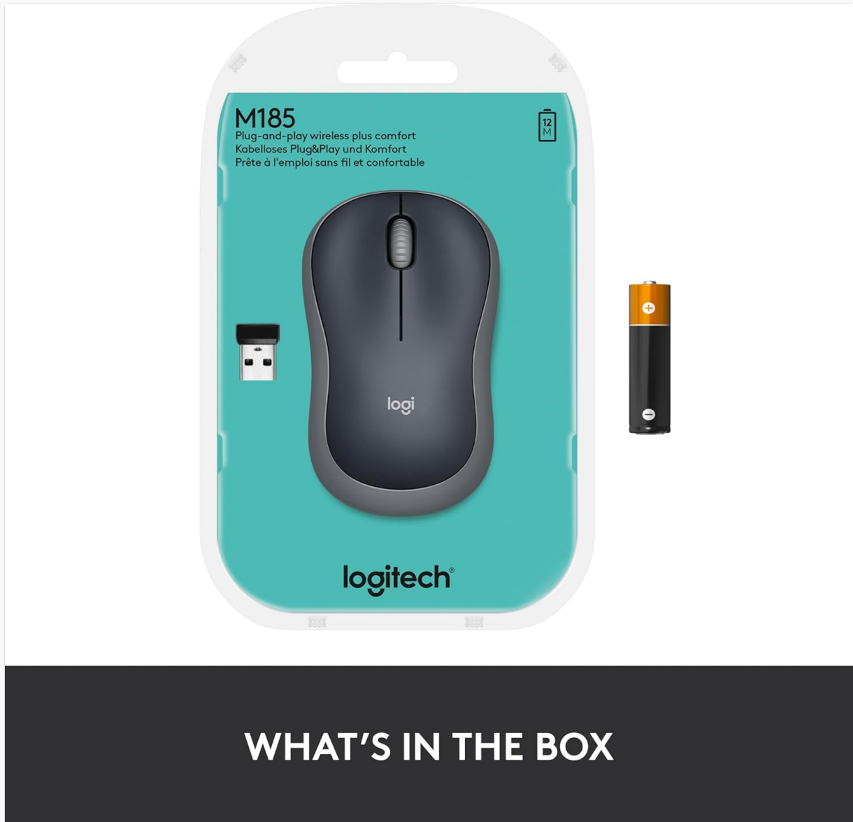
Image: Contents of the Logitech M185 retail package, including the mouse, USB receiver, and an AA battery.