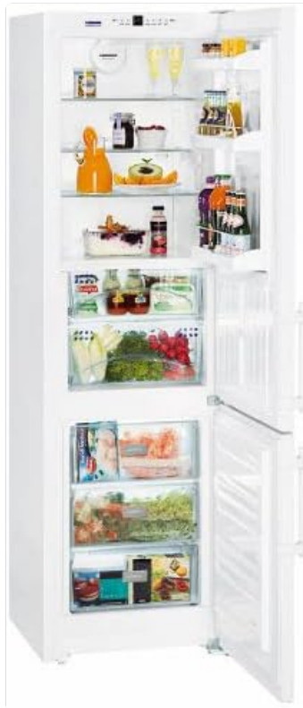
Figure 4.3: The interior of the Liebherr CBP 4013 refrigerator and freezer compartments, shown filled with various food items. This illustrates the practical storage capacity and organization possibilities within the appliance.

To prevent accidental changes to settings, your appliance is equipped with a child lock. Refer to the full manual for specific instructions on how to activate and deactivate this feature using the control panel.