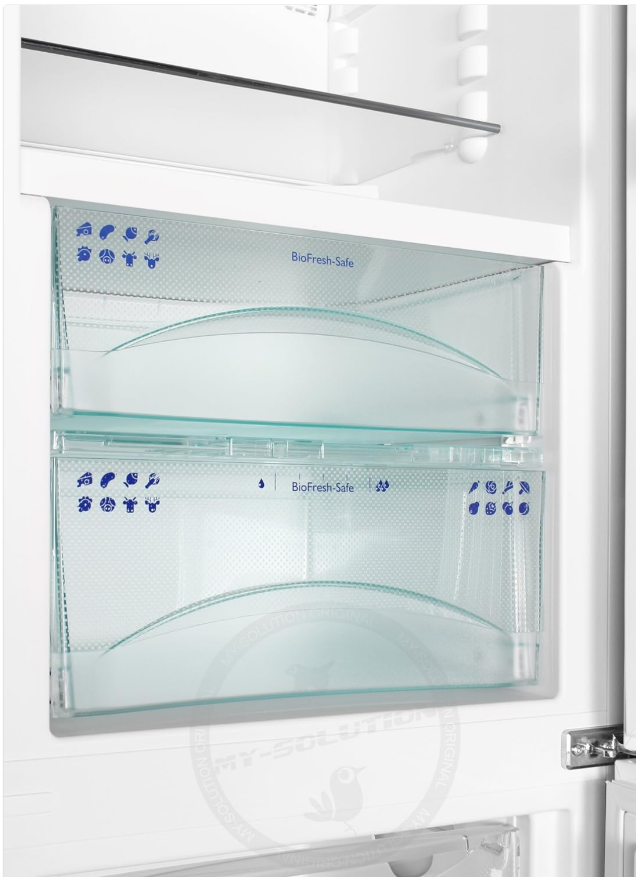
Figure 4.2: A close-up view of the two BioFresh-Safe drawers within the Liebherr refrigerator. These transparent drawers are designed to maintain optimal humidity and temperature for extended freshness of produce and other sensitive foods.