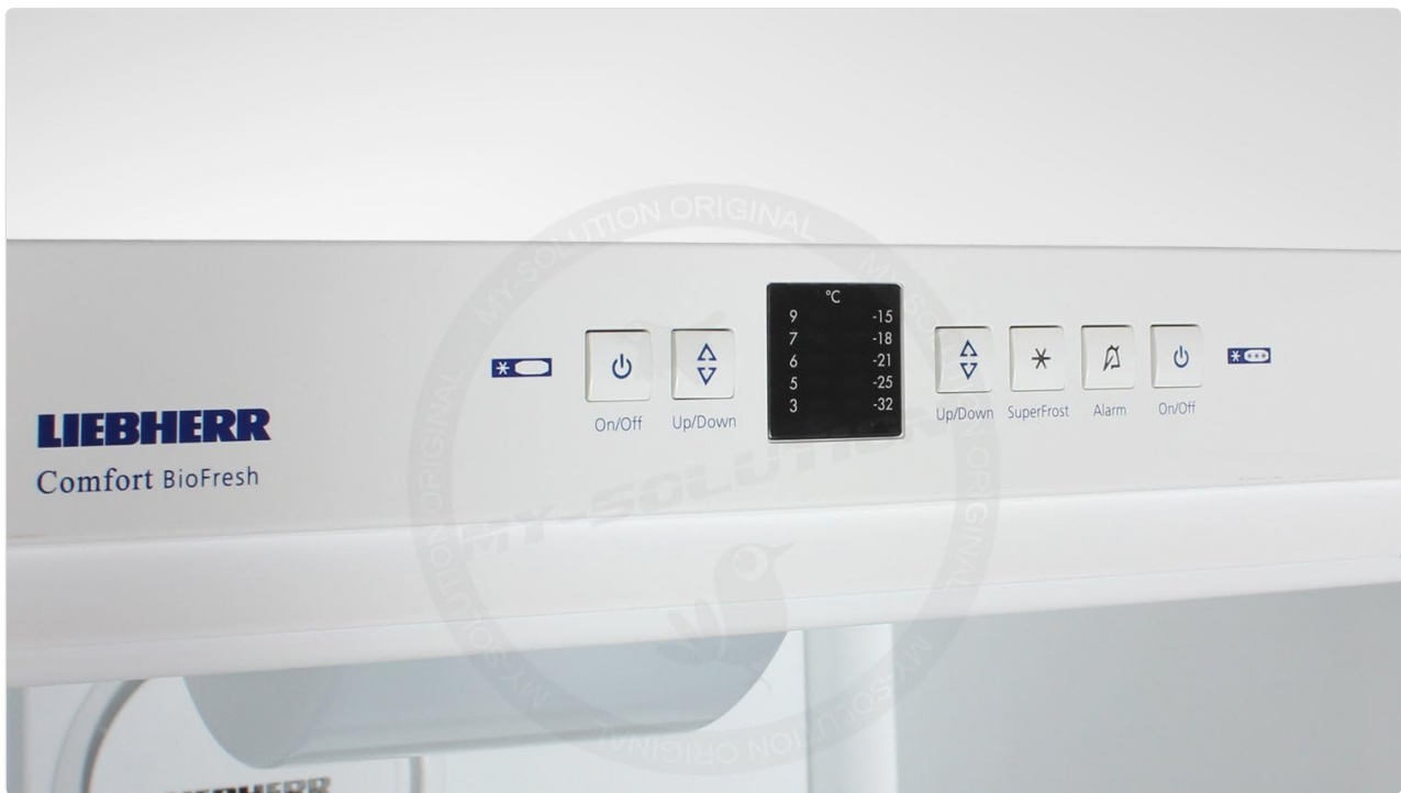
Figure 4.1: A close-up view of the Liebherr CBP 4013 control panel, showing buttons for On/Off, temperature adjustment (Up/Down), SuperFrost, and Alarm. The digital display shows the current temperature settings.