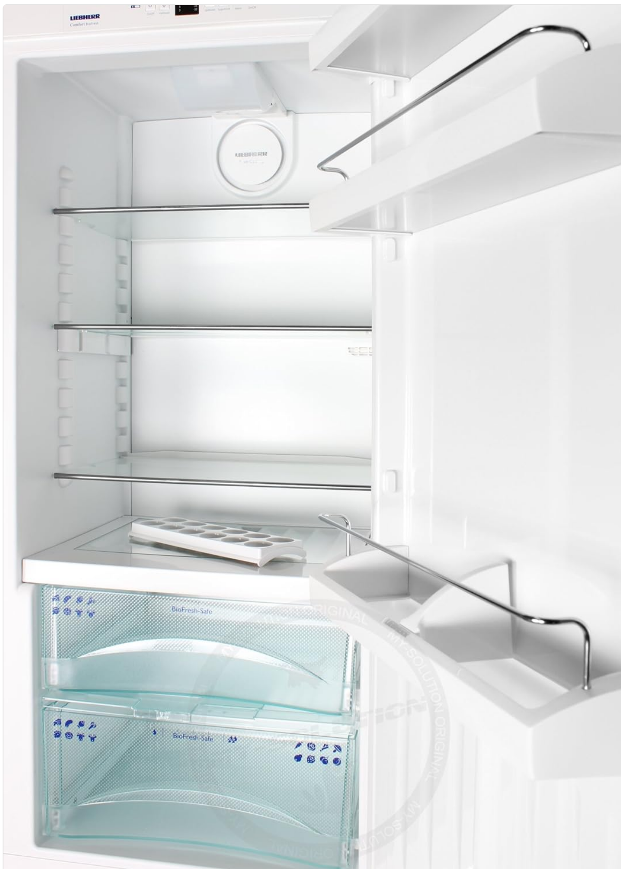
Figure 5.1: The upper interior of the Liebherr refrigerator, showing the empty glass shelves and the back wall. This view is useful for demonstrating how to clean the interior and adjust shelf positions.