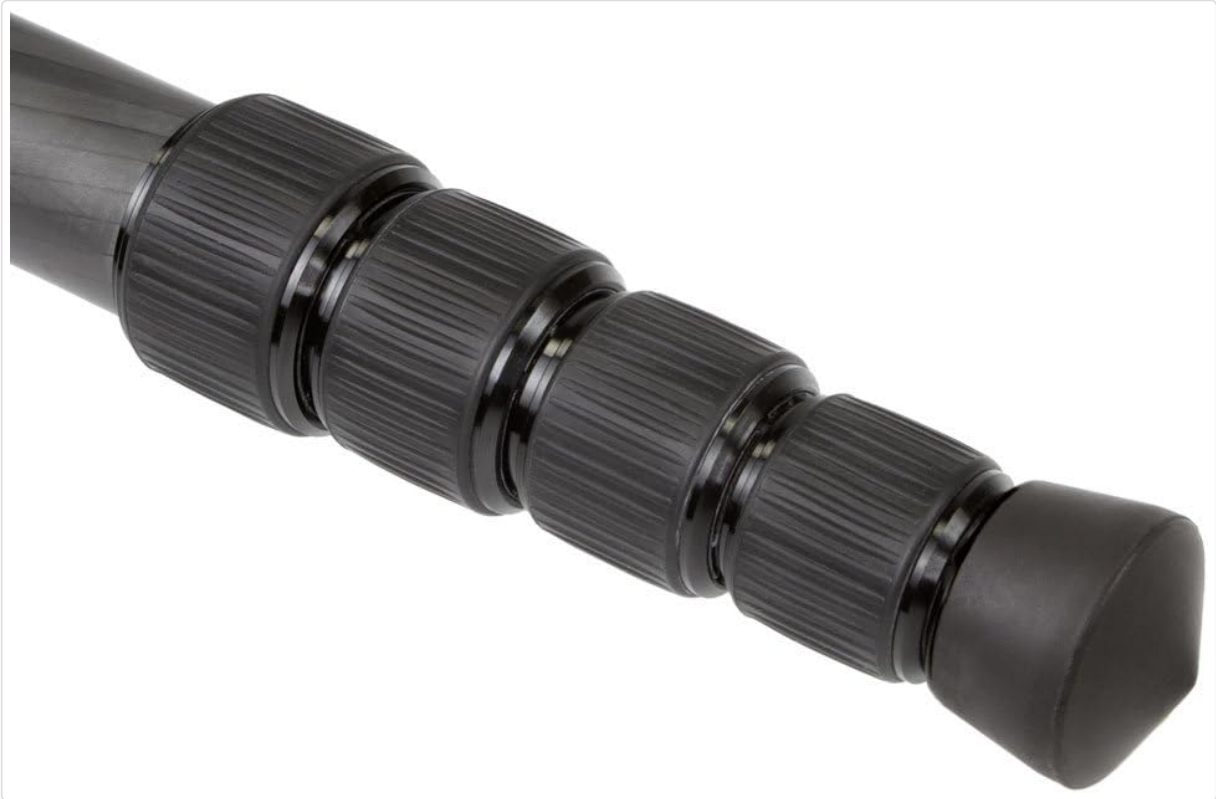
Image: A close-up view of the SIRUI T-1205X tripod leg sections, highlighting the textured silicon twist locks used for extending and retracting the legs.

The tripod features 5 leg sections. To adjust the length of each section, twist the silicon locks counter-clockwise to loosen, extend or retract the section, and then twist clockwise to tighten. Always ensure all sections are securely locked before placing equipment on the tripod.