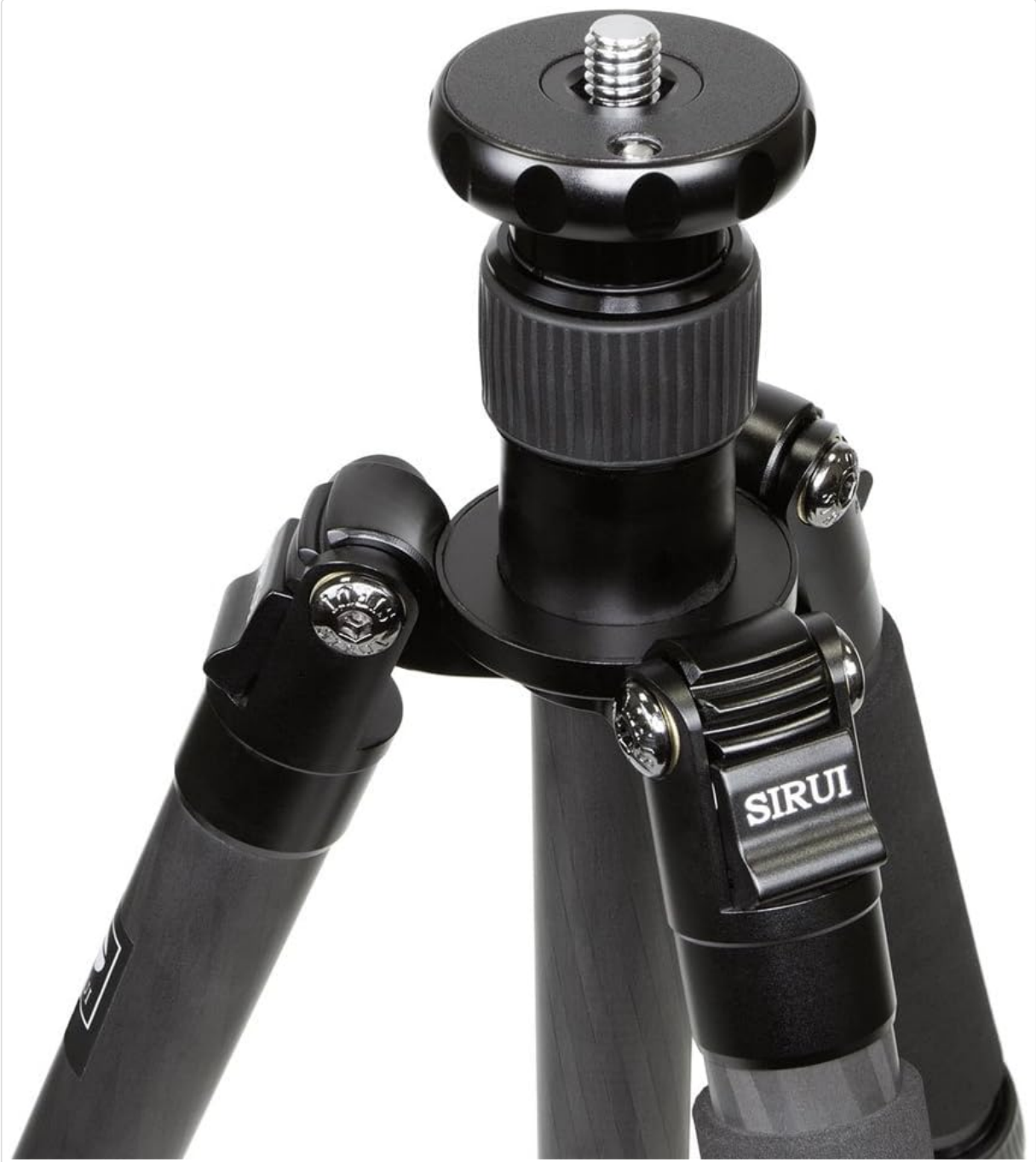
Image: The SIRUI T-1205X tripod with its legs extended, showing the central column and the mounting plate for a ball head. The carbon fiber leg sections are visible.