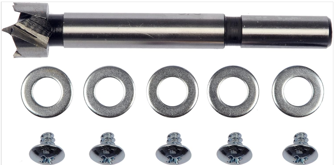
Image: Close-up view of the installation hardware, including the specialized drill bit, washers, and screws provided with the Dorman 80369 kit.