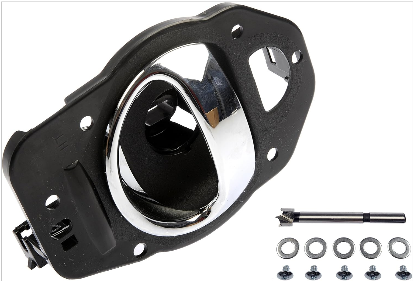
Image: The Dorman 80369 interior door handle assembly shown with the included installation hardware, which consists of a drill bit, several washers, and screws.