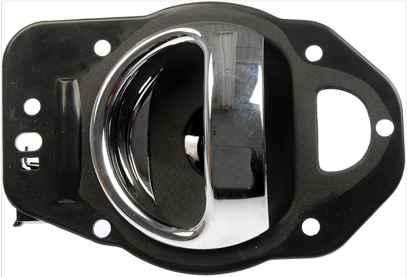
Image: Front view of the Dorman 80369 interior door handle, showcasing the black housing and chrome lever.