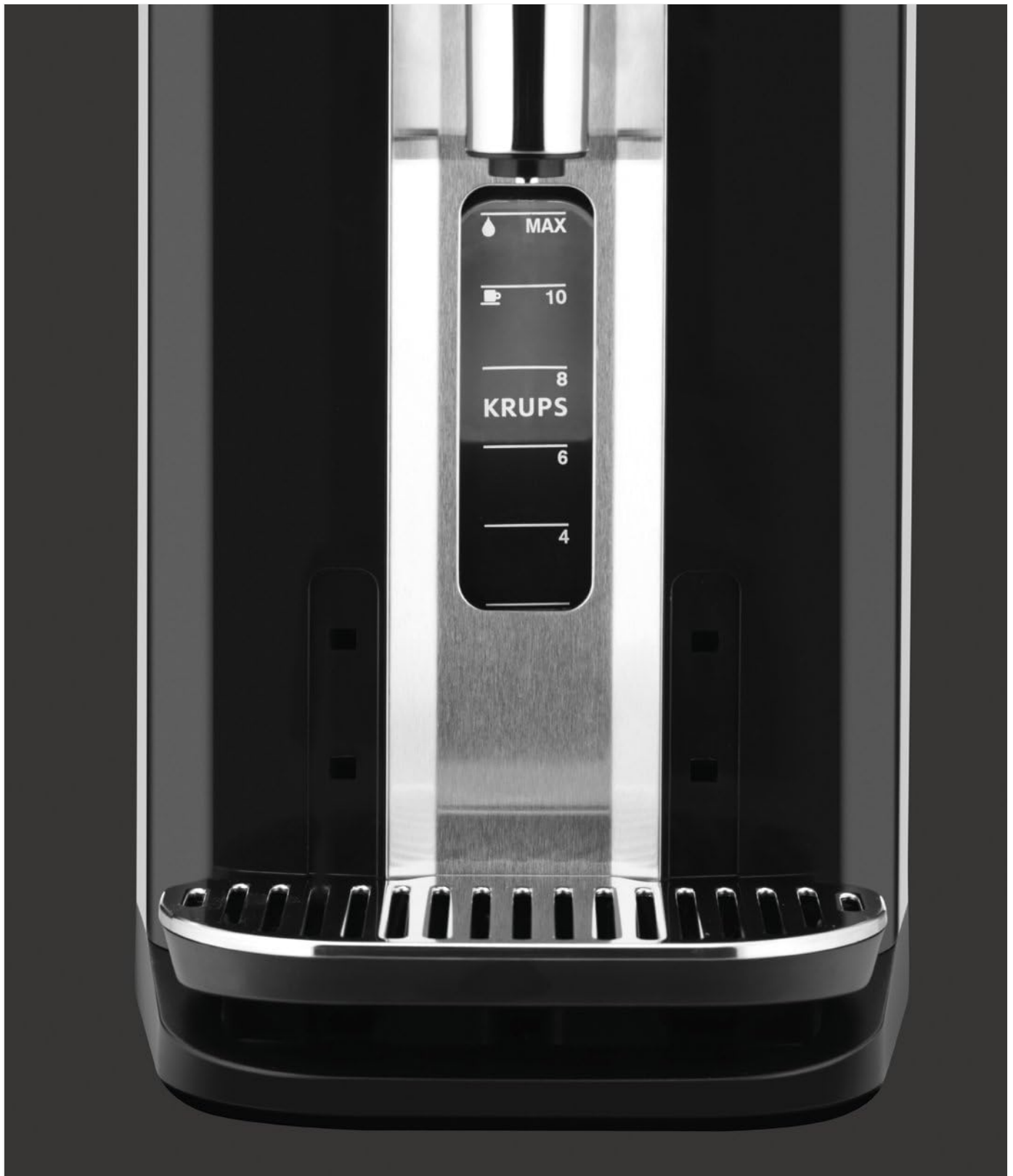
Figure 3: Close-up of the water level indicator on the KRUPS KM9008, showing markings for cup measurements.