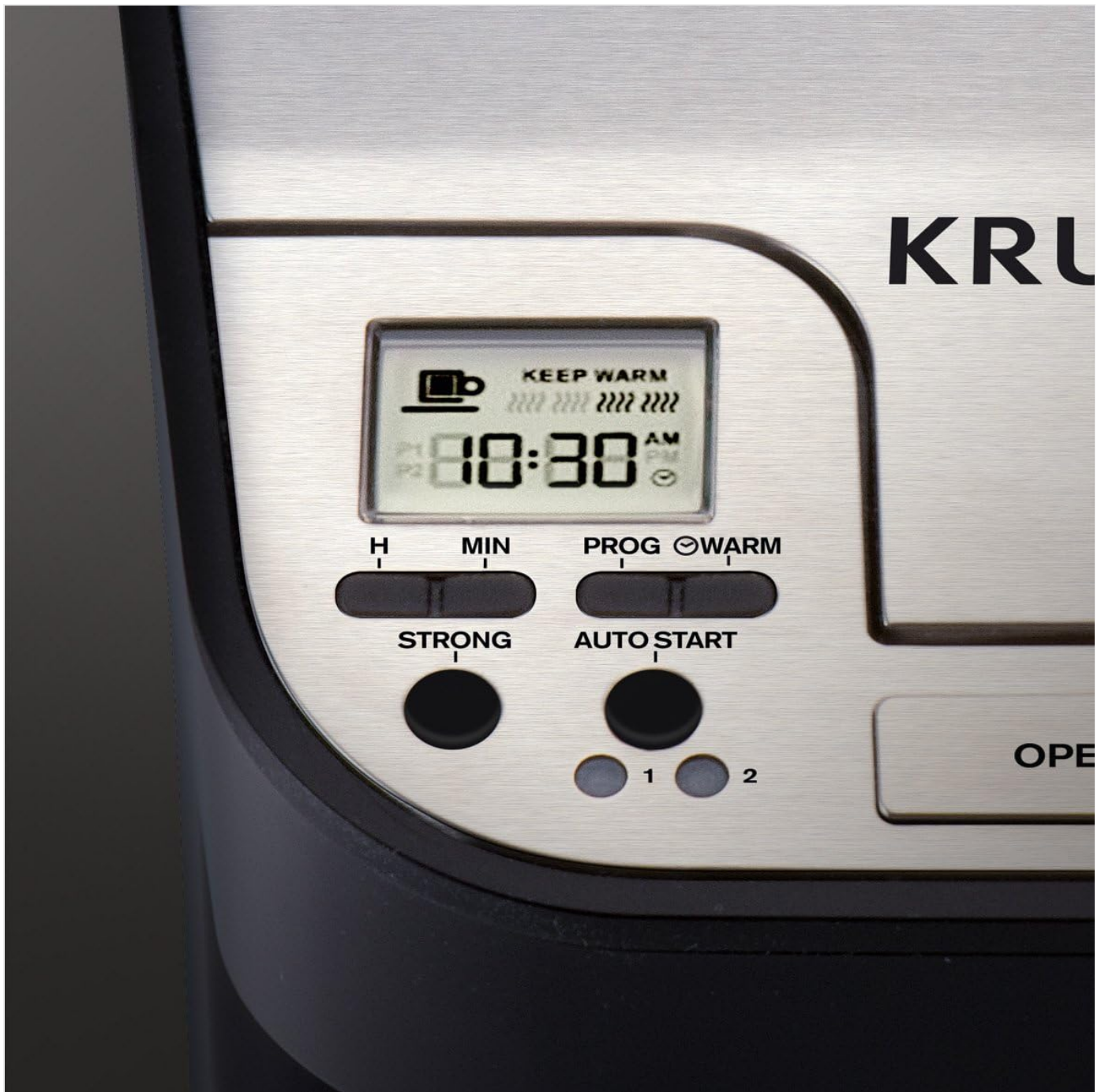
Figure 4: Close-up of the KRUPS KM9008 control panel, showing the digital display for time, keep warm status, and programming buttons.