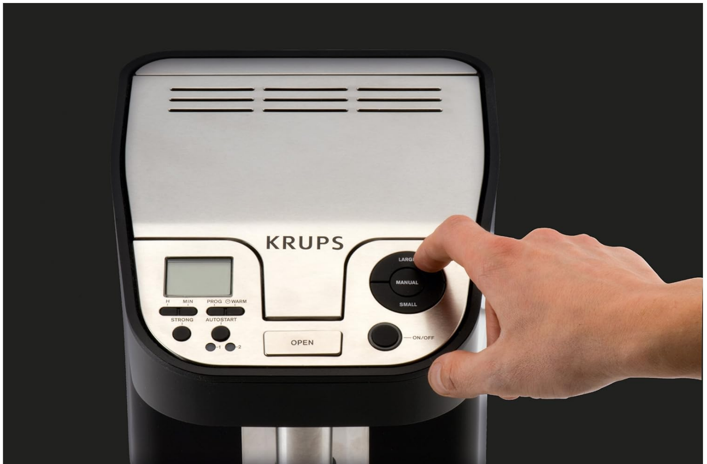
Figure 5: A hand pressing the dispensing button on the KRUPS KM9008 coffee maker, demonstrating the on-demand dispensing feature.