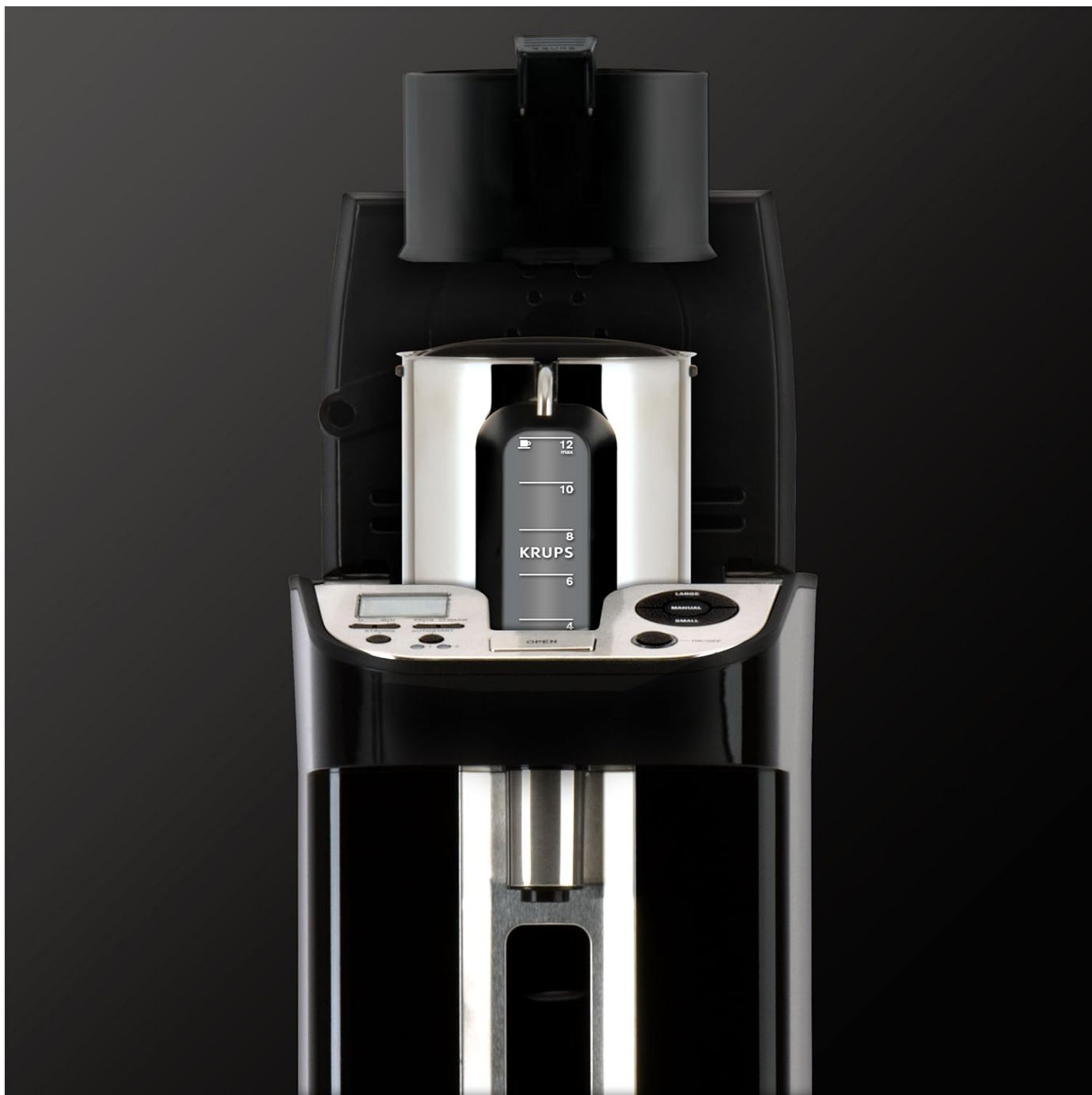
Figure 2: Top view of the KRUPS KM9008 coffee maker with the lid open, revealing the removable stainless steel water tank and filter basket area.