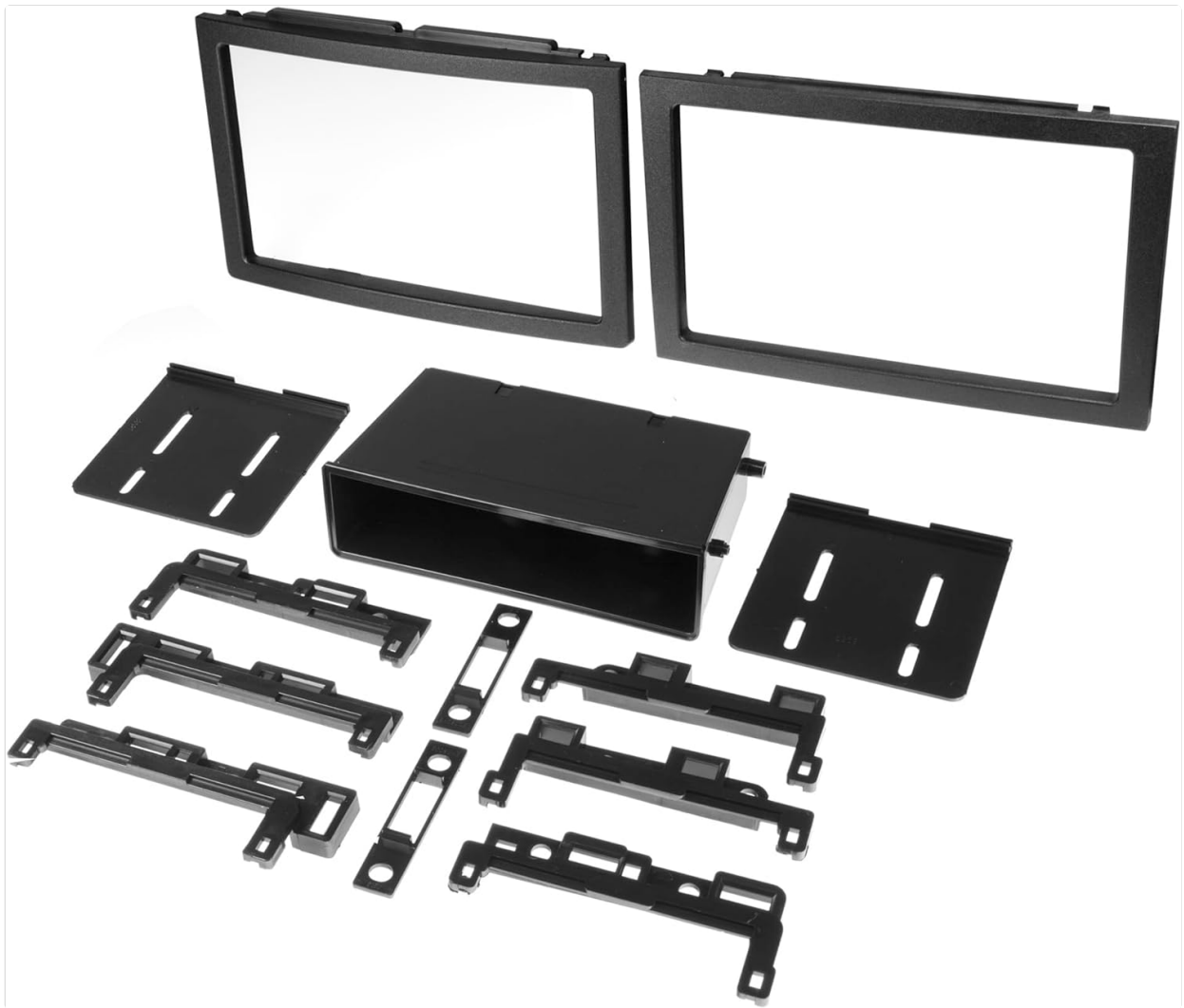
Image 2.1: All components included in the Scosche GM2500B Dash Kit.