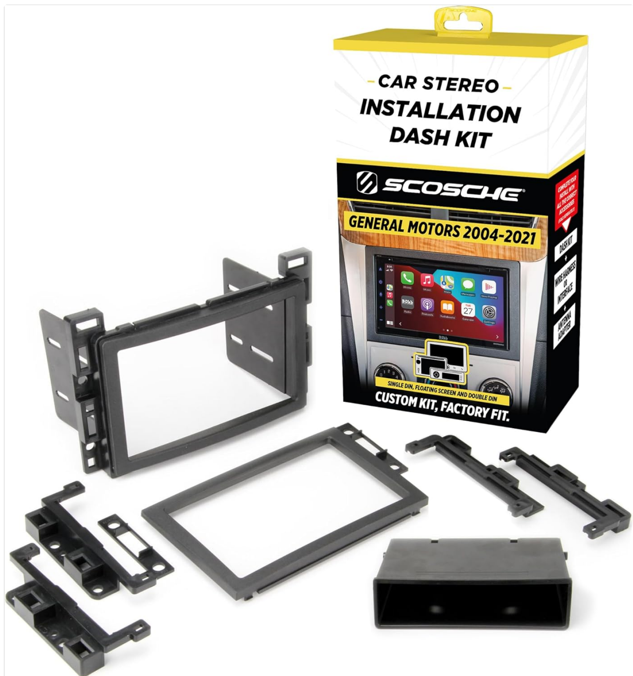
Image 1.1: Scosche GM2500B Dash Kit components and retail packaging.