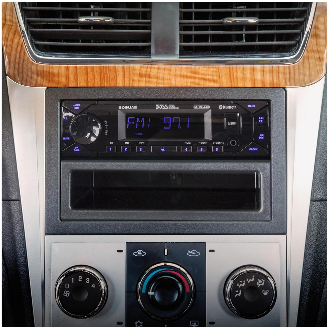
Image 4.2: Example of a Single DIN radio with storage pocket installed with the kit.