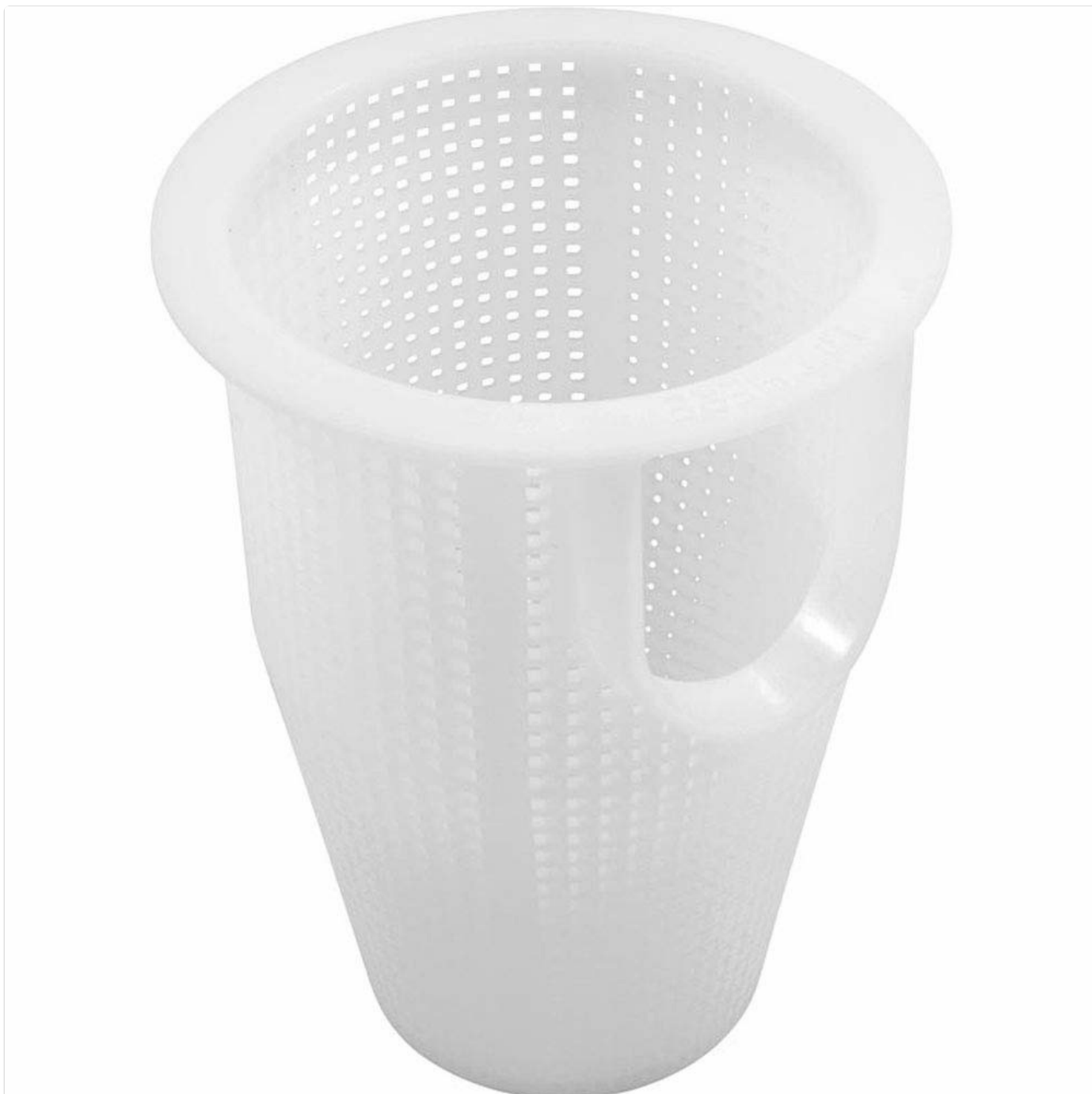
Figure 1: Front view of the Pentair 070387 Strainer Basket. This image shows the overall shape and perforated design of the basket.