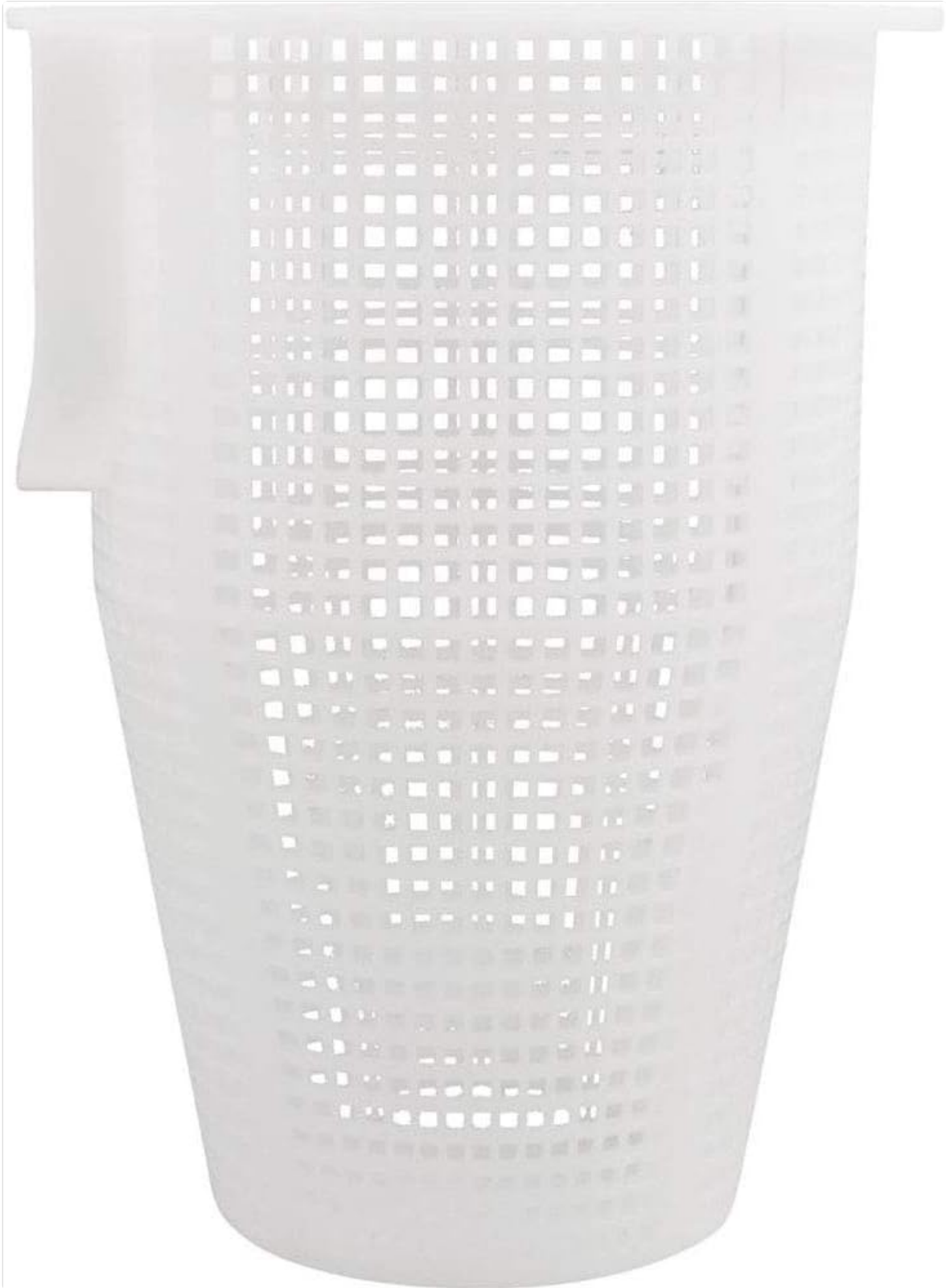
Figure 2: Side view of the strainer basket, highlighting the integrated handle for easy removal and installation.