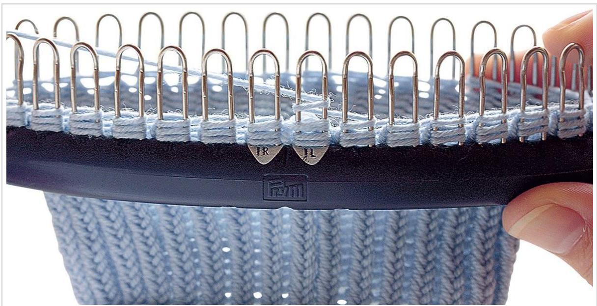
Image: A light blue knitted sock is shown partially completed on the loom, illustrating the progress of a project.

Once your project reaches the desired length, follow the casting off instructions in your booklet to remove the stitches from the loom and secure the edge. This typically involves transferring loops and binding them off to create a finished edge.