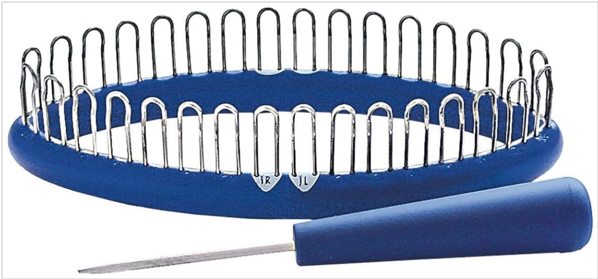
Image: The Prym Large Knitting Loom in dark violet, shown with its accompanying blue cast-off needle.