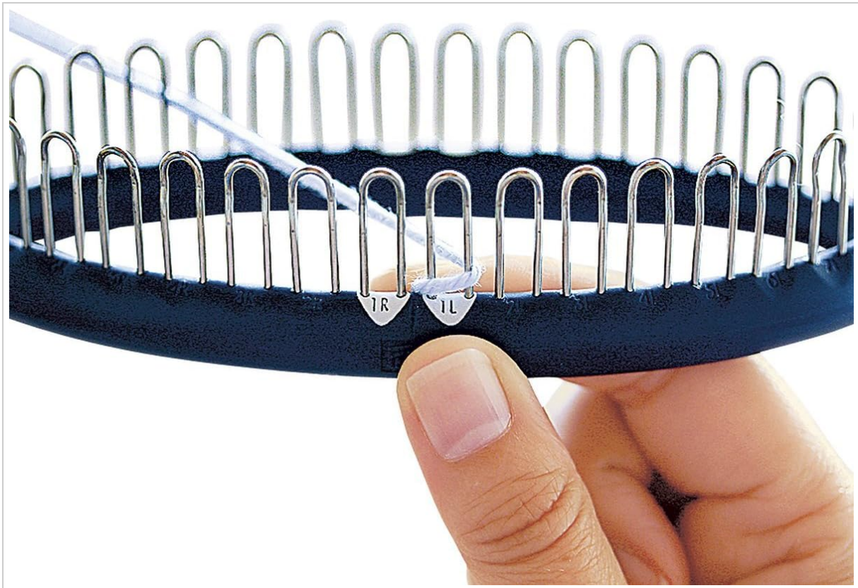
Image: A hand demonstrates the initial wrapping of yarn around the pegs of the knitting loom to cast on stitches.