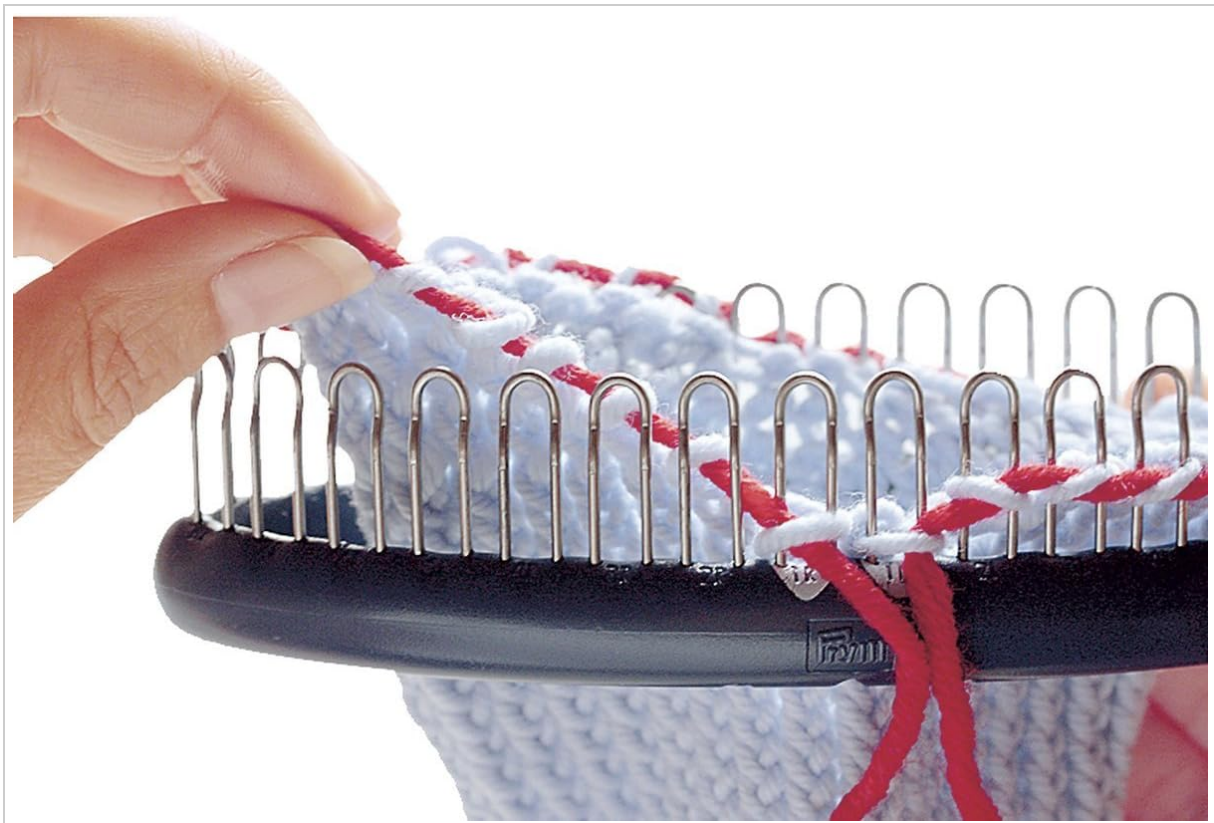
Image: Close-up of a hand using the cast-off needle to lift a yarn loop over a peg, forming a knit stitch.

Once the pegs have the required number of yarn loops, use the cast-off needle. Insert the hook under the bottom loop on a peg, catch the working yarn, and lift the bottom loop over the top loop and off the peg. This completes one stitch.