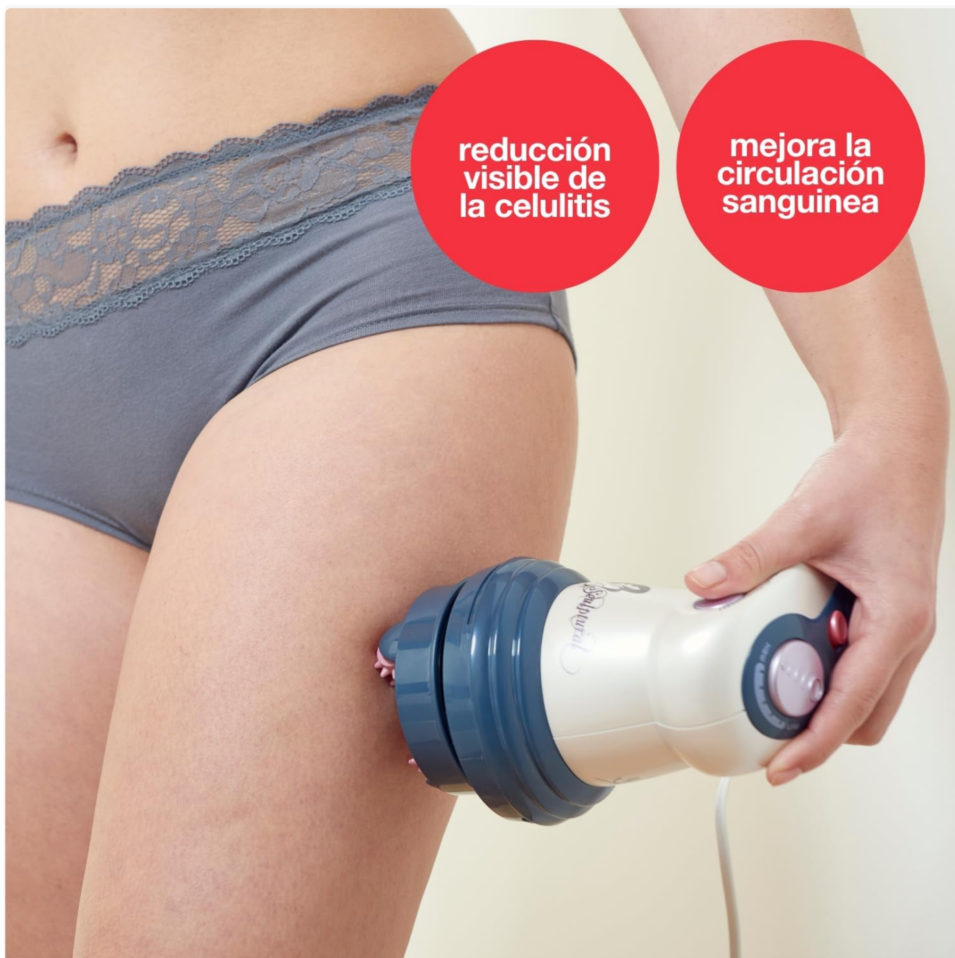
Figure 6: Potential benefits of consistent use.