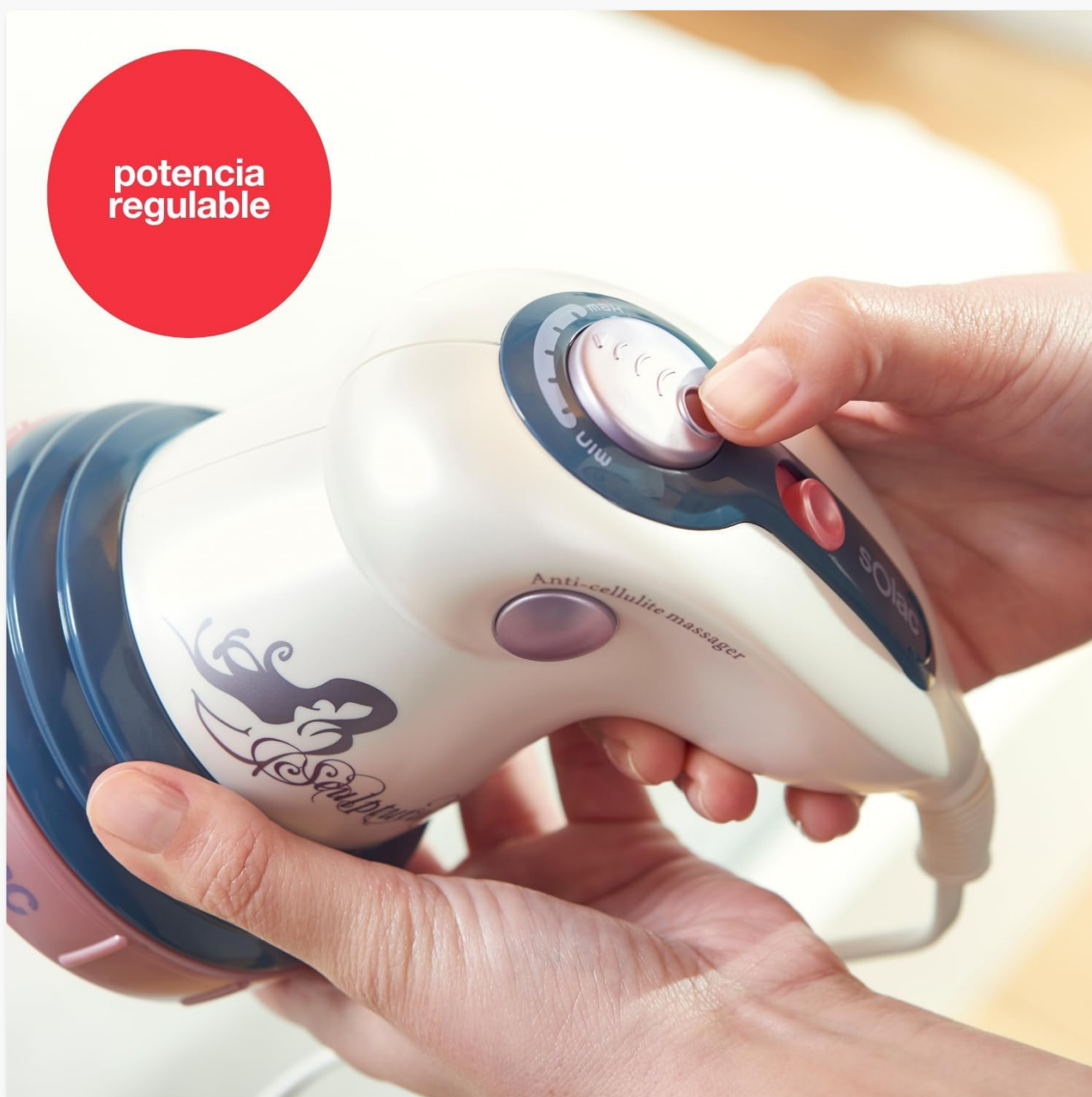
Figure 2: Adjusting the power setting on the device.