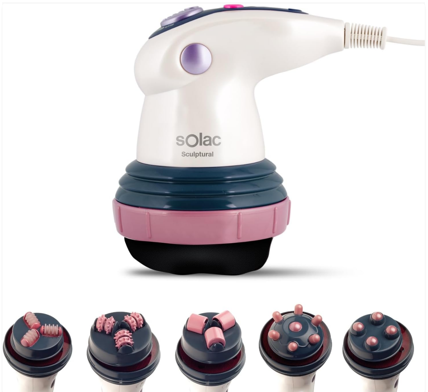
Figure 1: Solac ME7711 Sculptural device with its interchangeable treatment heads.

The system includes 6 interchangeable heads for different skin and muscle actions across various body zones, enhancing the penetration of anti-cellulite creams.