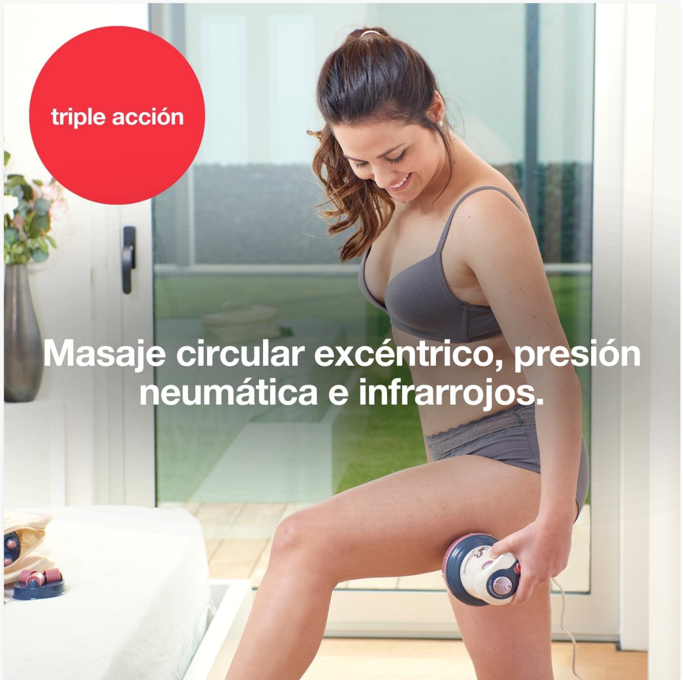
Figure 3: Demonstrating the circular eccentric massage technique.