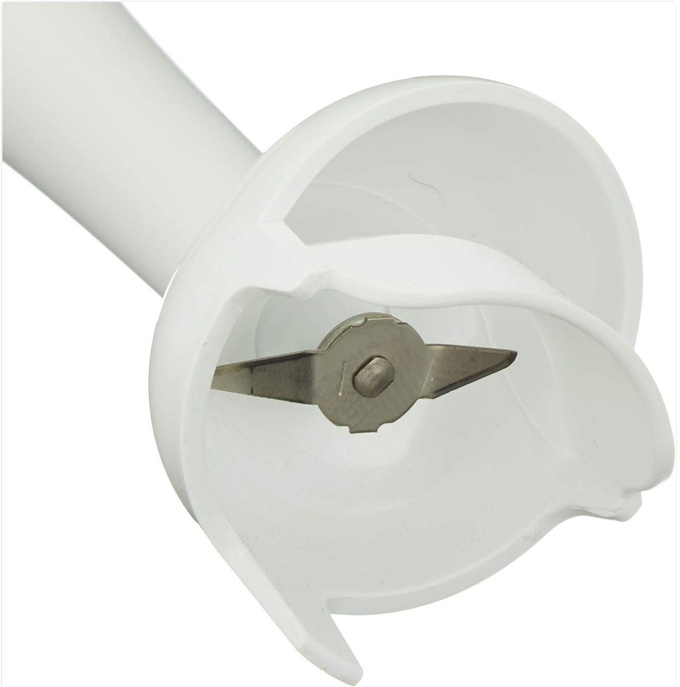
Figure 3: A detailed view of the blending blade at the bottom of the Moulinex A65B17 Mixer Stand.