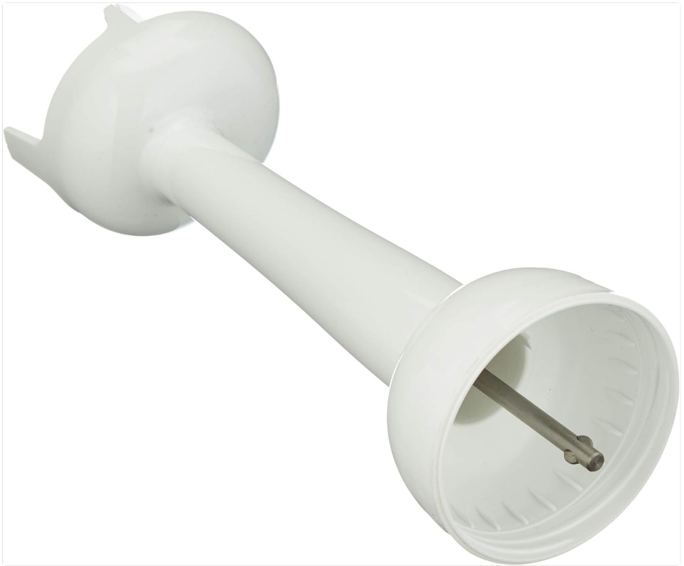
Figure 2: The Moulinex A65B17 Mixer Stand, illustrating the upper part that connects to the hand mixer motor unit.