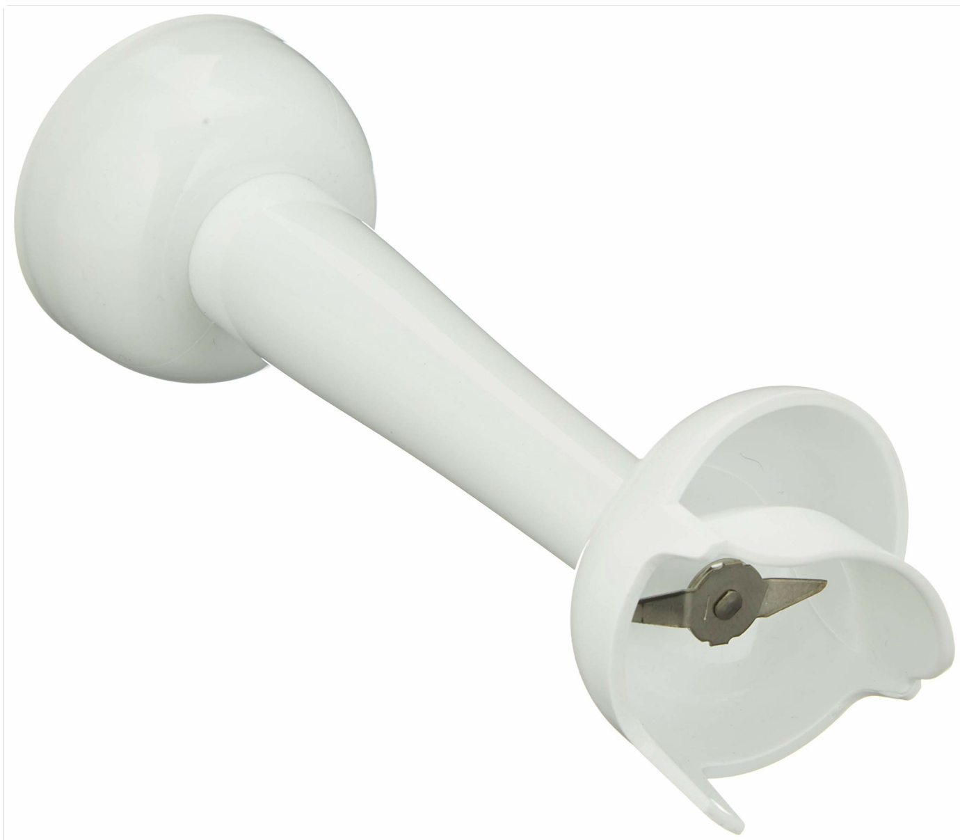
Figure 1: Moulinex A65B17 Mixer Stand. This image shows the complete white plastic blending attachment.