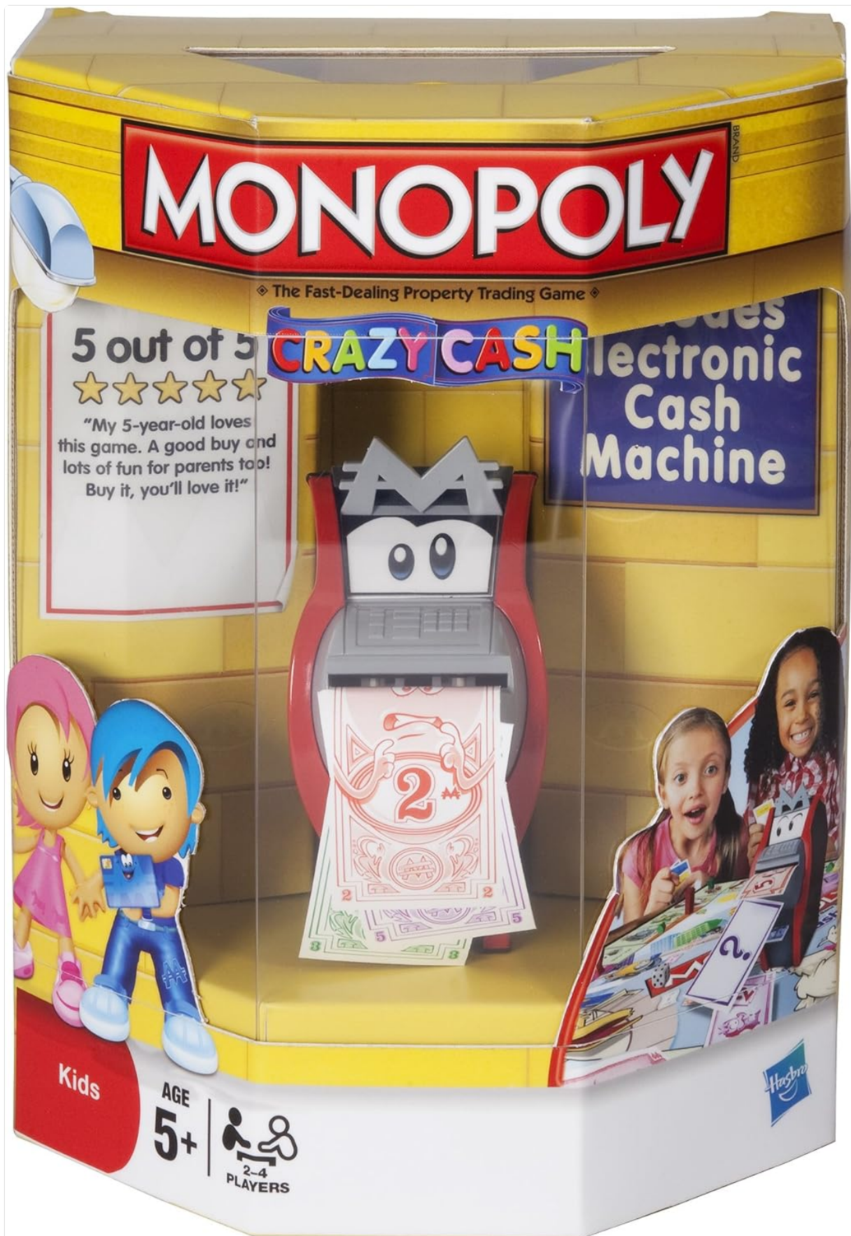
A detailed view of the electronic cash machine, central to the Monopoly Crazy Cash game, illustrating its design and the slot where money is dispensed.