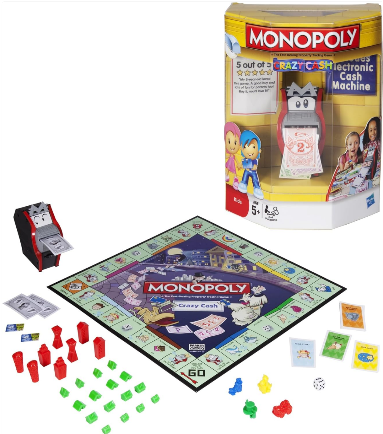
The Monopoly Crazy Cash game box, prominently displaying the electronic cash machine and a glimpse of the game board, highlighting the interactive nature of this edition.