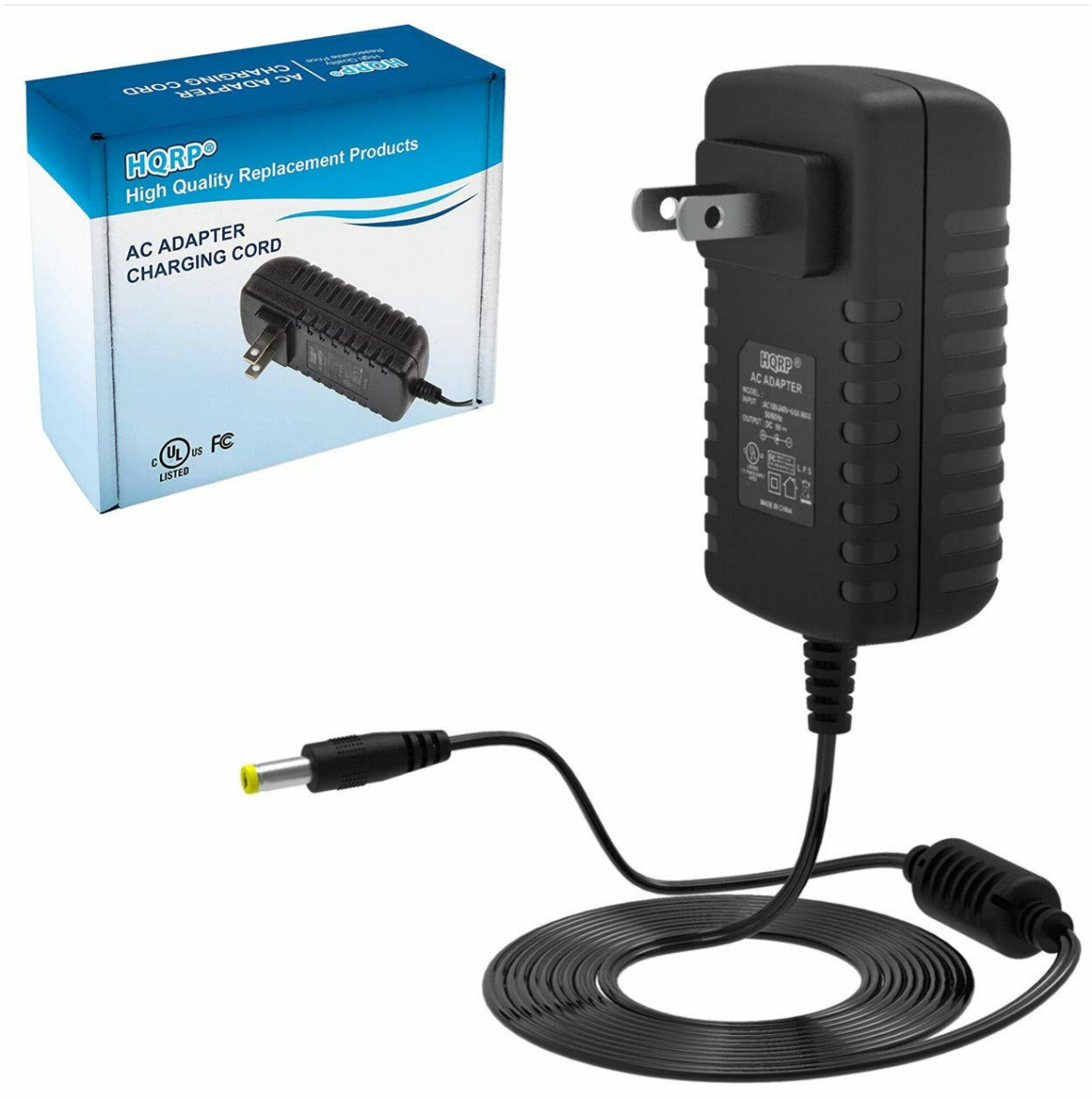
Image of the HQRP AC Adapter/Power Supply packaging, showing the adapter and the 'UL Listed' certification mark.