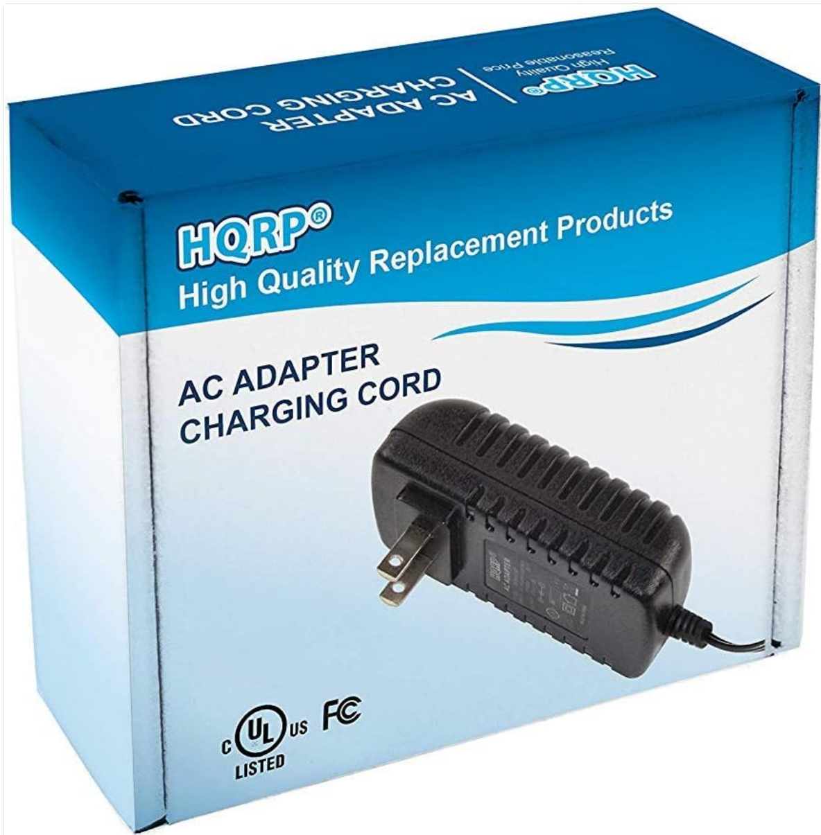
Image of the HQRP AC Adapter/Power Supply, highlighting the UL Listed certification mark on the adapter body.