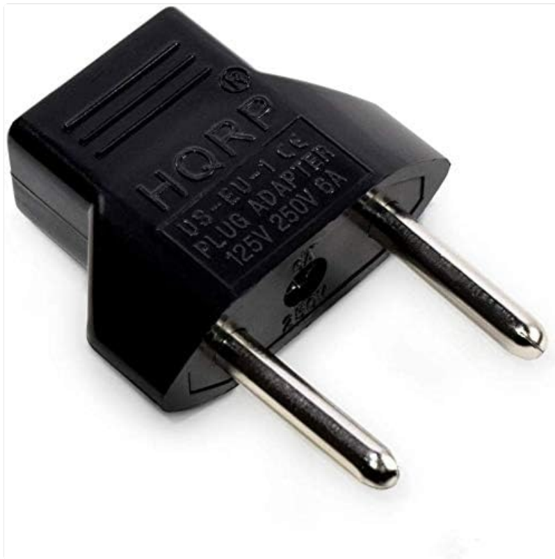
Image of the included HQRP Euro Plug Adapter, designed for use in European outlets.