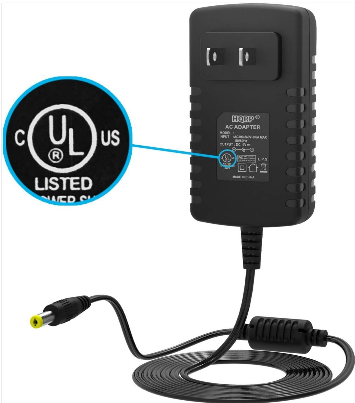
Close-up image of the UL Listed certification mark on the HQRP AC Adapter/Power Supply, indicating safety compliance.