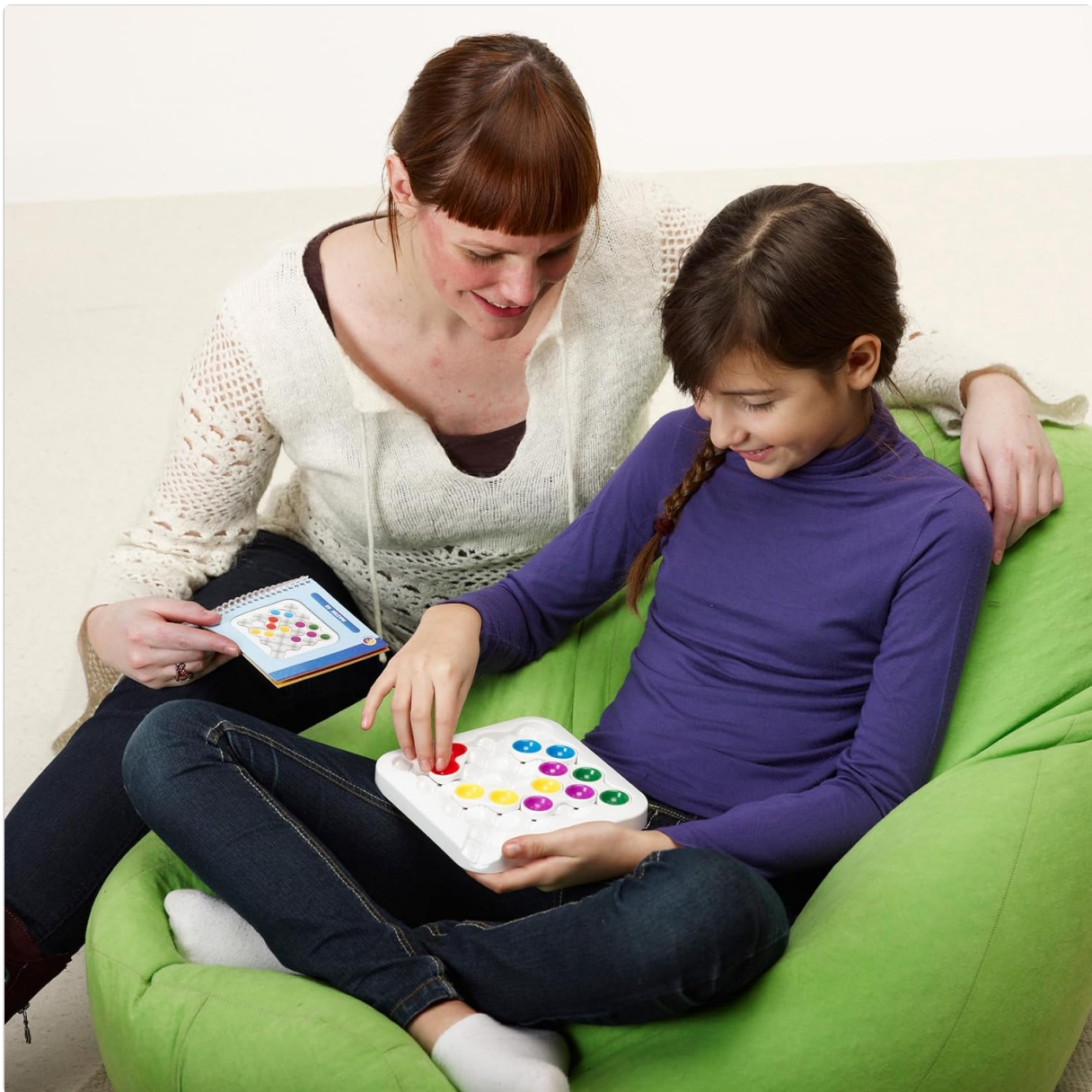
Image: A player consulting the challenge booklet while playing SmartGames Anti-Virus.