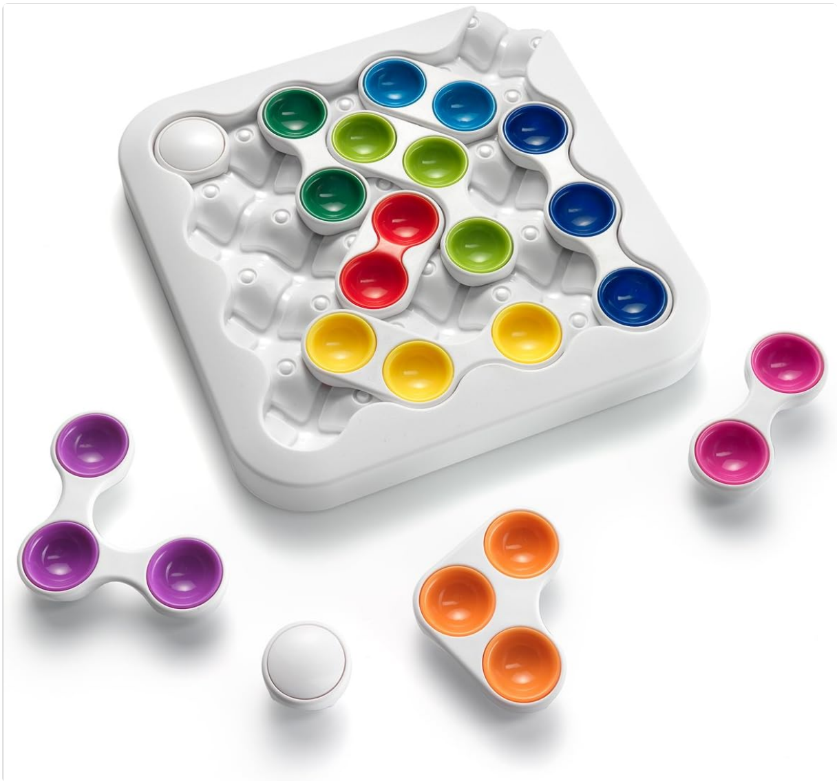
Image: The SmartGames Anti-Virus game board during play, with pieces positioned to demonstrate possible diagonal movements.