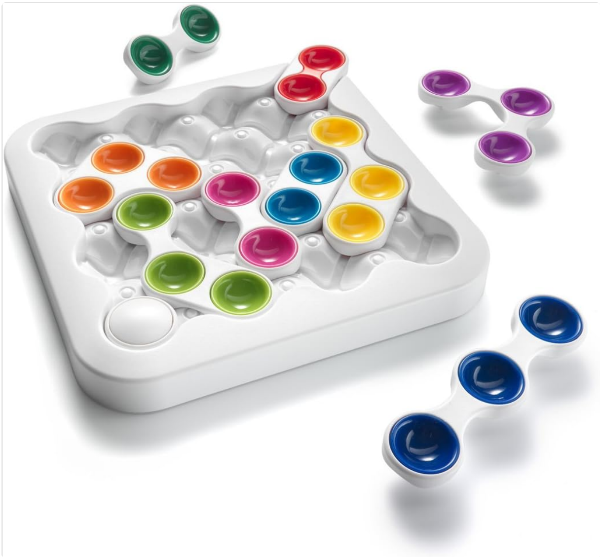
Image: A SmartGames Anti-Virus game board with pieces set up for a challenge, demonstrating the initial configuration.