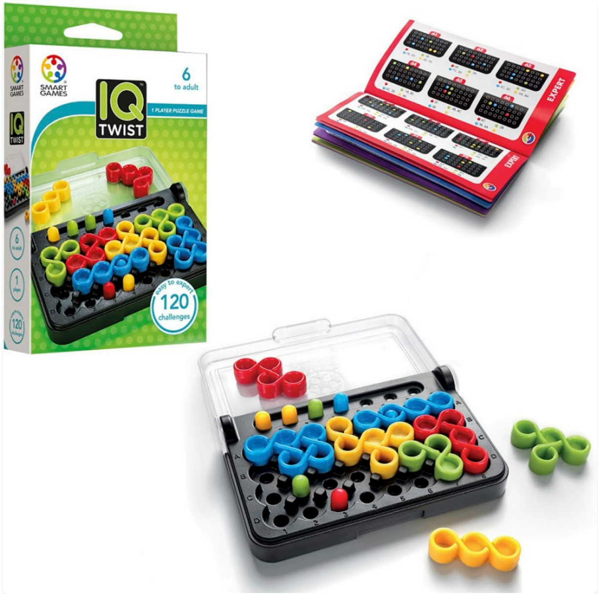
Image: The SmartGames IQ Twist game board, showcasing the colorful twisted puzzle pieces and pegs.