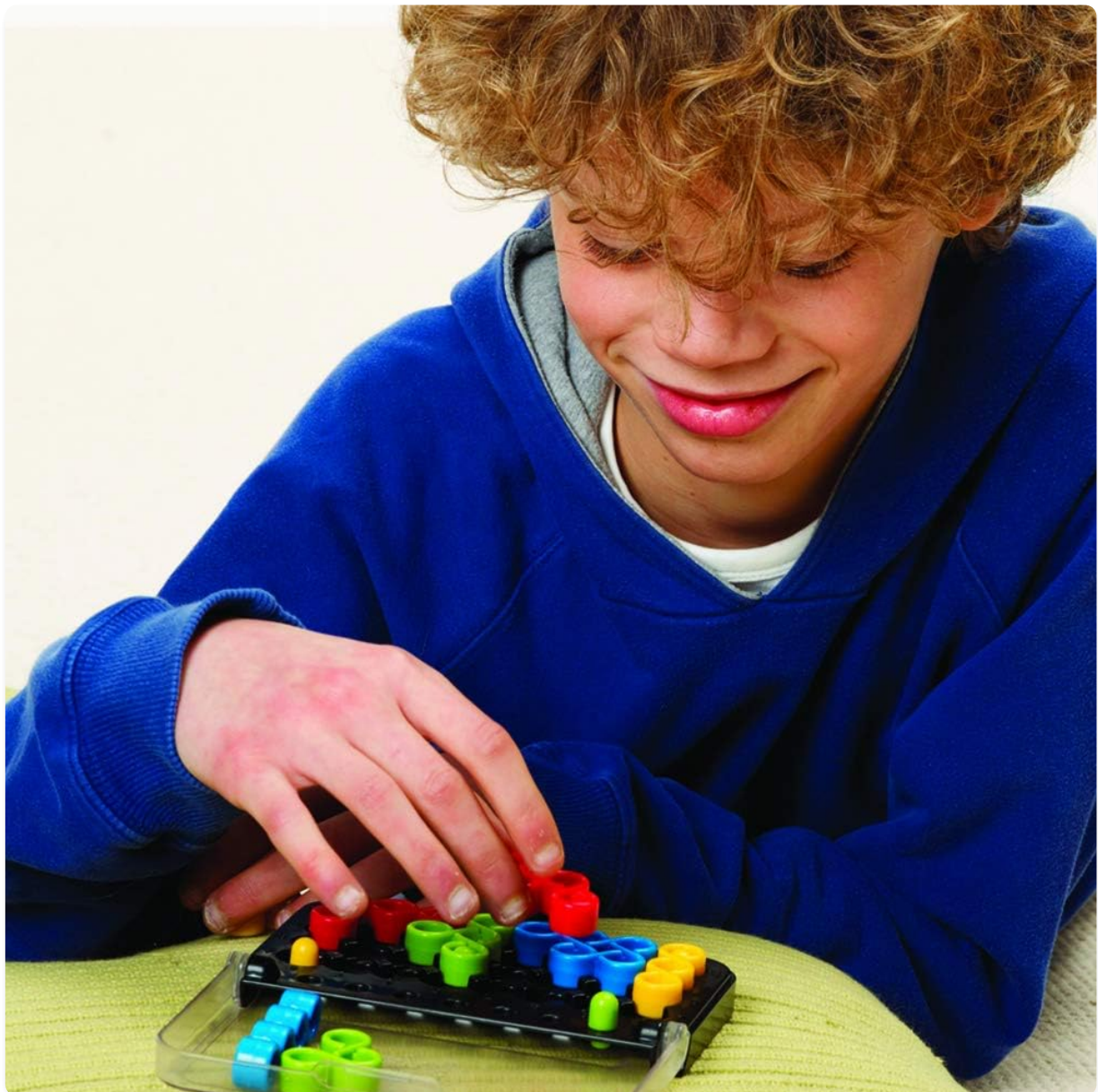
Image: A child engaged in playing the IQ Twist game, demonstrating concentration.

Its compact size makes it an excellent travel-friendly educational toy, perfect for on-the-go brain fun.