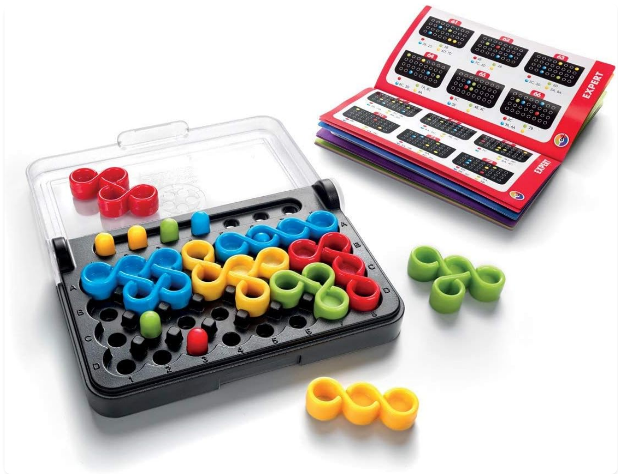
Image: All components of the IQ Twist game, including the game board, various twisted pieces, colored pegs, and the challenge booklet.