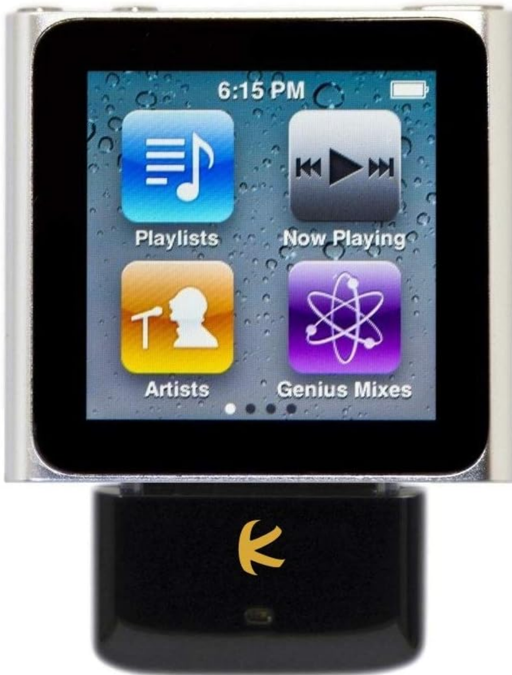
Another view of the KOKKIA i10s attached to an iPod Nano, showcasing its low-profile design when connected.