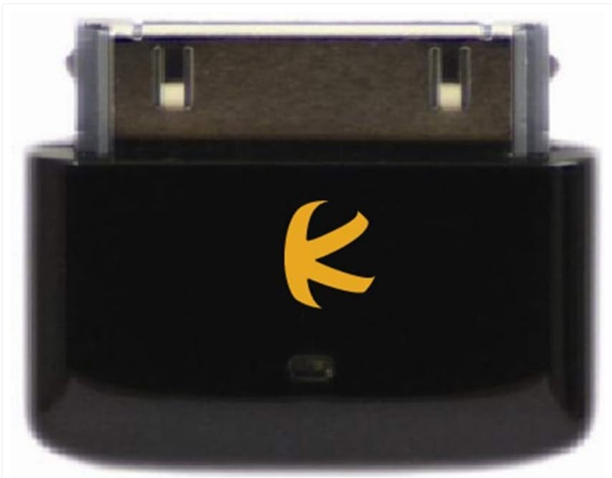
Front view of the KOKKIA i10s Bluetooth iPod Transmitter, a small black device with a 30-pin connector and a KOKKIA logo.