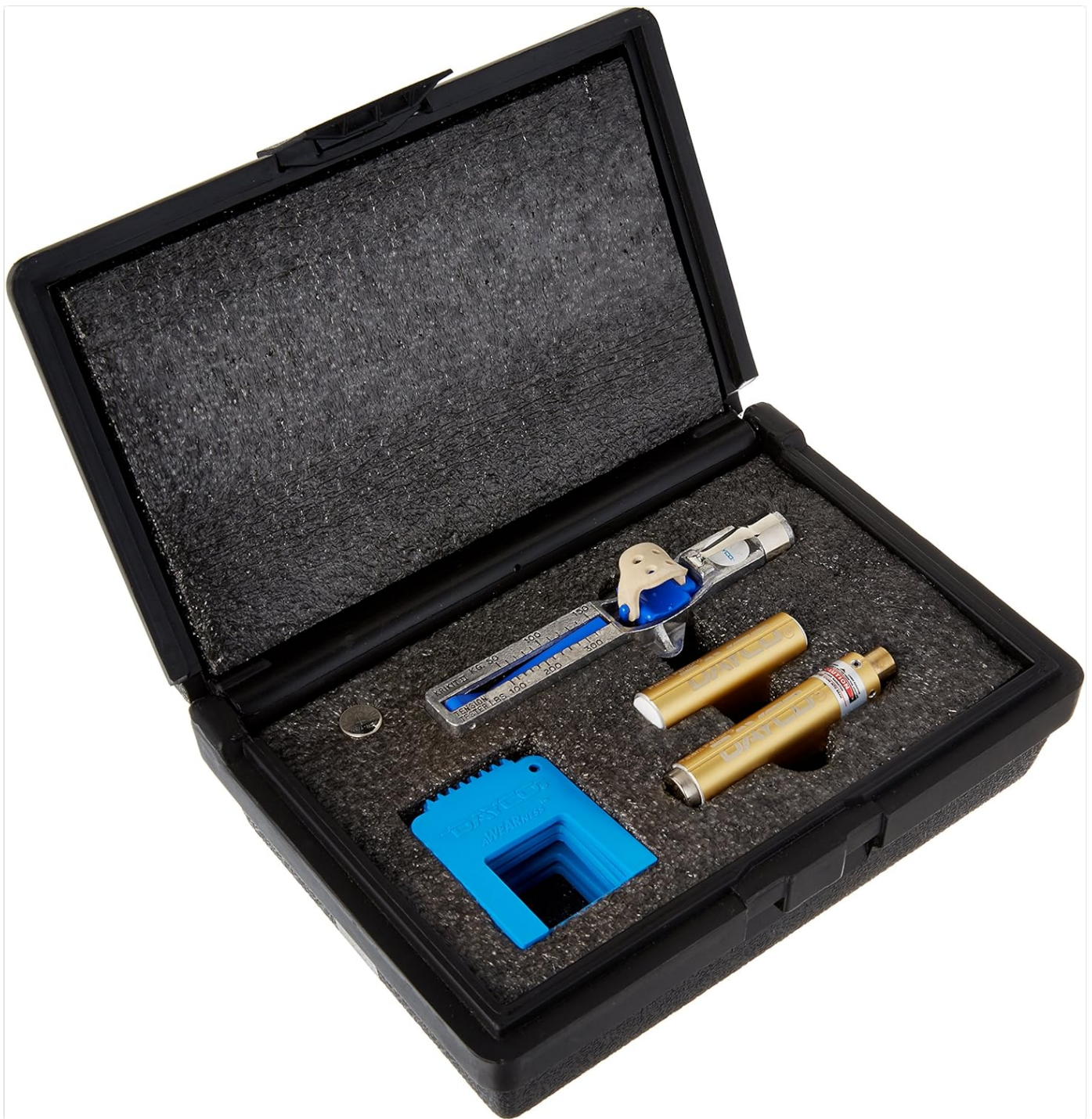
Image: The Dayco 93874 Timing Belt Diagnostic Kit neatly stored within its protective plastic case, showing the custom foam inserts.