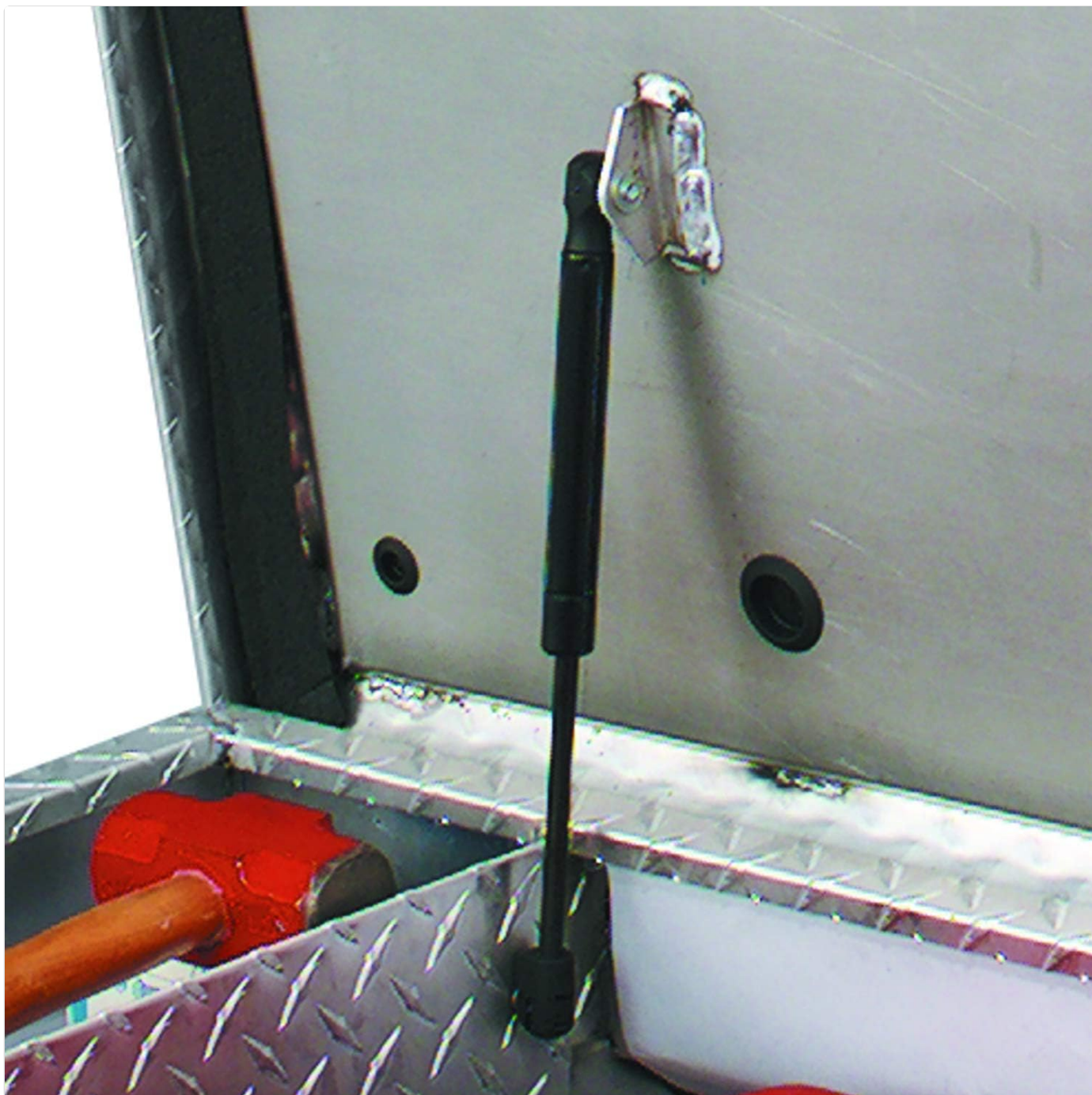
Figure 4: The gas strut assists in holding the lid open for easy access.