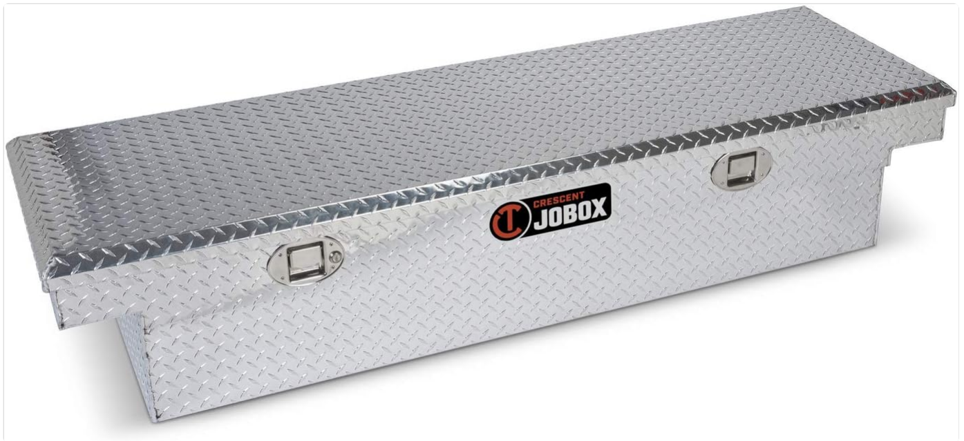
Figure 1: Overall view of the Delta JOBOX Crescent JOBOX Gear-Lock Truck Box.