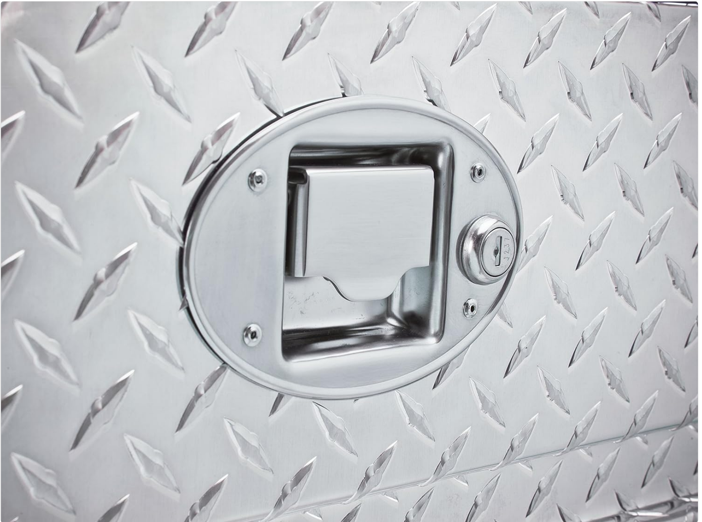
Figure 2: Detail of the paddle handle and lock mechanism. Ensure this operates smoothly after installation.