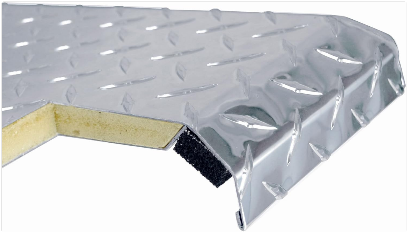
Figure 6: The RSL Rigid Structural Lid is designed for durability; inspect it regularly for damage.