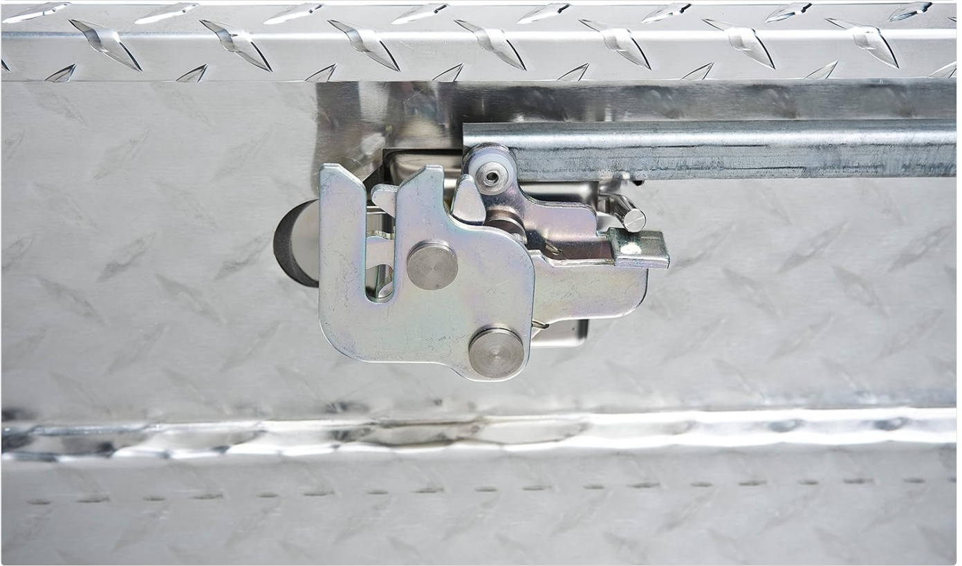
Figure 3: View of the self-aligning hoop lid striker, critical for secure lid closure.