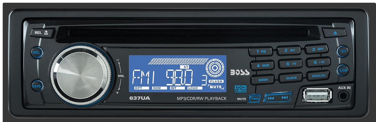
Image: Front view of the 637UA receiver. This image highlights the display, control knob, and various buttons for operation.

This section covers the basic operation of your 637UA receiver.