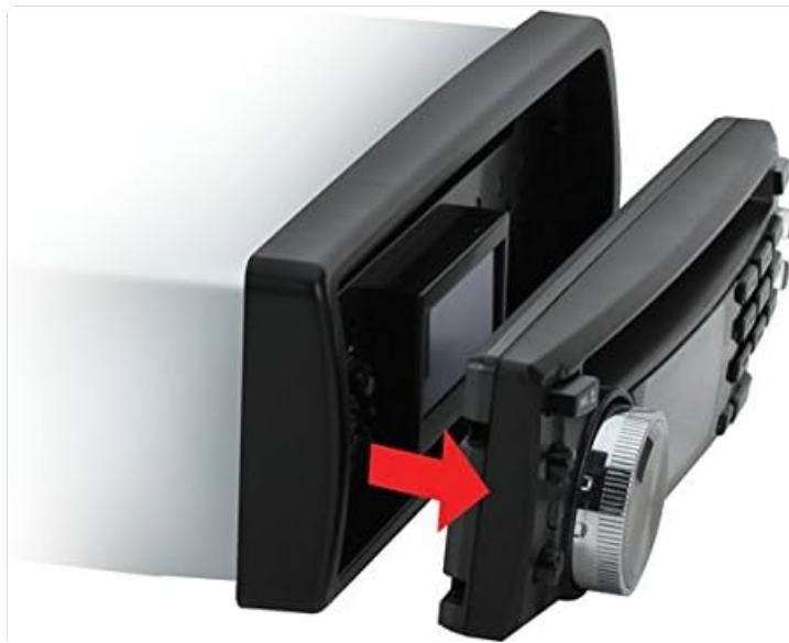
Image: Detaching the front panel. An arrow indicates the direction to pull the panel for removal.