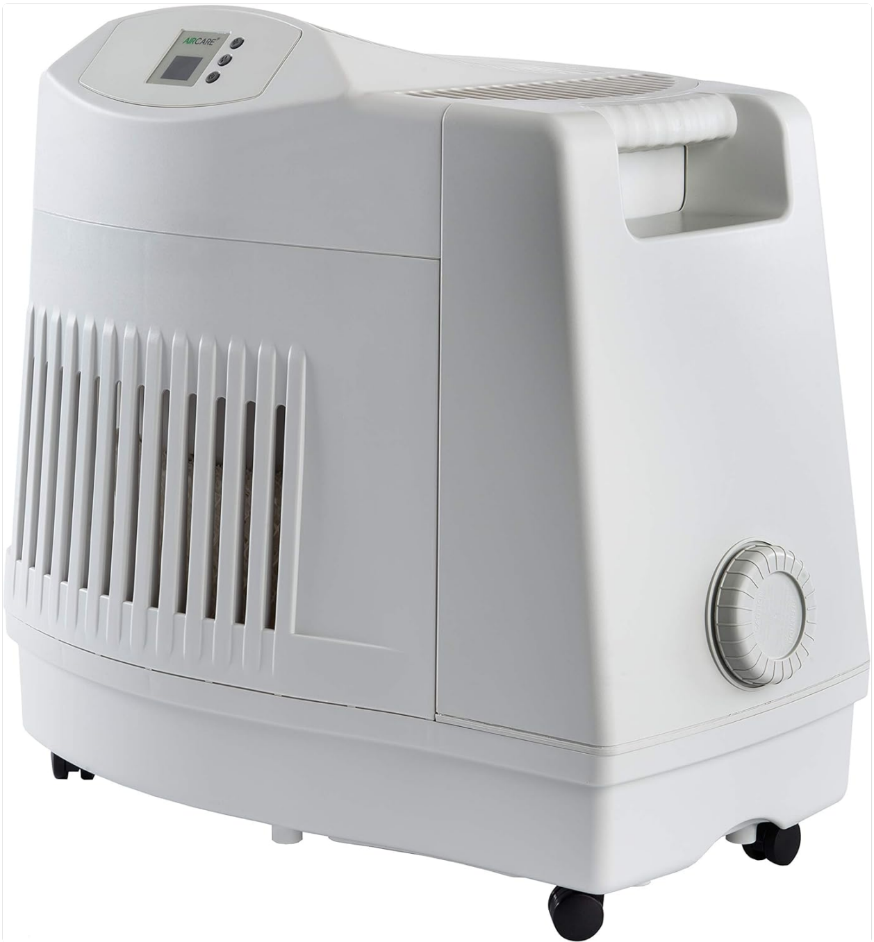
Image 4.2: Side view of the humidifier, showing the integrated handle for easy movement and access to the water tank.