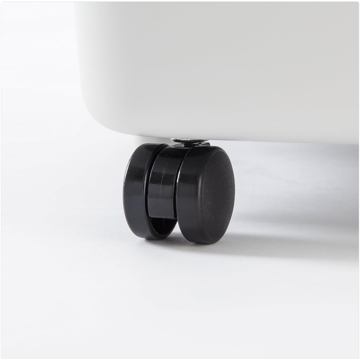
Image 4.1: Close-up view of one of the caster wheels, demonstrating its attachment point on the humidifier's base.