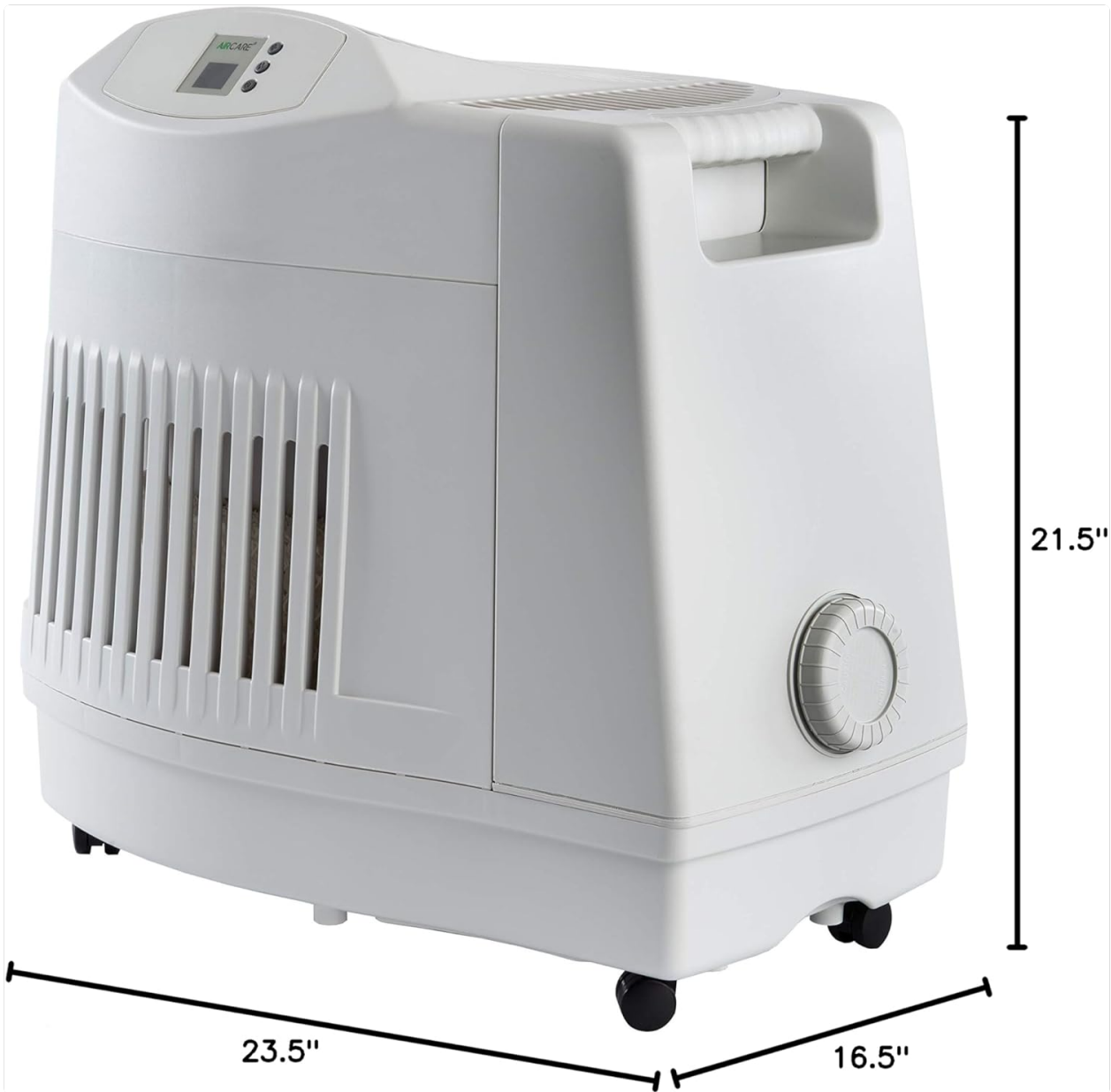
Image 8.1: Diagram illustrating the dimensions of the Aircare MA1201 Humidifier (Depth: 16.5", Width: 23.5", Height: 21.5").