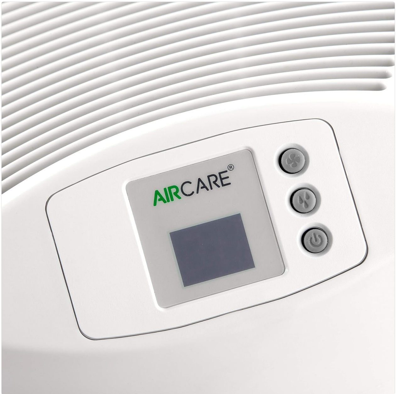
Image 5.1: Close-up of the digital control panel, showing the display and control buttons.