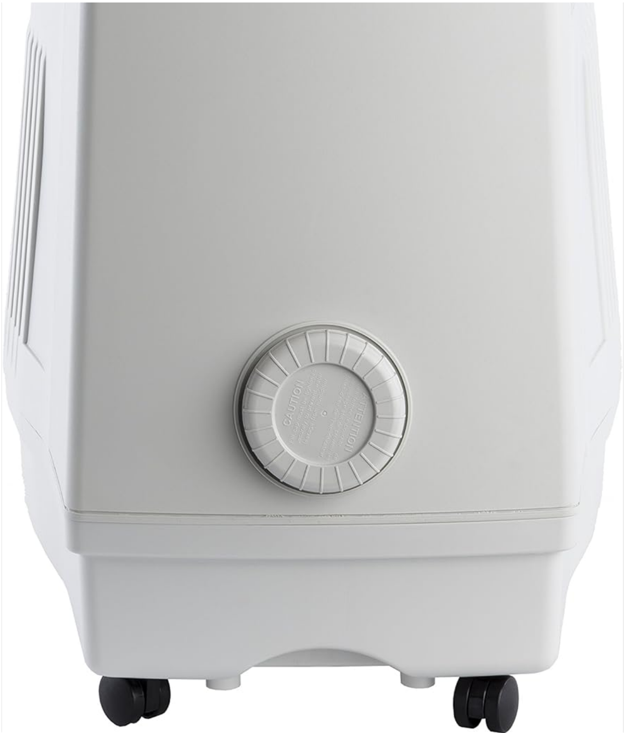
Image 4.3: Rear view of the humidifier, illustrating the power cord connection point and rear air intake.