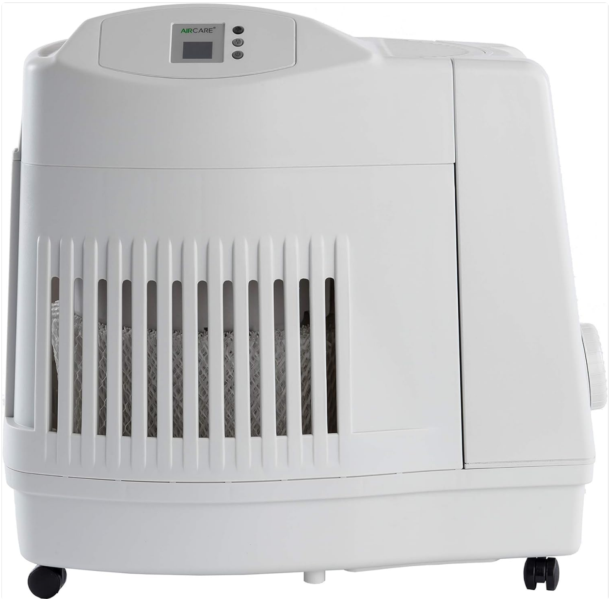
Image 1.1: Front view of the AIRCARE MA1201 Humidifier, showcasing its console design and front grille.