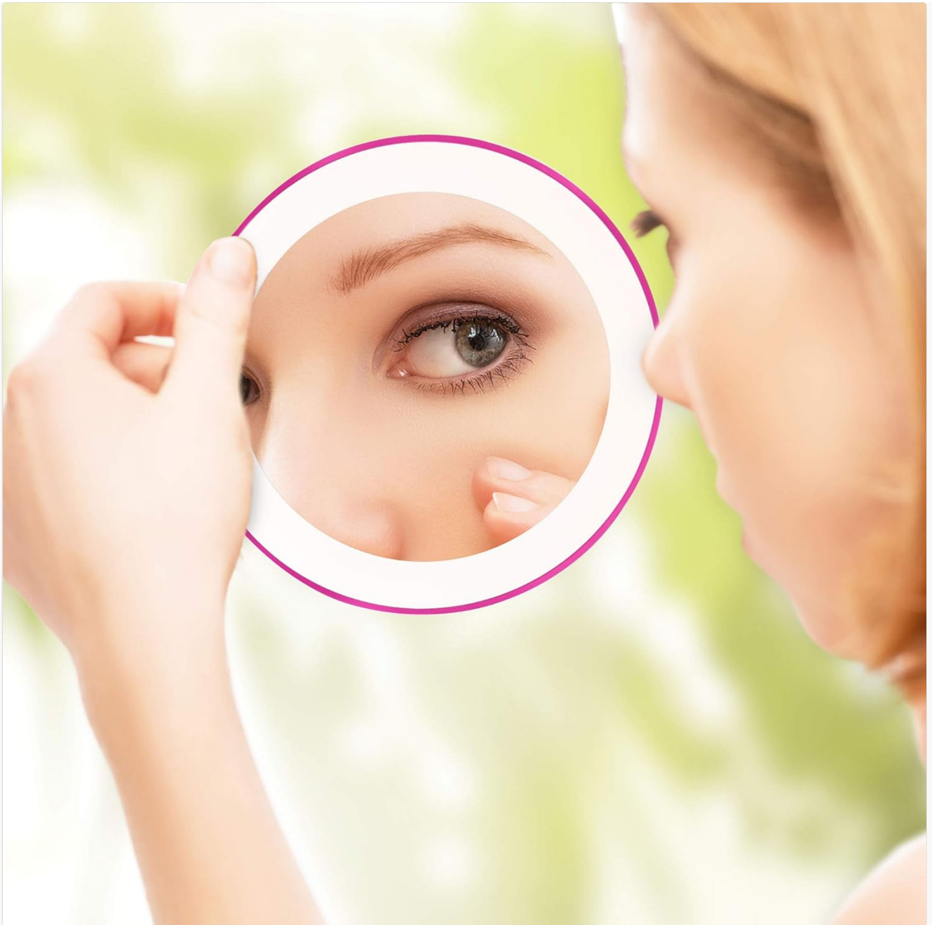
Image: Close-up view demonstrating the 10X magnification.