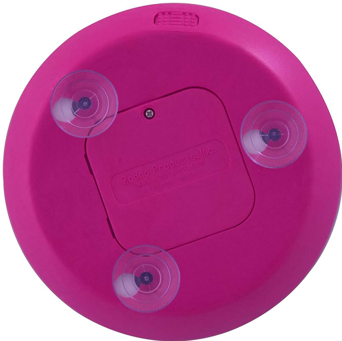
Image: Rear view of the mirror, highlighting the battery compartment and suction cups.