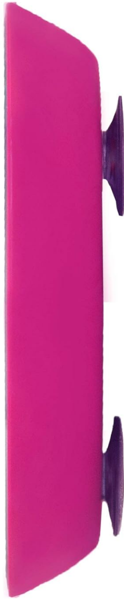
Image: Side profile of the mirror, illustrating the suction cup design.