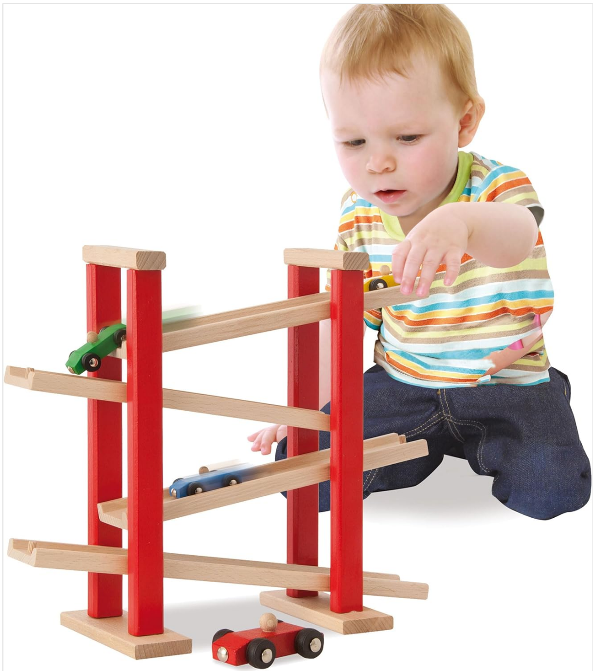
Image: A young child engaging with the Eichhorn Car Racing Track, placing a car on the top level.