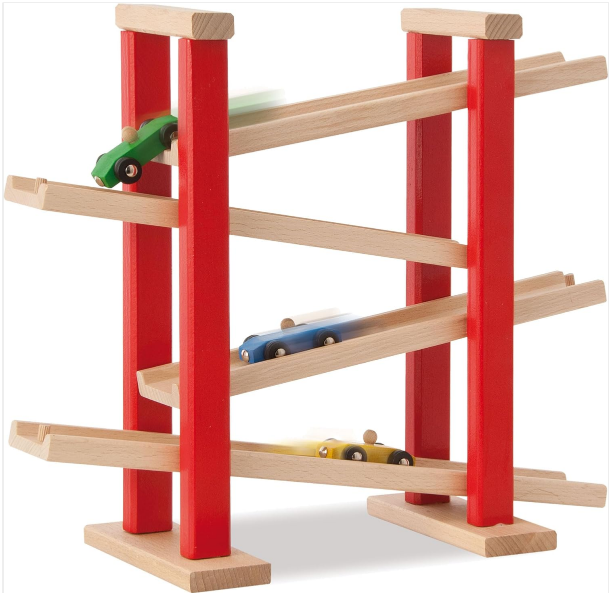
Image: The Eichhorn Car Racing Track with four wooden cars in motion on its four levels.