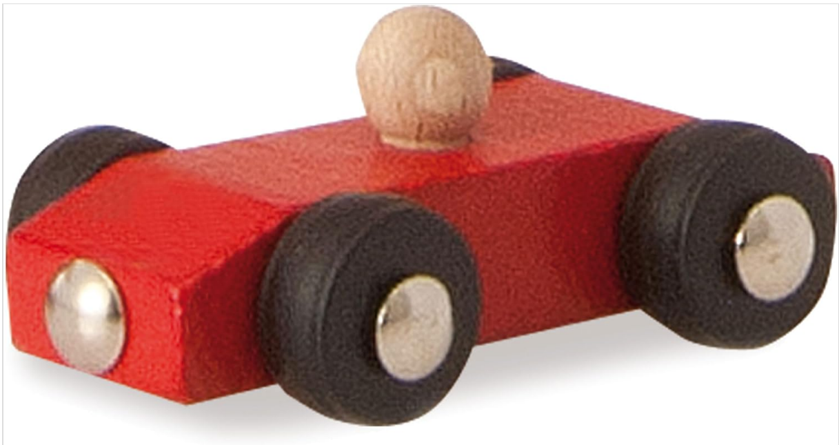
Image: A close-up view of one of the red wooden racing cars included with the track.