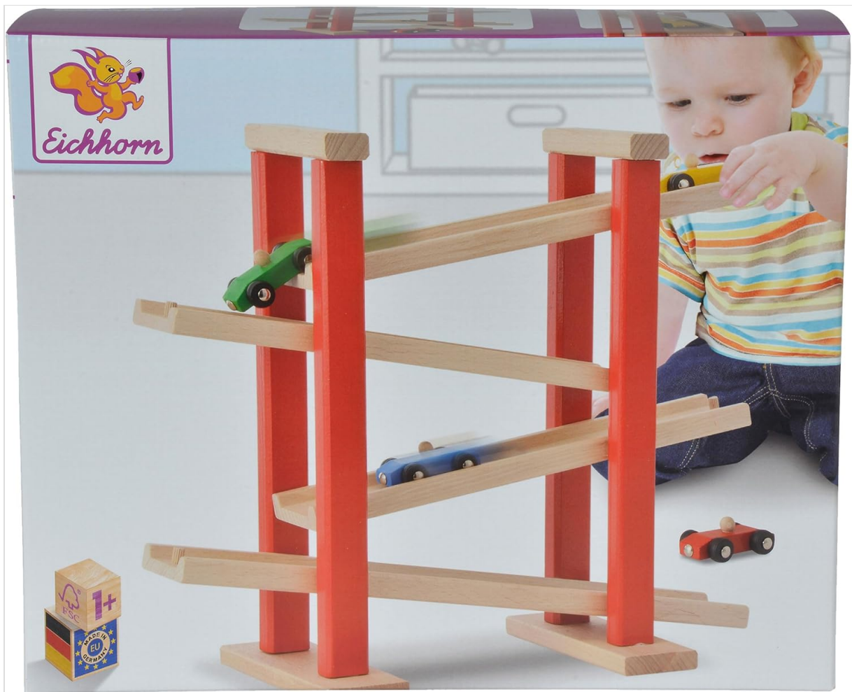
Image: The product packaging for the Eichhorn Car Racing Track, showing the assembled toy and a child playing.