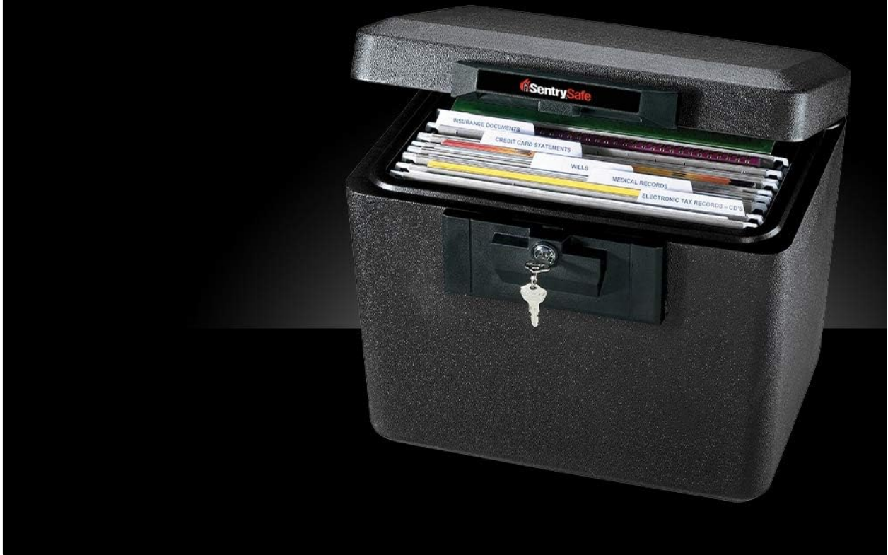
Image: The SentrySafe Fireproof Document Box with its lid open, showcasing the organized arrangement of hanging folders within its interior.

Accommodates 40 standard hanging folders