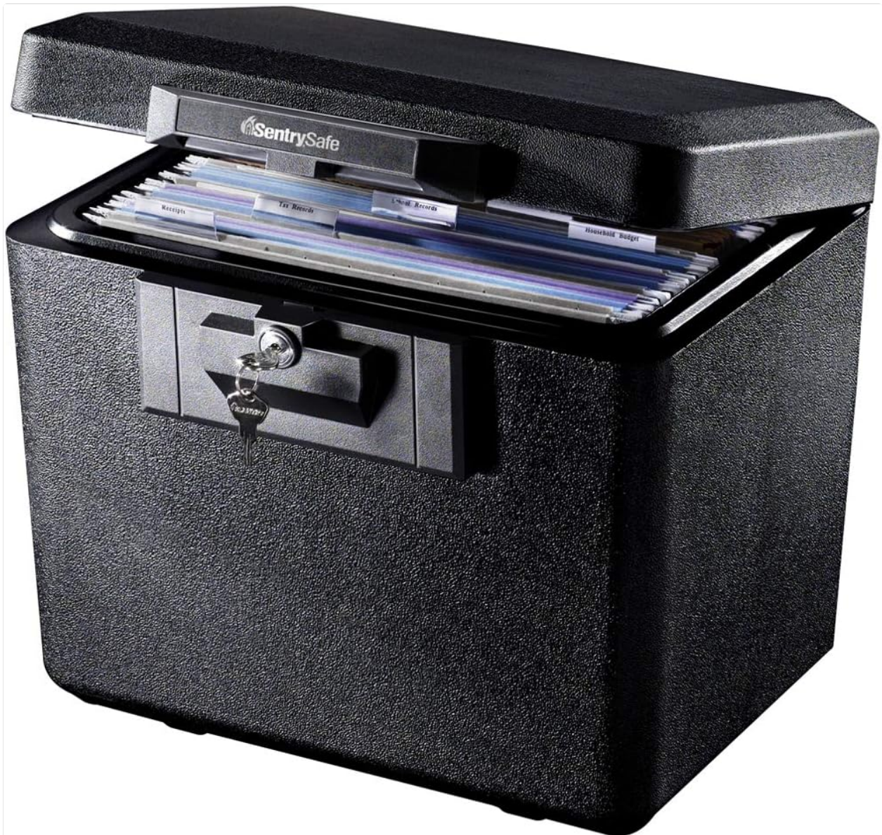
Image: The SentrySafe Fireproof Document Box with its lid open, revealing hanging files stored within. The key lock mechanism is visible on the front.