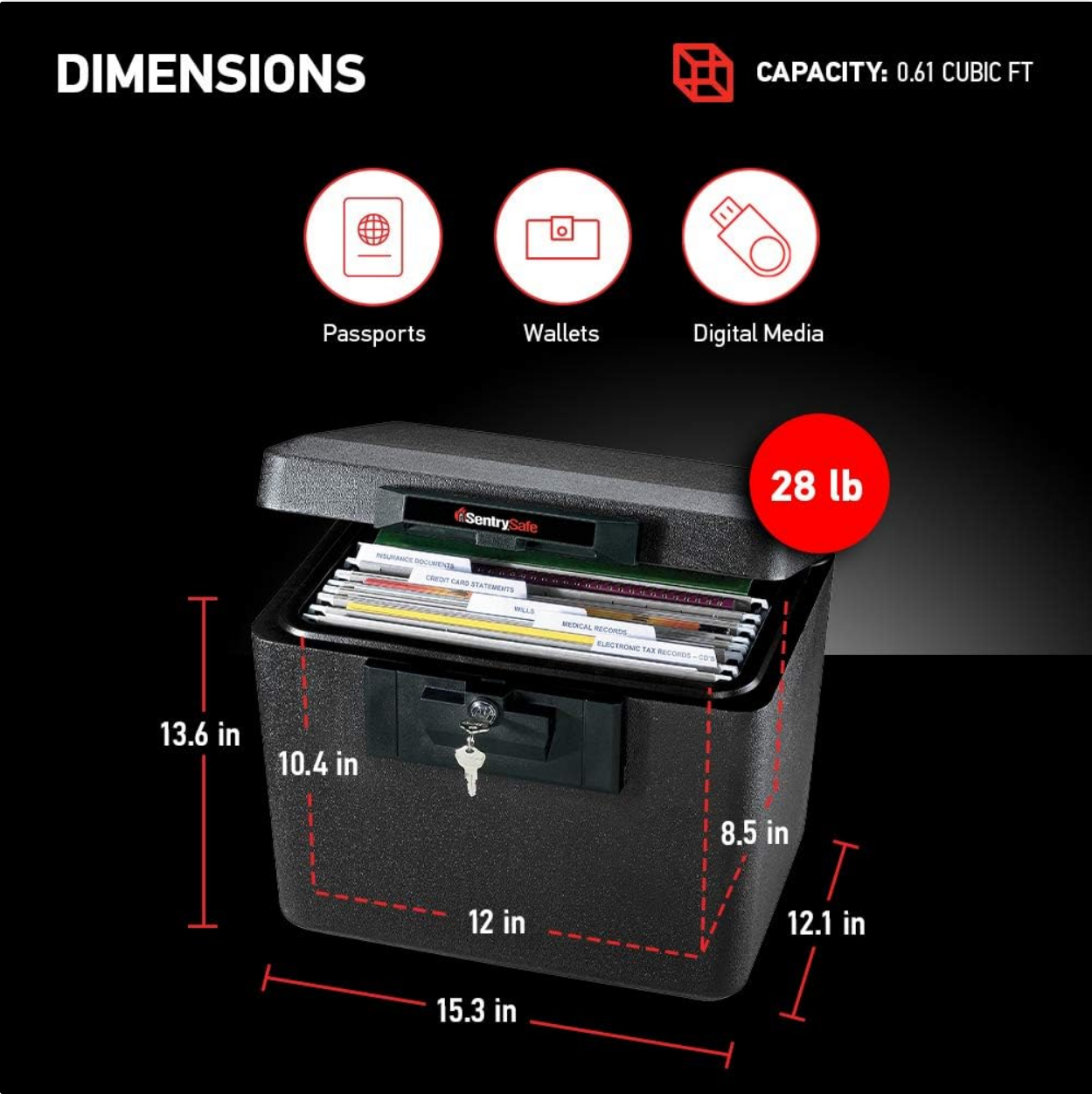
Image: A visual representation of the SentrySafe Fireproof Document Box with its key dimensions and capacity highlighted.