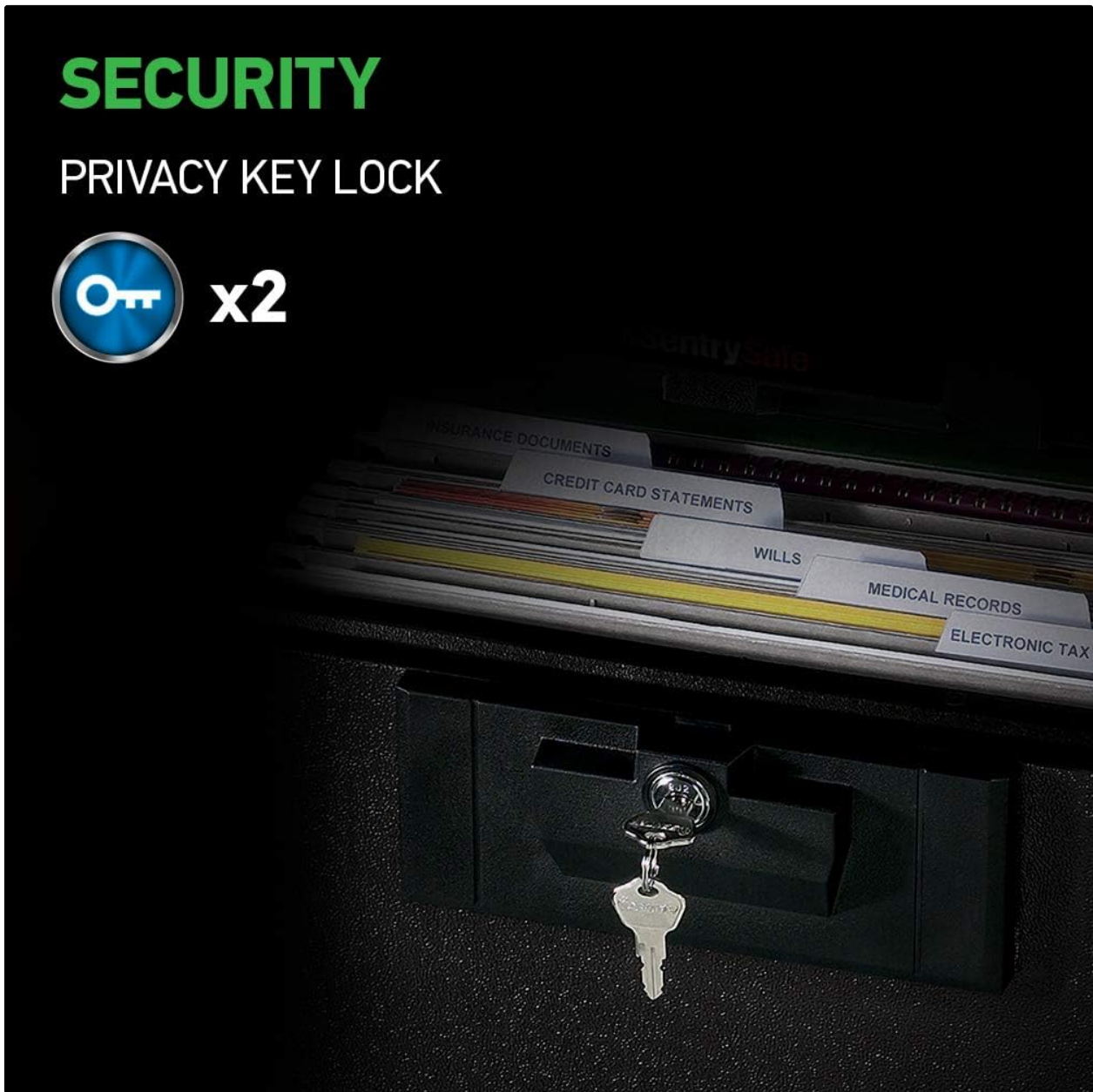
Image: A close-up view of the SentrySafe's key lock mechanism, highlighting the keyhole and the two included keys.