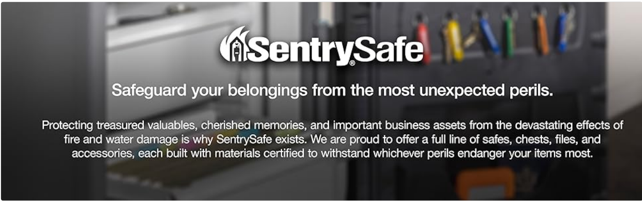
Image: A SentrySafe brand banner emphasizing the protection of valuables from fire and water damage.