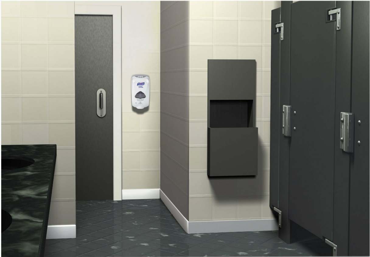
Figure 2: Dispenser installed in a commercial restroom.