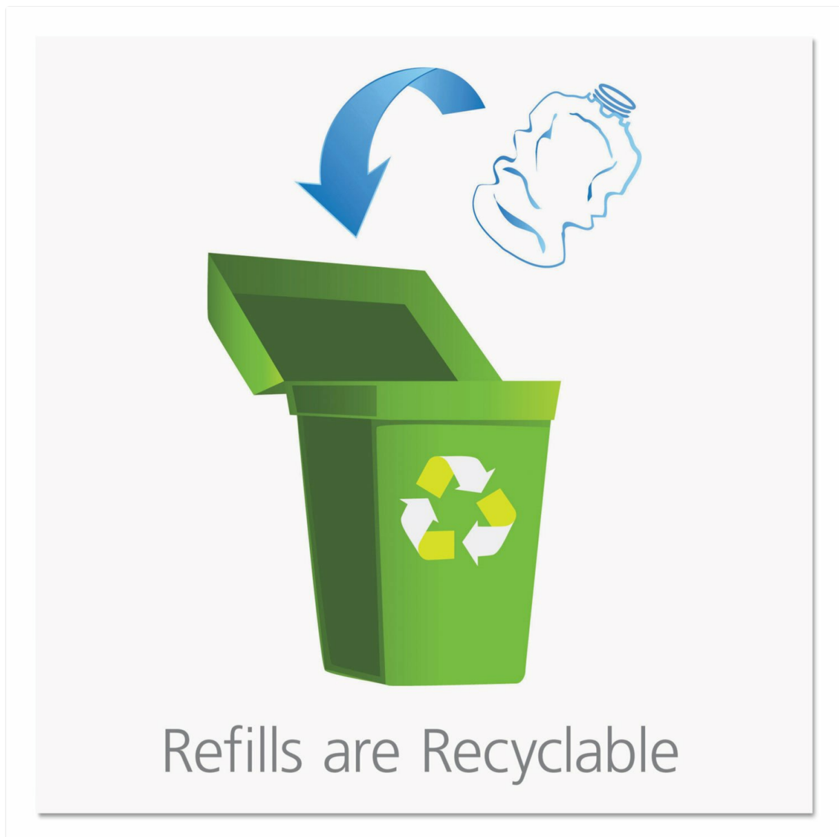
Figure 7: PURELL TFX refills are recyclable.

When the refill is empty, follow the "Refill Installation" steps in the Setup section to replace the cartridge. Ensure you use genuine PURELL TFX 1200 mL refills.