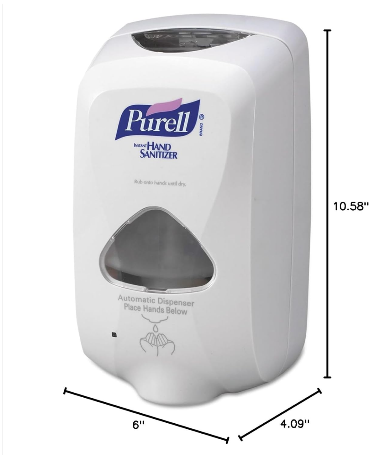
Figure 4: Dispenser dimensions: 10.58" H x 4.09" W x 6" D.