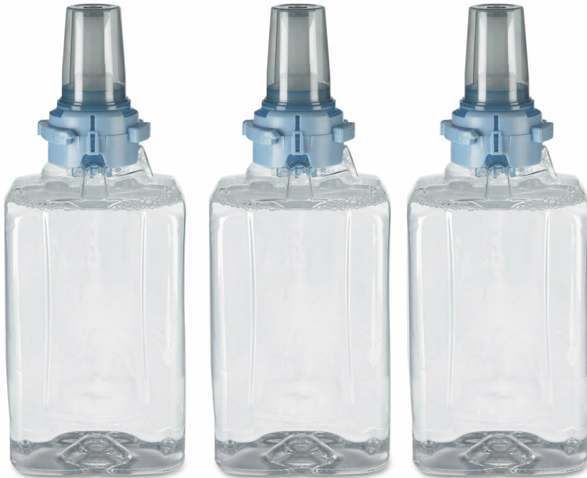
Figure 6: Example of PURELL TFX 1200 mL Foam Hand Sanitizer Refills.