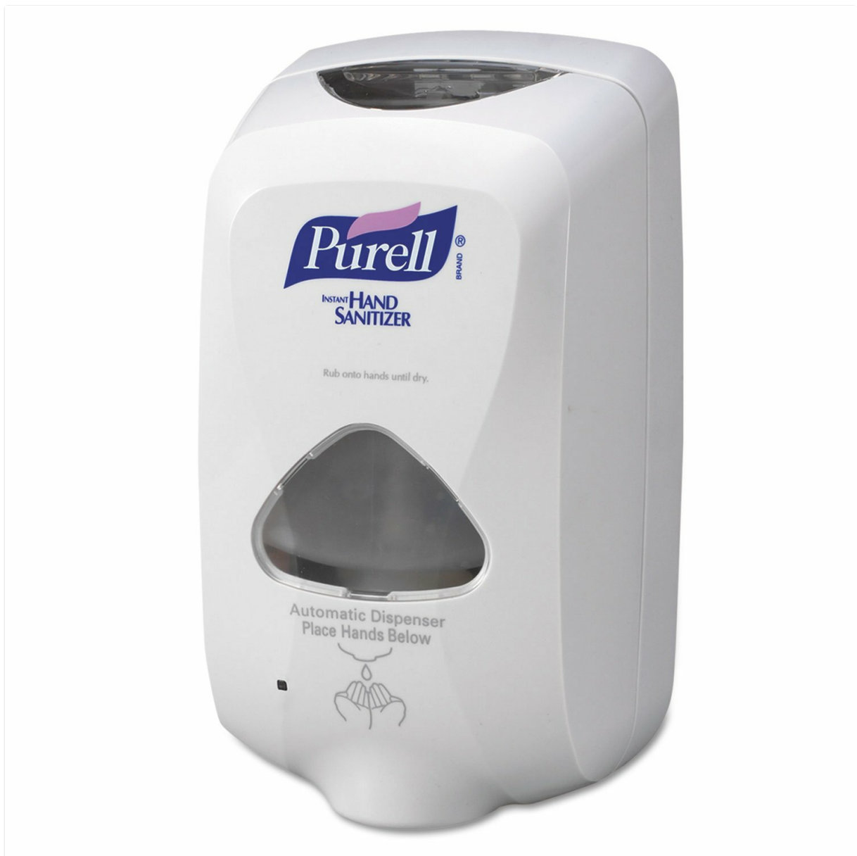
Figure 1: Purell TFX Touch-Free Foam Hand Sanitizer Dispenser.

Your browser does not support the video tag.