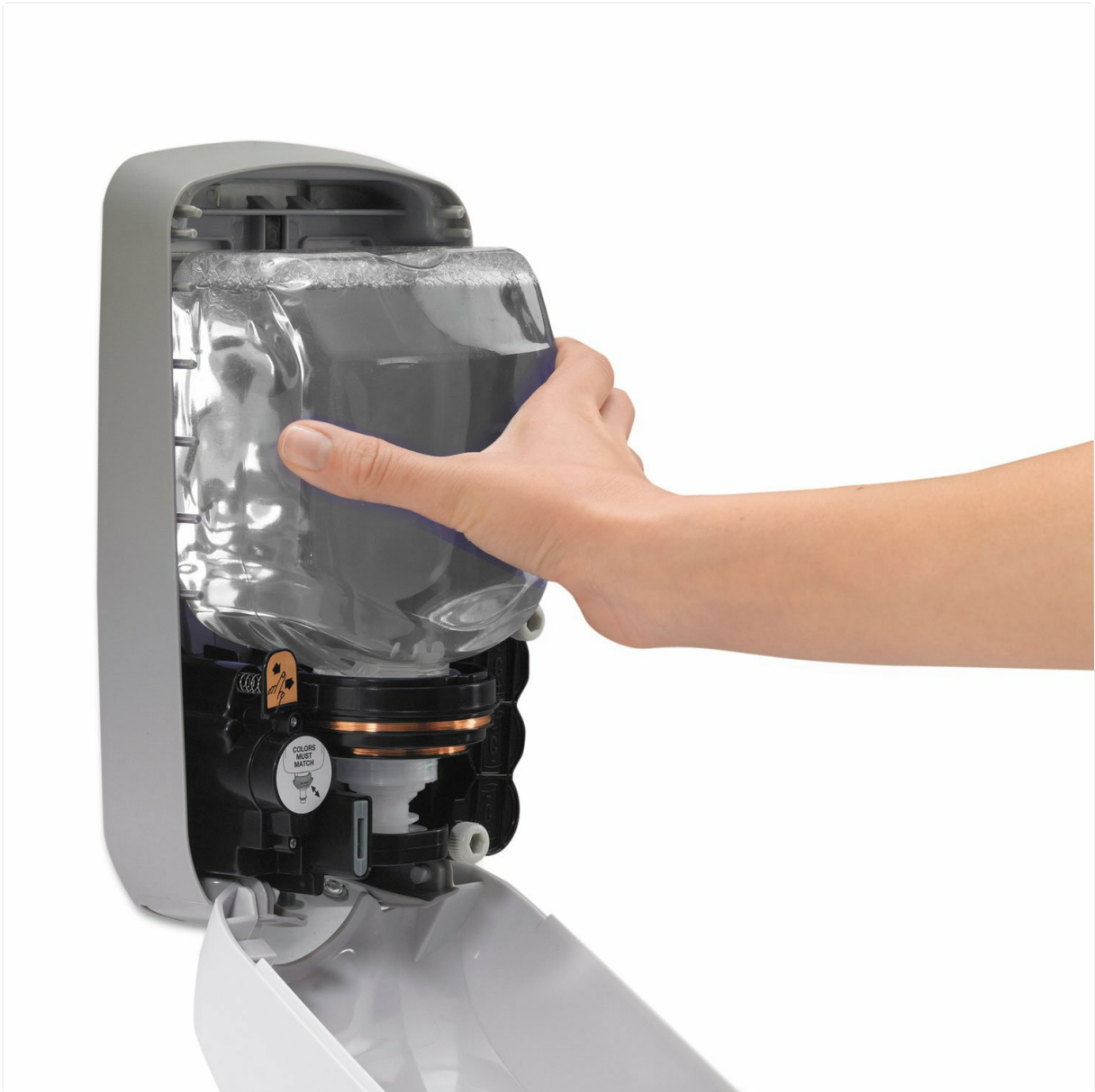
Figure 5: Inserting a refill cartridge into the dispenser.

6. Prime the dispenser by placing hands below the sensor until product is dispensed.