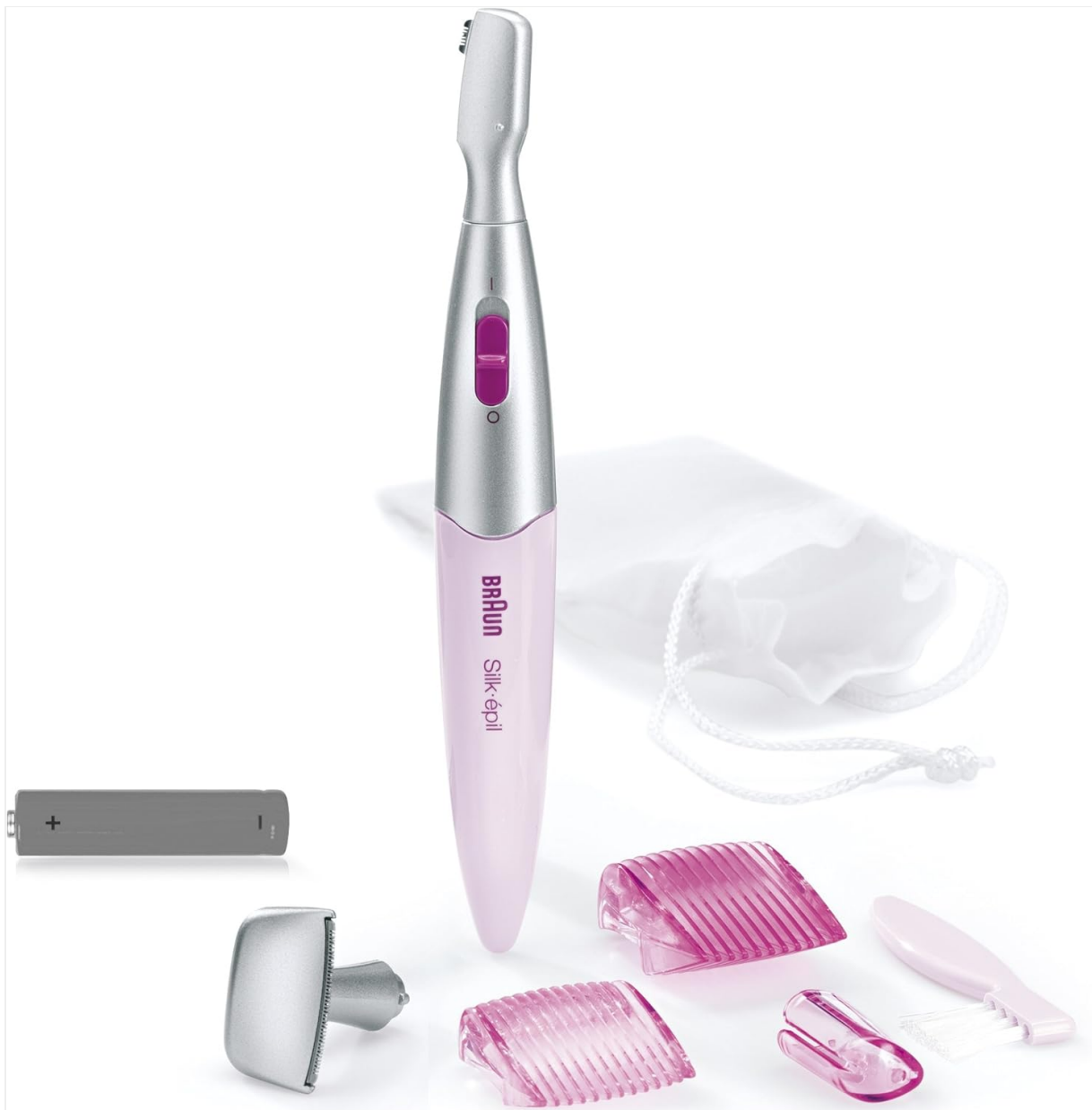
Image: The Braun Silk-épil FG1100 Bikini Trimmer shown with its main body, battery, precision head, slim bikini shaping head, two trimming combs, and a storage pouch.