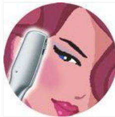
Image: The high precision head being used to shape eyebrows.

The high precision head can also be used for styling your eyebrows. Carefully trim stray hairs or shape your eyebrows by moving the trimmer gently along the desired contour. For best results, use without a comb for precise shaping.