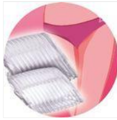
Image: The two trimming combs (5mm and 8mm) for uniform hair length.

The two bikini zone trimming combs (5 mm and 8 mm) fit over the slim bikini shaping head. These combs allow you to trim hairs to a uniform length, creating a smooth bikini line. Select the desired comb length, attach it, and move the trimmer against the direction of hair growth.