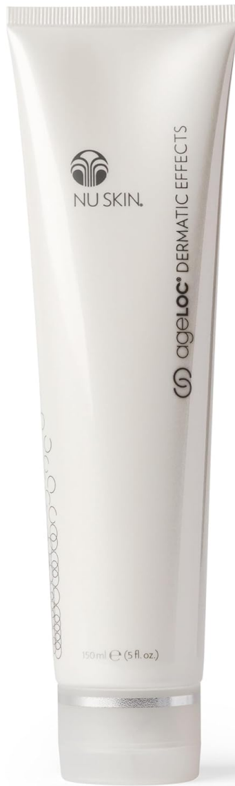
Image: Front view of the Nu Skin ageLOC Dermatic Effects Body Contouring Lotion tube.