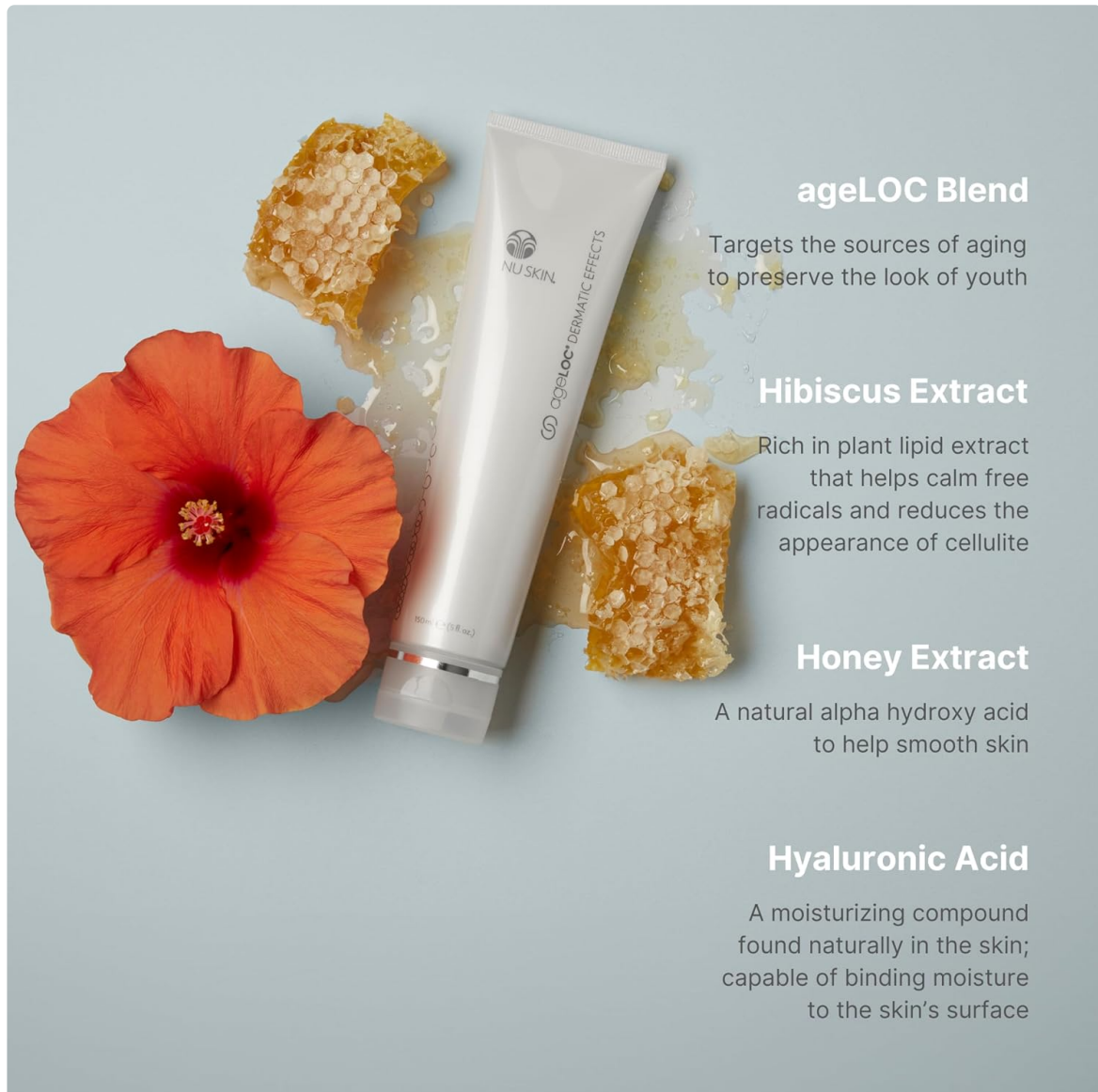
Image: Visual representation of key ingredients like ageLOC Blend, Hibiscus Extract, Honey Extract, and Hyaluronic Acid.

Juice, Sorbitan Isostearate, Polyisobutene, PEG-75 Stearate, Glyceryl Stearate, Polysorbate 60, Ceteth-20, Glyceryl Polymethacrylate, Disodium EDTA, Aminomethyl Propanol, Fragrance (Parfum), Phenoxyethanol, Chlorphenesin.