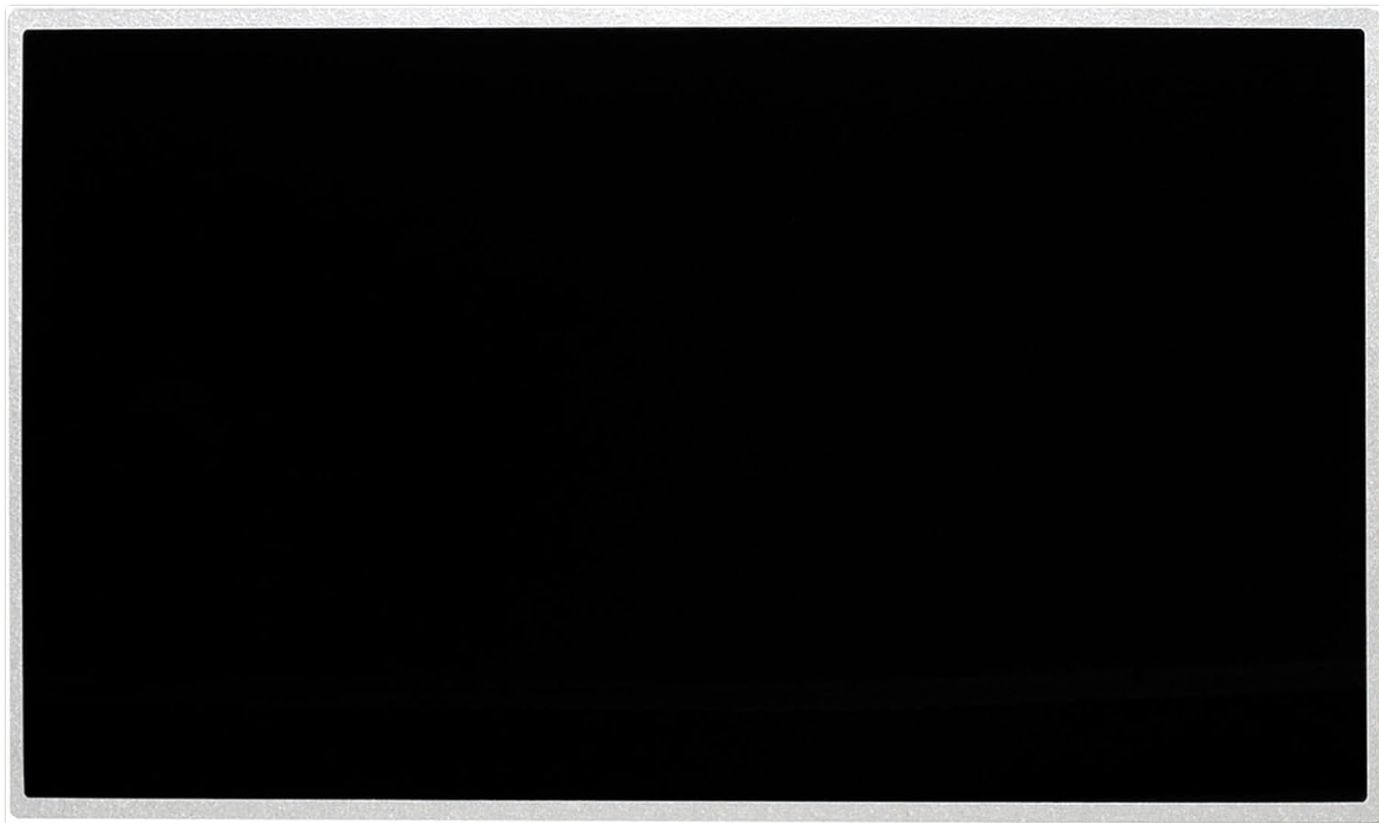
Figure 1: Front view of the replacement LCD screen, showing the display area and slim bezels.

This manual provides instructions for the installation, maintenance, and troubleshooting of the Acer Aspire 7741z-4643 replacement laptop LCD screen. This product is a 17.3-inch WXGA++ LED DIODE display designed as a substitute replacement for compatible Acer Aspire 7741z-4643 laptop models. Please read all instructions carefully before proceeding with installation.