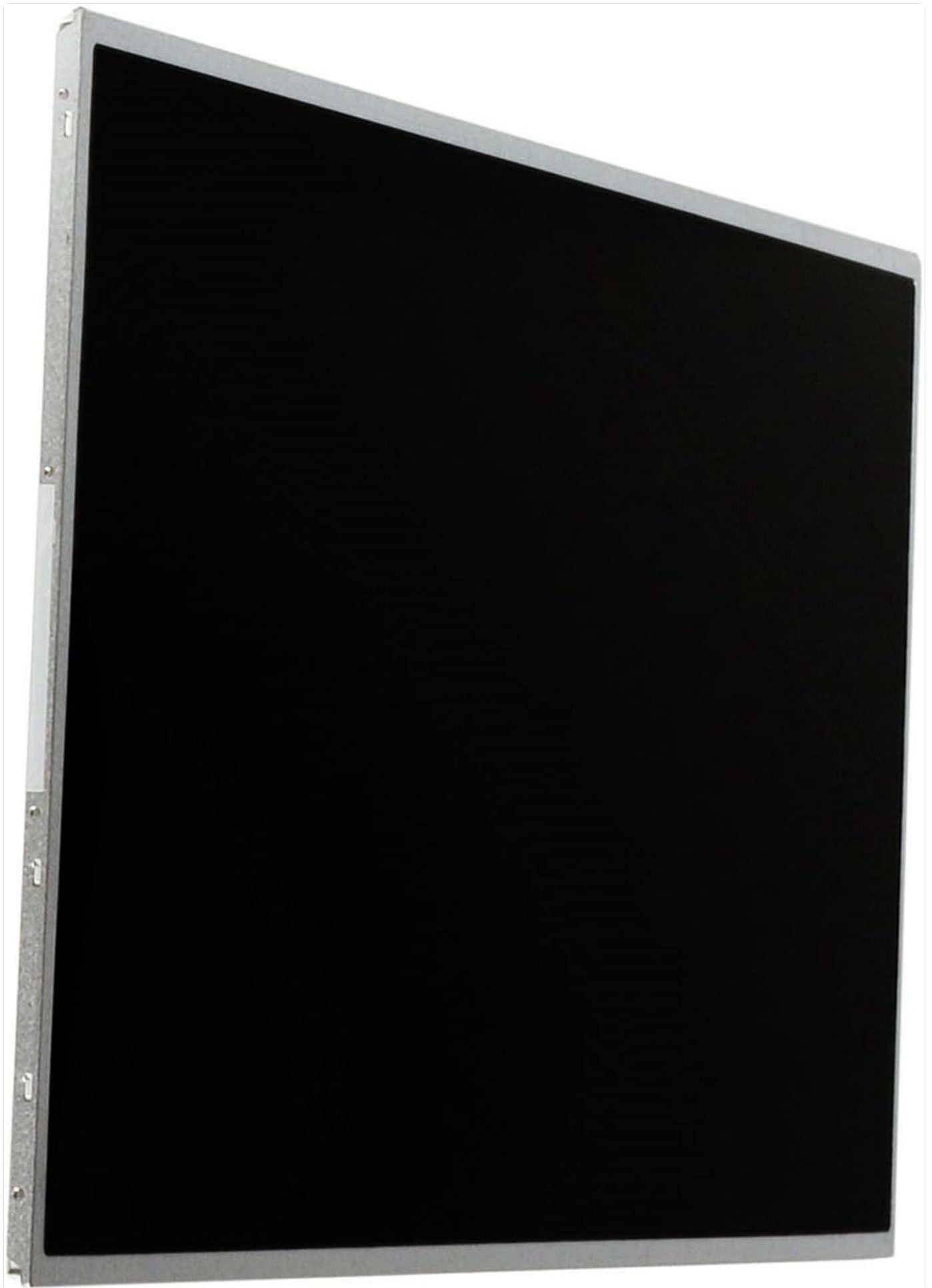
Figure 3: Side profile of the replacement LCD screen, illustrating its slim design.