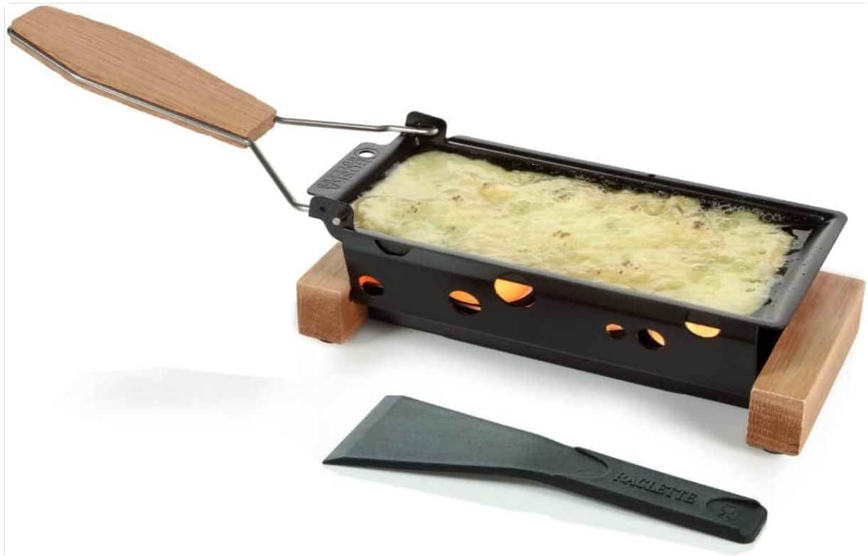
Figure 1: Assembled Boska Partyclette To Go Raclette Grilling Set with melted cheese and spatula.

Video 1: Overview of the Boska Holland Partyclette To-Go Taste, Mini Tea Light Raclette Set, demonstrating its compact design and ease of assembly.