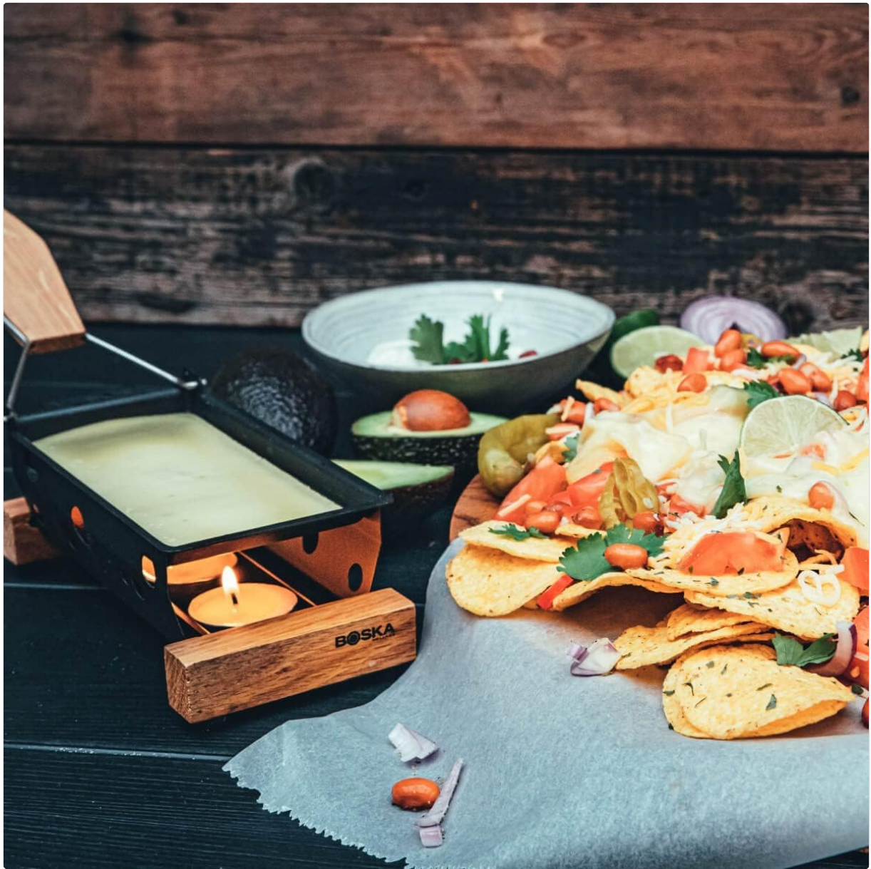
Figure 4: The raclette set in use, melting cheese to be served with nachos and other accompaniments.

Video 2: Demonstration of the Partyclette ToGo Vienna, showcasing its use for melting cheese and serving with various foods.