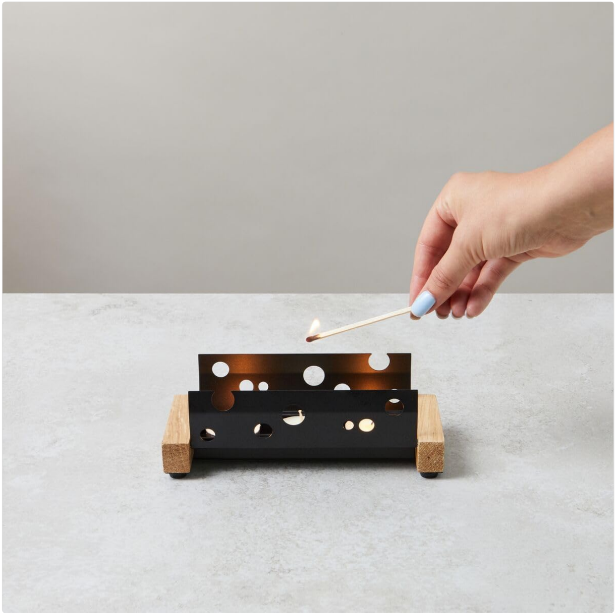
Figure 2: A hand lighting the tea lights within the raclette base, initiating the heating process.