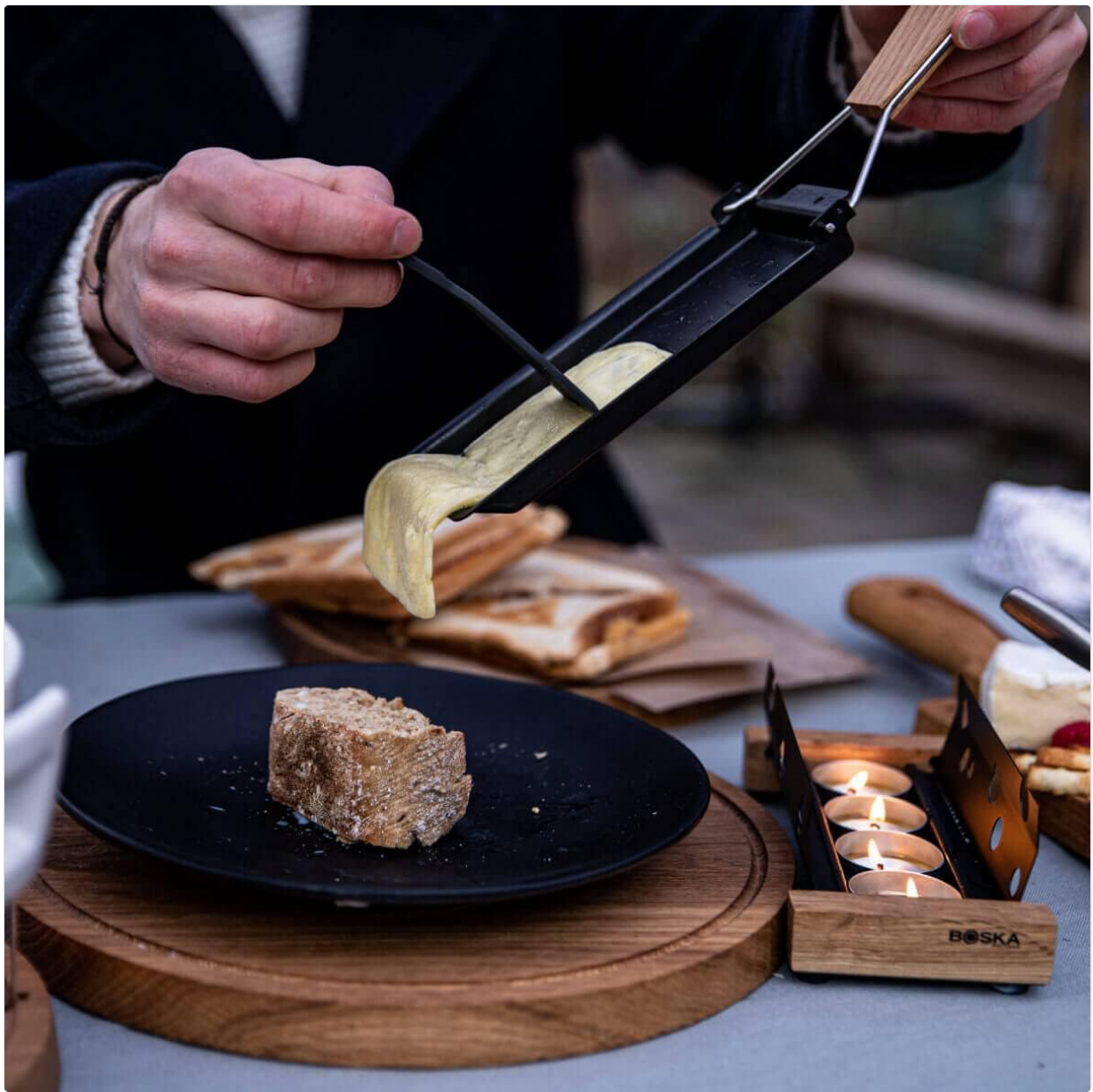
Figure 3: A person using the spatula to scrape melted cheese from the raclette pan onto a piece of bread.