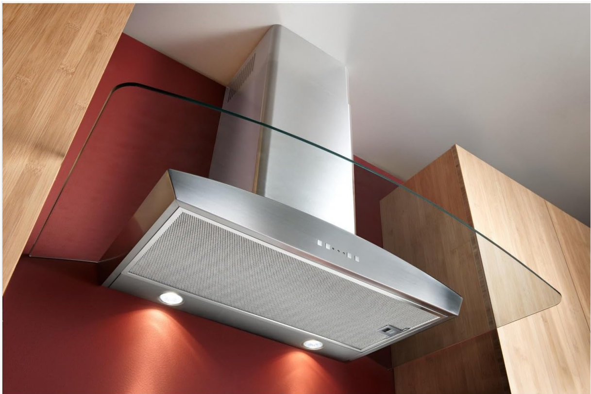
A view of the underside of the range hood, highlighting the quick-release aluminum mesh filters and the dual halogen lights.