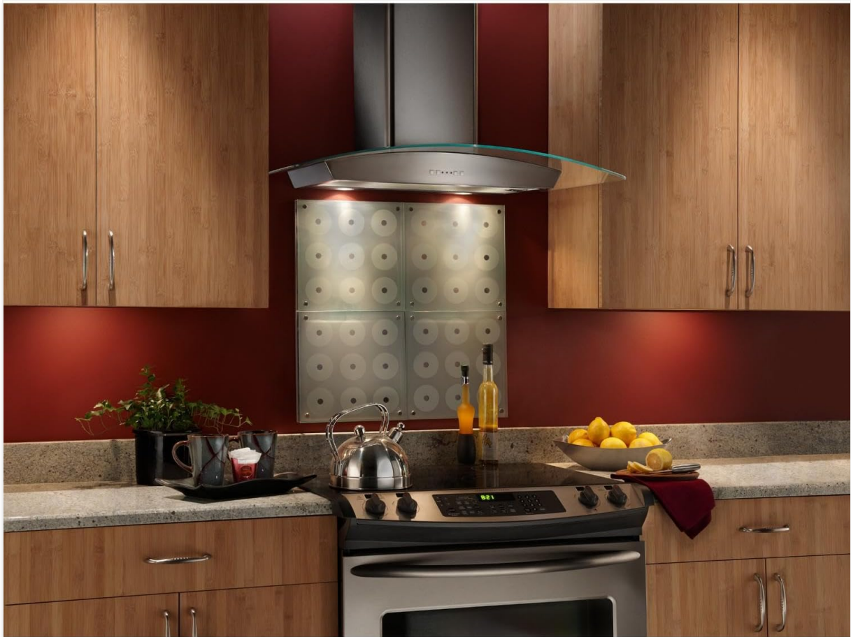
The Broan-NuTone EW5630SS Range Hood seamlessly integrated into a modern kitchen setting, demonstrating its aesthetic appeal and functional placement above a stove.