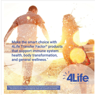
Image 6: Lifestyle image promoting 4Life Transfer Factor products for immune system health and general wellness.