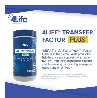
Image 4: 4Life Transfer Factor Plus Tri-Factor Formula with Zinc, highlighting its role in balancing and supporting the immune system.