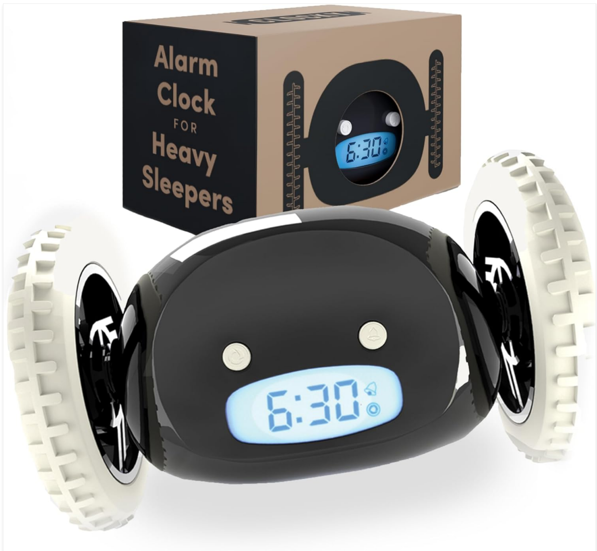
Image: A black Clocky alarm clock with white wheels displayed in front of its brown and black packaging box. The clock's digital display shows "6:30".