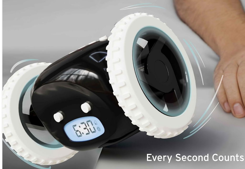
Image: A hand pressing buttons on the top of a black Clocky alarm clock to set the time. The digital display shows "6:30".