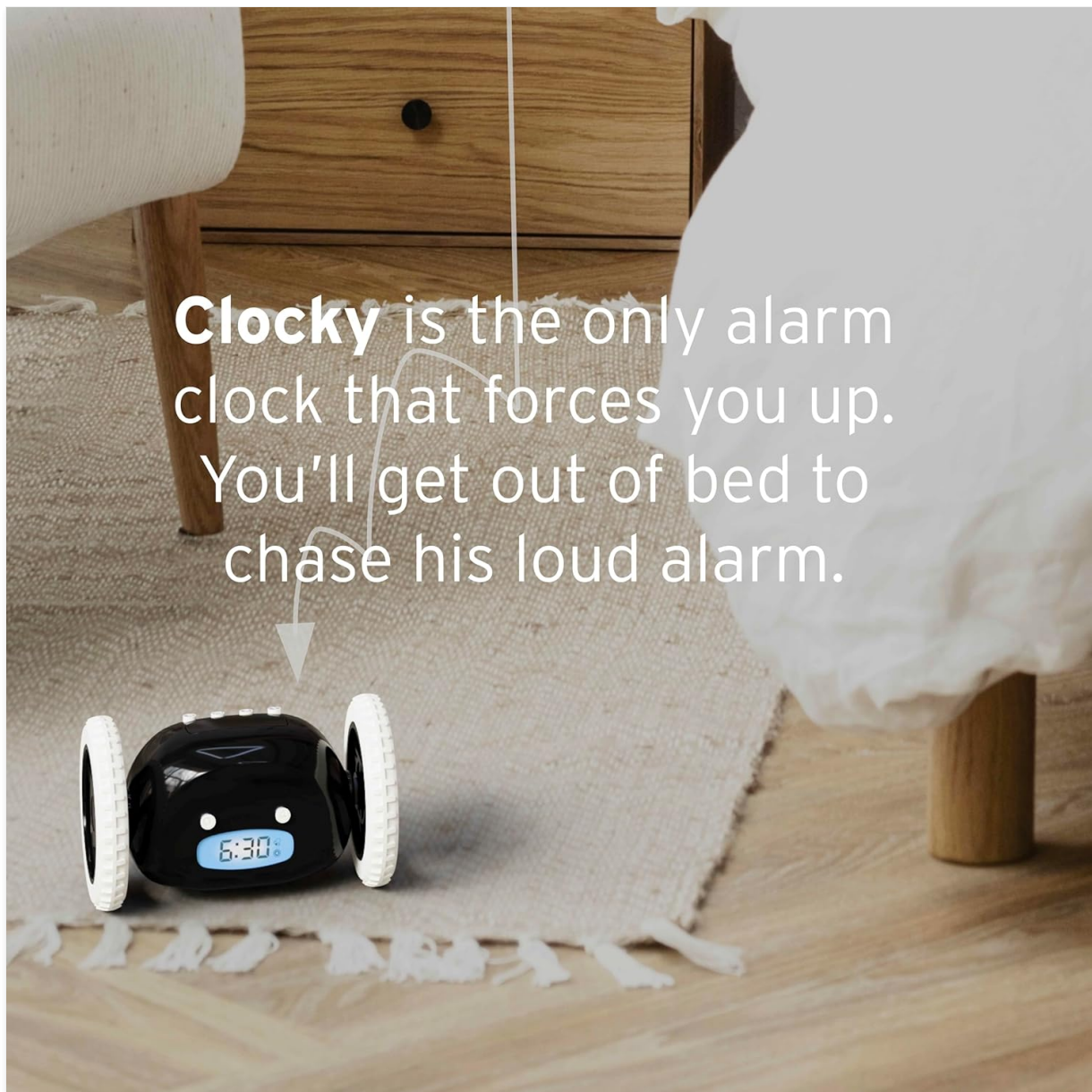
Image: A black Clocky alarm clock on a rug next to a bed, with text overlay stating "Clocky is the only alarm clock that forces you up. You'll get out of bed to chase his loud alarm."