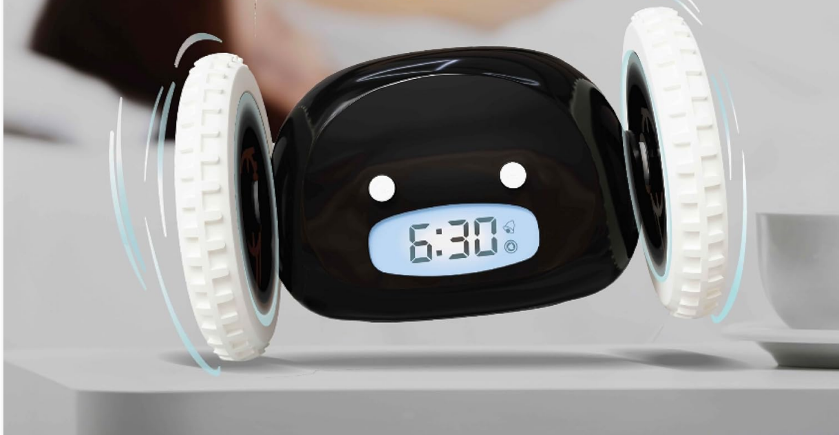
Image: A black Clocky alarm clock on a white surface, with three circular icons above it. The icons represent "LOUD ALARM" (bell), "JUMPS RUNS" (two circles with a line), and "EASY SET UP" (a checkmark). The clock's digital display shows "6:30".